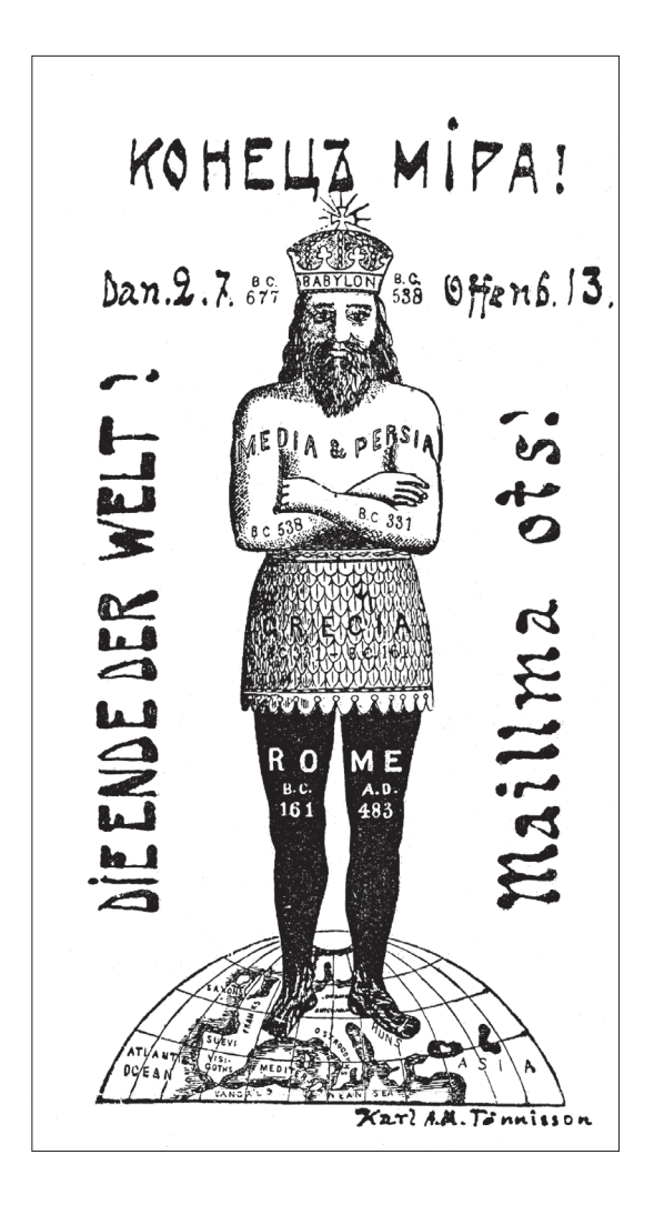
Figure 2. The image seen by King Nebuchadnezzar in his dream.

gigantic state) was about to emerge in approximately ten years of time, with Greater Germany and other new unions to follow.