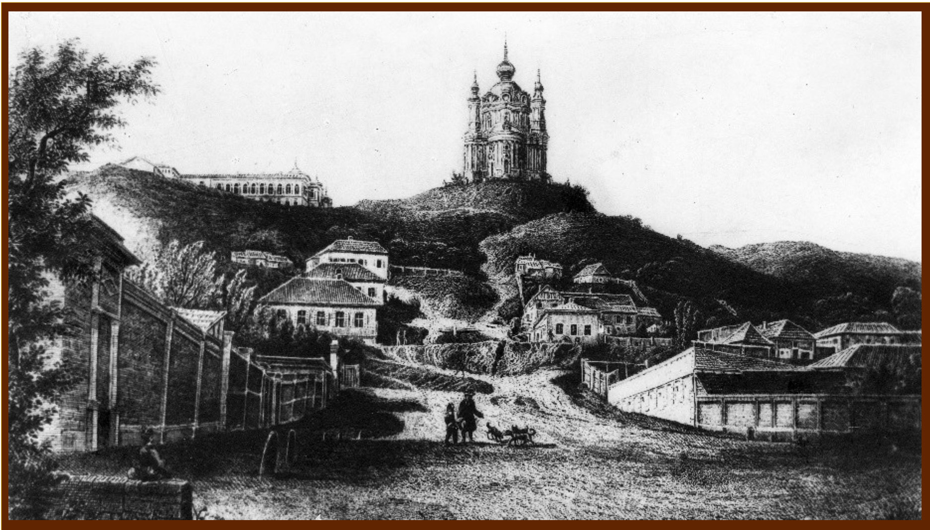
Andriivs`ka Church, photo from the 1850s, lithography.

URL: https://www.pinterest.ca/pin/426927239659326576/