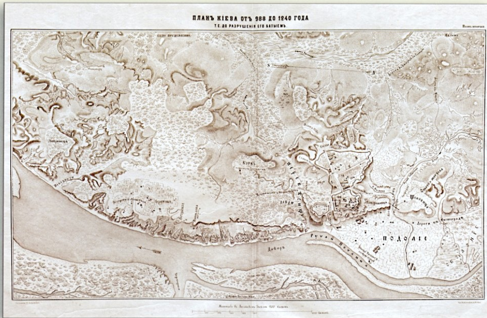
План Киева от 988 до 1240 гг. Рис. Н. Закревского

Kyiv is the capital of Ukraine with a long-lasting history, both the city and the country. According to chronicles, Kyiv was founded at the end of the 5th century.