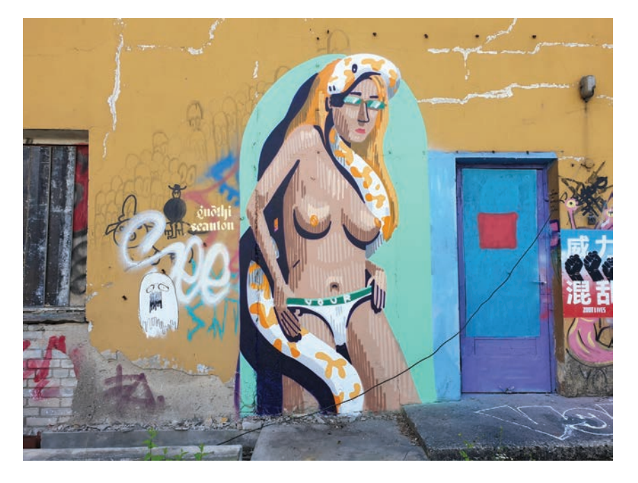
Figure 36. Former "Kaseke" restaurant, Lootuse Street, Tartu. Photograph by Piret Voolaid 2019.