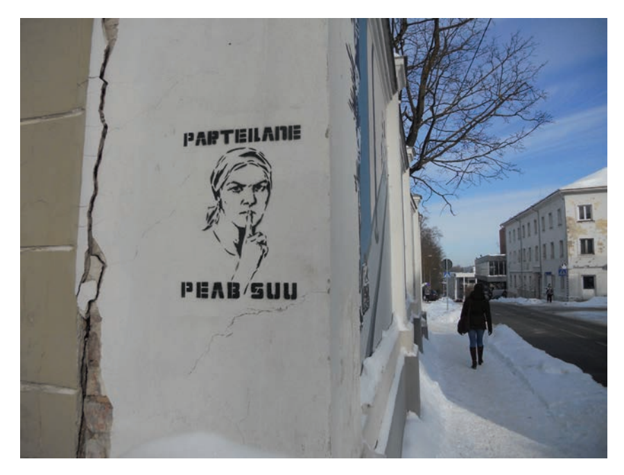
Figure 21. Tartu Writers' House, 19 Vanemuise Street, Tartu.