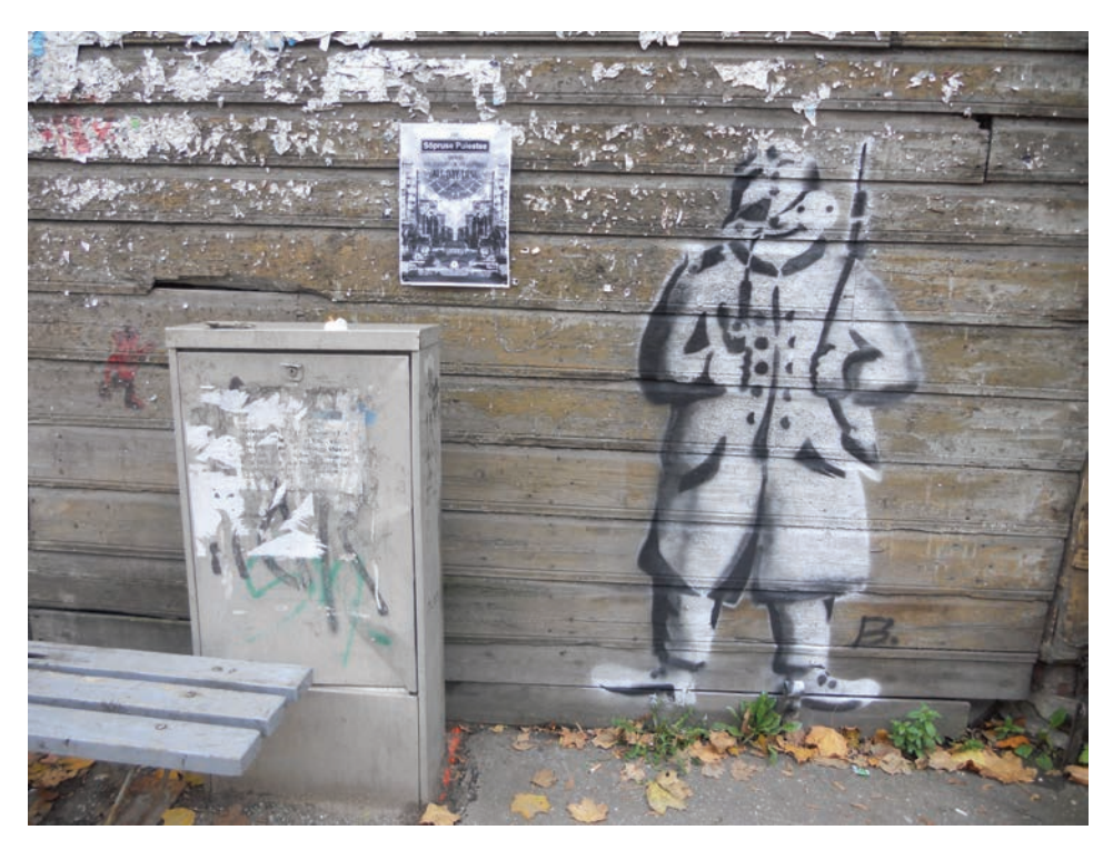
Figure 9. Riiamäe bus stop, Võru Street, Tartu.

Sometimes, however, representations of masculinity can be more ambivalent. For example, man as a soldier is depicted, among other things, as the good soldier Švejk (Fig. 9). The Czech writer Jaroslav Hašek in his satire The Fateful Adventures of the Good Soldier Švejk during the World War (1923) ridicules human stupidity and social institutions, authority and power hierarchies through its simple-minded main character, soldier Švejk, who either is an idiot or pretends to be one (the book does not unequivocally lay it down). The character of Švejk is highly unique, since in a way he also ridicules traditional masculinity: as a soldier he is not strong, courageous, and heroic as one would expect a wartime hero to be, but quite the opposite – he is both mentally and physically inept, finds himself in all kinds of trouble, asks inappropriate questions, and does not seem to understand anything.