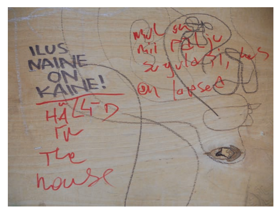
Figure 17. Vallikraavi Street, Tartu. Photograph by Piret Voolaid, April 2012.