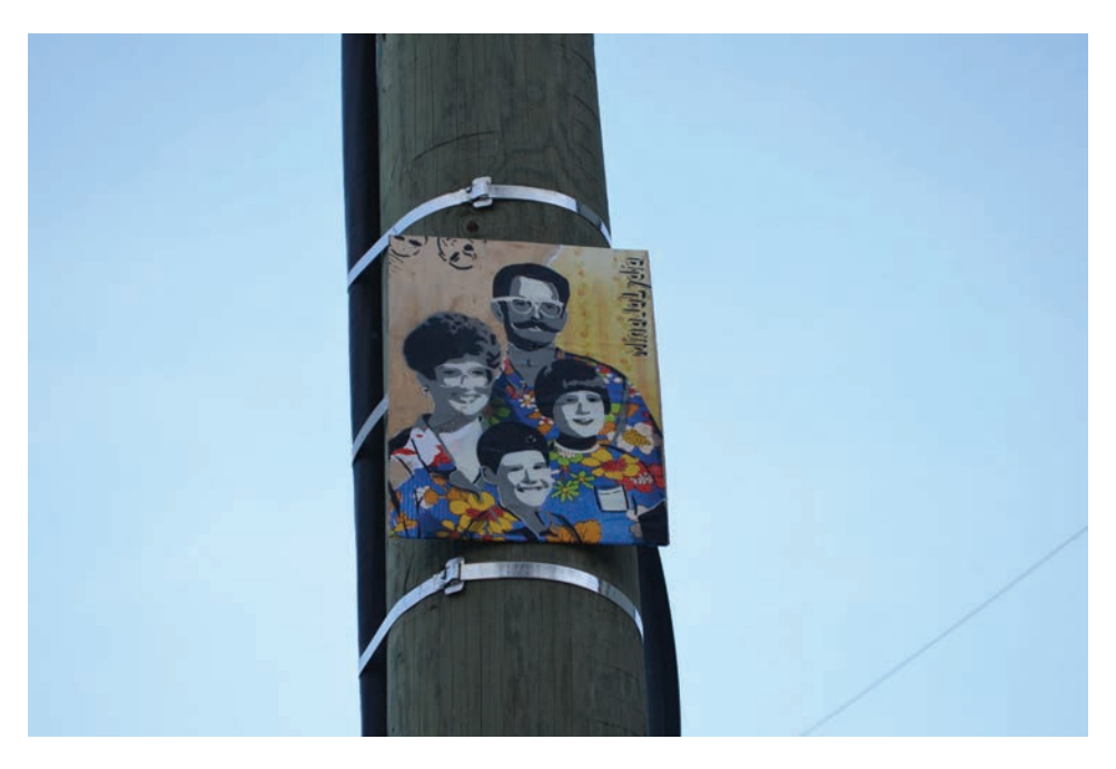
Figure 29. The corner of Tähe and Pargi streets, Tartu. Photograph by Piret Voolaid, February 2013.