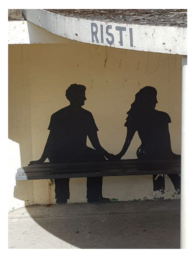
Figure 11. Risti bus stop, photograph taken through a bus window. Photograph by Siiri Pärkson, April 2019.

In some works, a man and a woman are depicted as equal partners, such as the image of the figures of a man and a woman sitting together and holding hands in the Risti bus stop in western Estonia (Fig. 11). The figures are painted in a way that they look like people sitting on the bench and waiting for the bus, whereas the gender of both is marked: the woman has long flowy hair and thin arms, whereas the figure of the man with short hair is more robust.