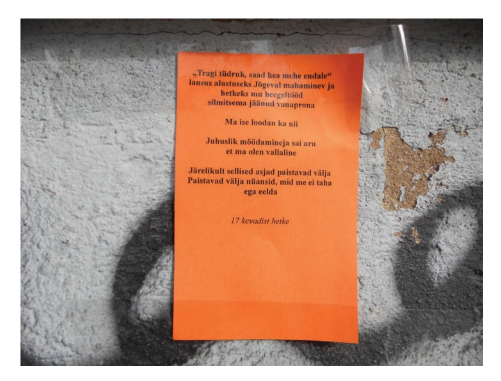
Figure 20. On the corner of Tähe and Pargi streets, Tartu. Photograph by Piret Voolaid, April 2012.