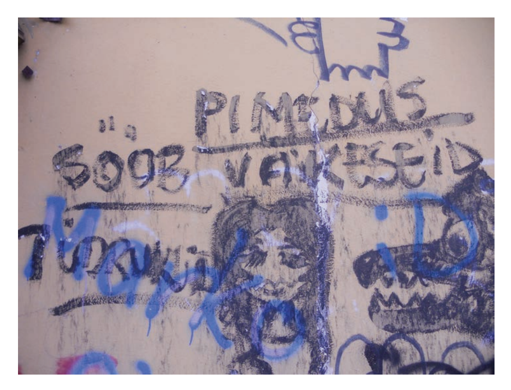
Figure 28. Former "Kaseke" restaurant, Lootuse Street, Tartu.