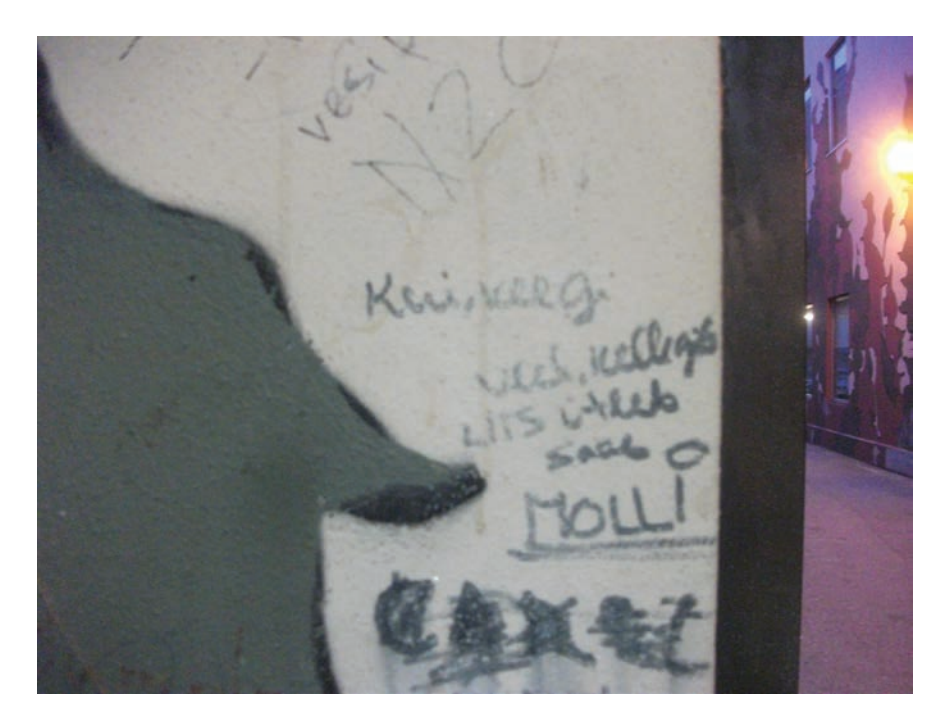
Figure 35 . Wall of the former shopping centre Kaubahall, Tartu. April 2013.