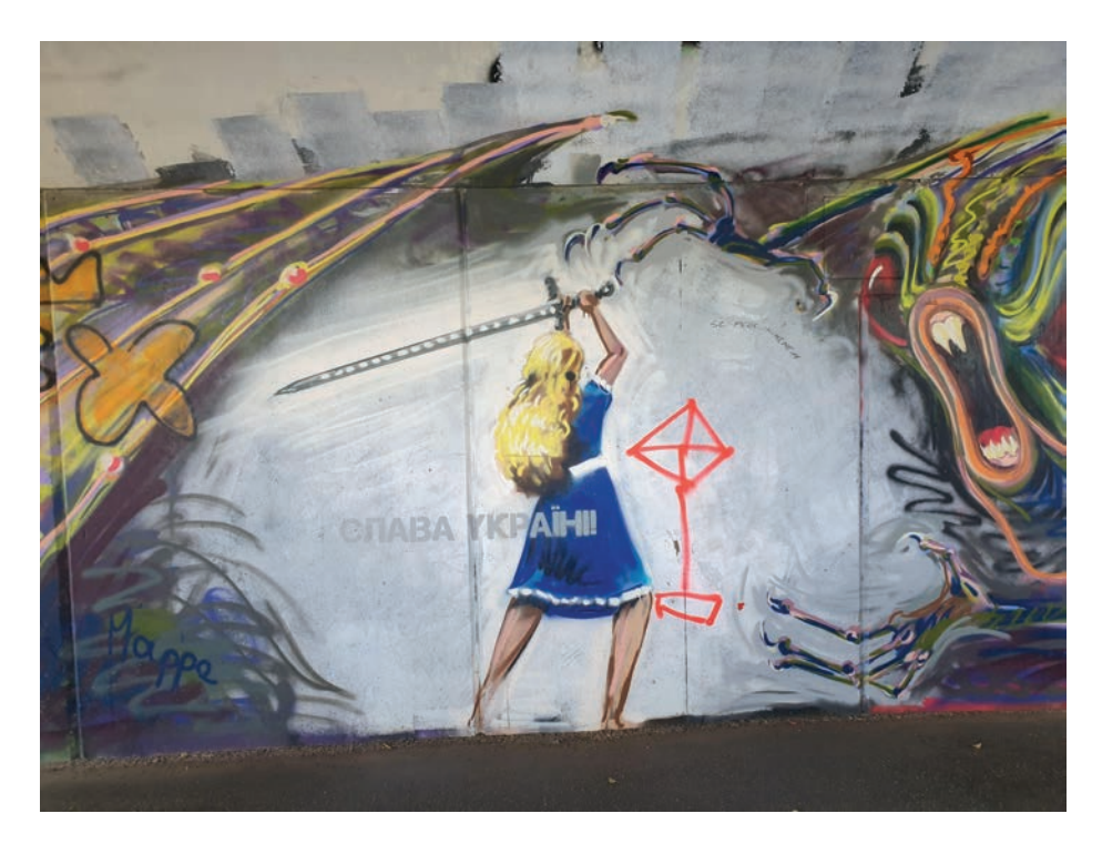
Figure 32. Glory to Ukraine! Under the Kroonuaia Bridge, Tartu. Photograph by Piret Voolaid 2023.