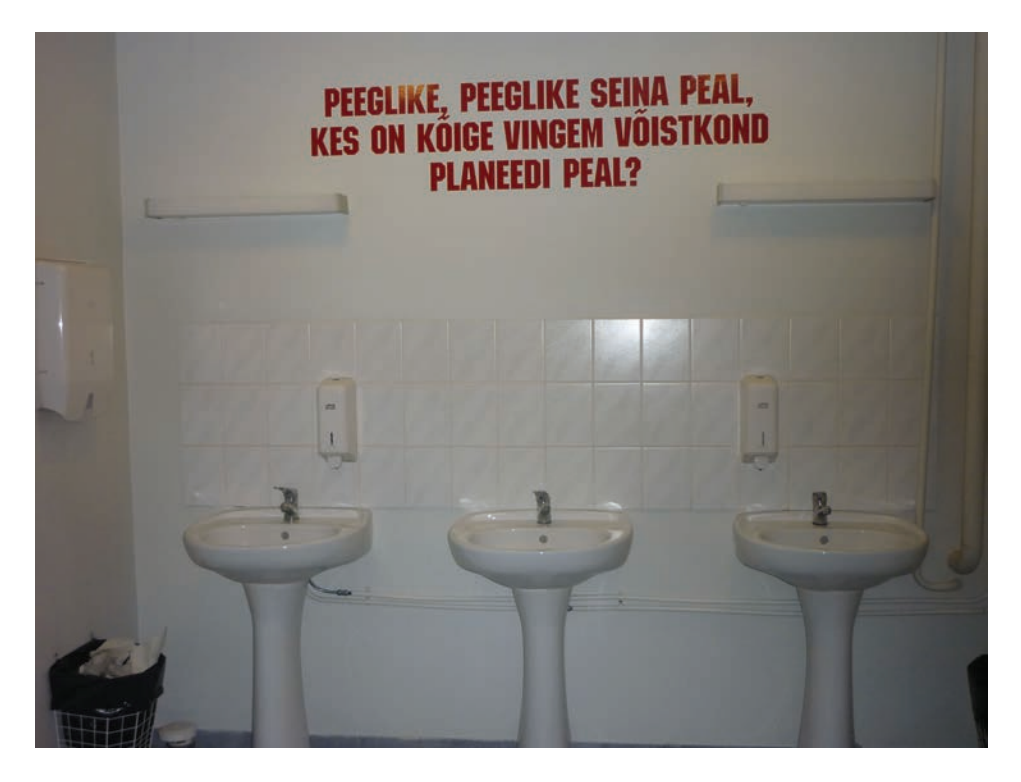
Figure 15. Women's toilet in the sports facility in Ujula Street, Tartu. Photograph by Eda Kalmre, March 2014.

Representations of femininity are generally associated with certain qualities and activities that are perceived as feminine, such as associating women with cleanliness (Fig. 16, the text "Keep it clean" next to a woman's image) and being sober (Fig. 17), woman as a mother or a lady, woman as an angel by day and a witch by night (Fig. 18), woman as an artist (Fig. 19), crocheting as a feminine activity (Fig. 20), woman as too talkative (Fig. 21). The latter aspect has been highlighted by reproducing a Soviet agitation poster, with the text reading "A party member keeps quiet", featuring a woman with a finger on her lips (which is the base text of a stencil by street artist von Bomb). However, the meanings of this graffiti ironically largely refer to Soviet symbolism.