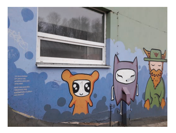
Figure 1. Vallikraavi Street, Tartu.

The material included in the graffiti database of the Estonian Literary Museum reveals that approximately 20-25% of graffiti works refer to gender in some way or another, in either its visual or textual aspect. While some depict men or women, also completely genderless creatures or odd (fantasy) characters can be found (see Fig. 1). A text may also associate in some way with the subjects of women, men, or gender in general.