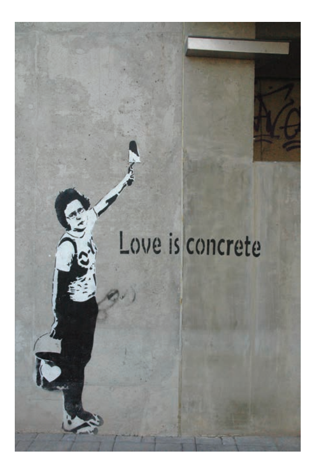
Figure 27. Freedom Bridge, Tartu. Photograph by Piret Voolaid 2011.

Some representations of femininity, however, do not associate women/femininity with only traditional values. For instance, a graffiti work conveying the message "Love is concrete" depicts a woman in overalls holding a trowel (Fig. 27, on the concrete wall of the Freedom Bridge in Tartu). The young woman on the image is in real life a professor of concrete buildings and a collector of street art (Eesti Ekspress 2011: 37).