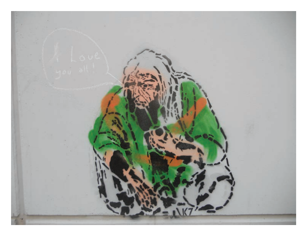
Figure 7. Villa Margaretha, Tartu.