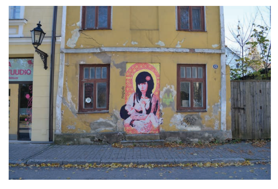
Figure 30. 12 Kompanii Street, Tartu. Photograph by Piret Voolaid, October 2014.

The graffiti work Pipi piiksub (Pippi squeaks; Fig. 31) by Astrid Linnupoeg (lit. Astrid Birdchick) serves as a manifestation of feminine power/force, bringing to the focus the famous literary character Pippi Longstocking (Est. Pipi Pikksukk) by Astrid Lindgren as a symbol of girl power. As a literary character, Pippi is a girl who defies gender expectations and norms, and is smart, clever, inventive, very strong, independent, and rich, but at the same time also kind and caring. Pippi's actions and words are never meant to harm, but she always has a message to convey to the world. In the graffiti, Pippi's role, on the one hand, could be interpreted as a messenger, i.e., Pippi has something to say to the world or the passer-by. This is visually strengthened by the depiction of Pippi as halfway hidden: Pippi is as if peeping from behind the fence. But what she has to say has been turned into mere squeaking in the author's rendition: the text "Pippi squeaks" refers to her message not being taken seriously or not being noticed. Squeaking represents a weak, helpless, high-pitched sound which does not have the same impact as a loud and clear statement. The graffiti's author, whose artist's name suggests is a woman, as if intends to draw attention to the fact that even though women are a considerable force in society, what they have to say is not always noticed or taken seriously.