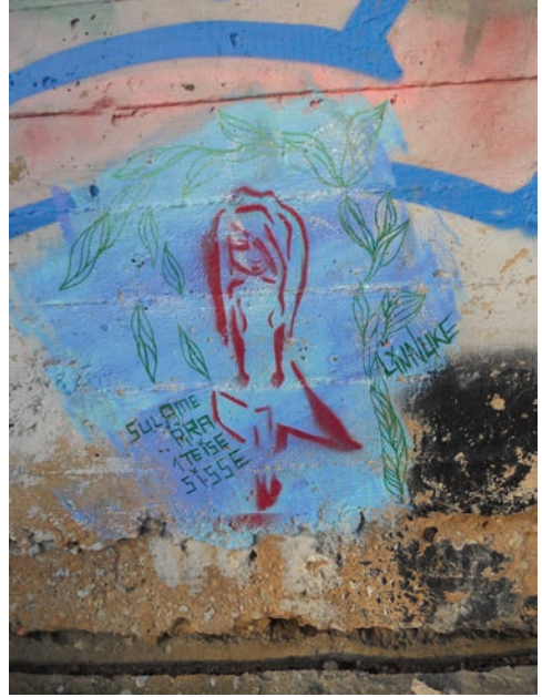
Figure 26. Friendship Bridge, Tartu. Photograph by Piret Voolaid, December 2013.