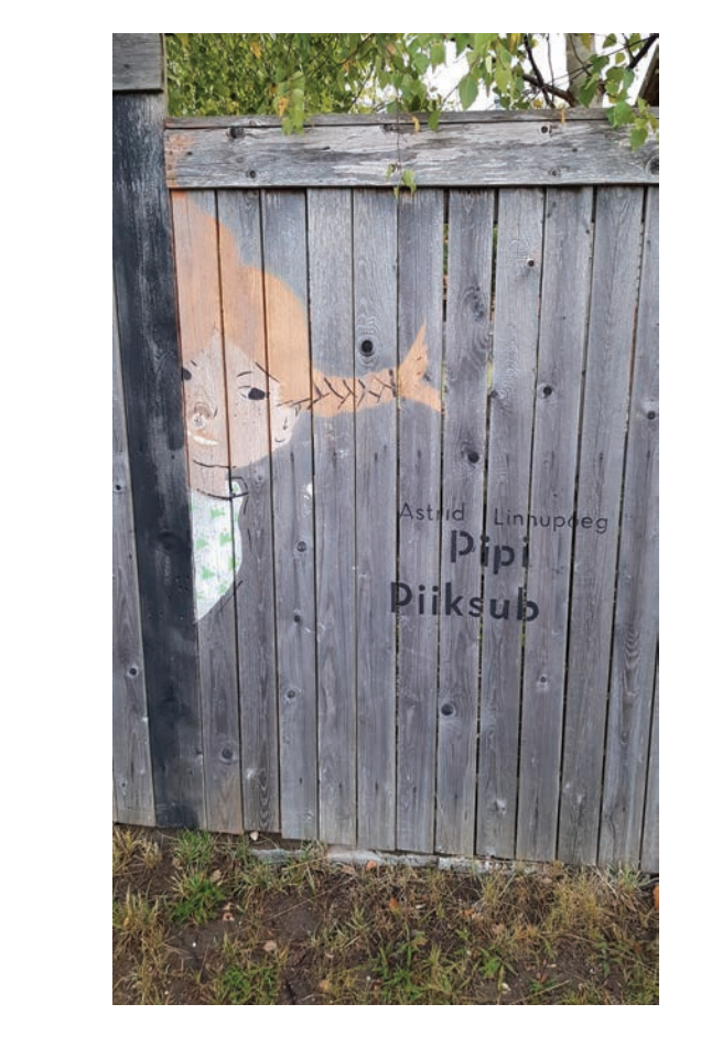
Figure 31. Vaksali Street, Tartu. Photograph by Urmas Sutrop 2019.

The most recent example of women's empowerment is a graffiti in which a Ukrainian woman fights with a dragon (Fig. 32). The graffiti, created by an unknown author, is located under the Kroonuaia Bridge in Tartu. It is a powerful and beautiful painting, which supports Ukrainian fight against the Russian invasion. The author of the graffiti has used the widely known motif of Saint George's fight with a dragon, as an article introducing the graffiti to the readers of the newspaper Postimees mentions (Hanson 2022). The message of the graffiti, including the text "Cлава Україні!" (Slava Ukraini 'Glory to Ukraine!') in Ukrainian, emphasises women's strength in fighting the enemy. The viewer does not see her face but long blonde hair, and the woman's attitude reflects courage and determination. She is holding a sword and her figure is placed on a light blue background which brings out the woman's slim and youthful figure particularly well. In contrast to the figure of the woman, the dragon as genderless represents amorphous and omnipresent evil power. Thus, the graffiti uses gendered connotations contrasting femininity with evil forces.