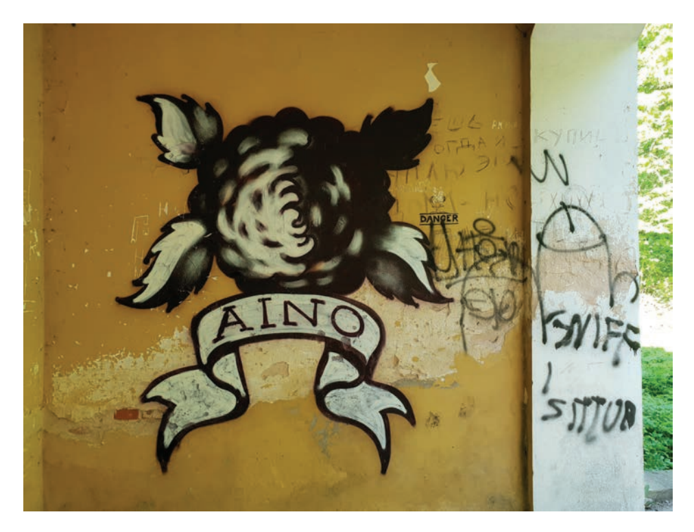
Figure 14. Raja Street, Tartu. Photograph by Piret Voolaid, May 2018.

widely known in Estonia, yet the author of the graffiti has a message to convey about her. The image depicts a blossom with petals surrounding the text "Aino", which is placed in the centre of the wall. The favourable placement of the image is like a homage to this remarkable female author. It seems as if the graffiti artist intended to highlight Aino Kallas as a prominent woman, as if to counterbalance the large number of men represented in urban space/graffiti.