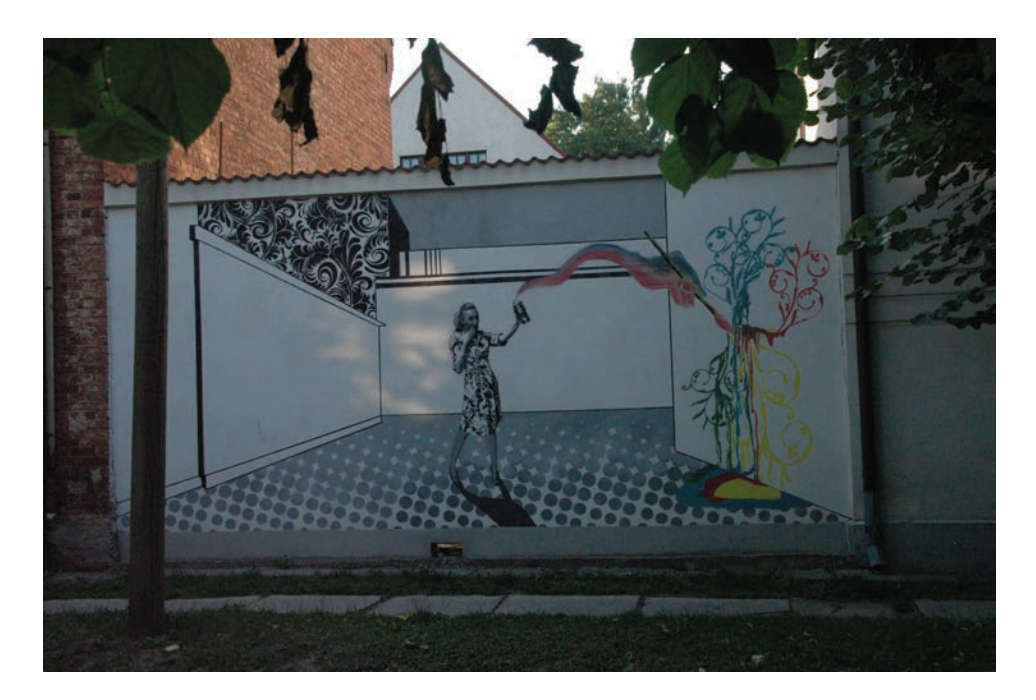
Figure 19. Pallas University of Applied Arts, Tolstoi Street, Tartu.