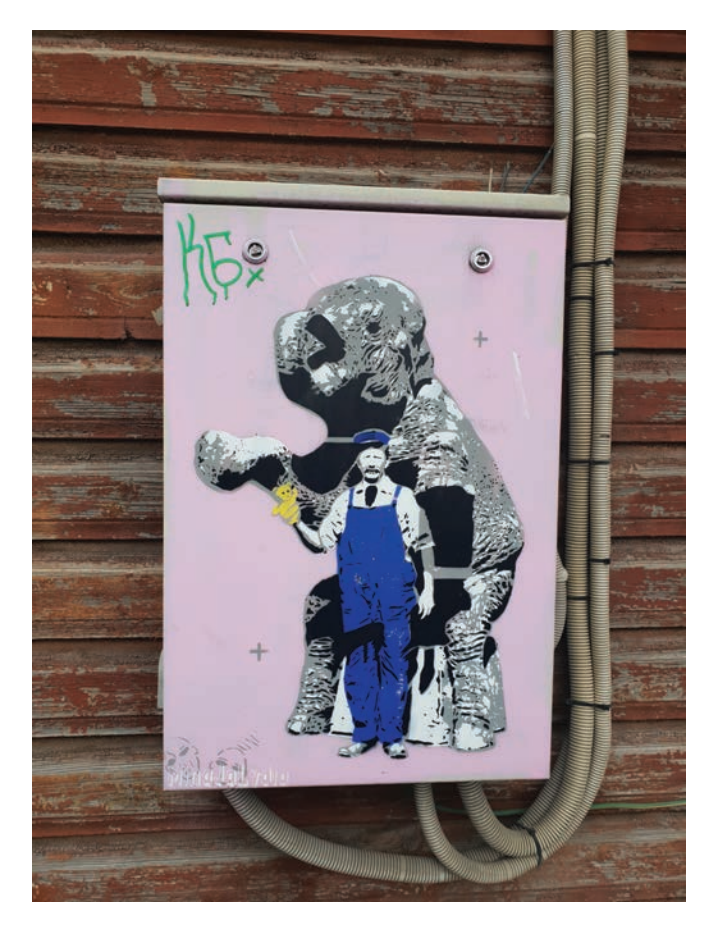
Figure 4. Õnne Street, Tartu.

Examples of conventional masculinity can be seen, for example, in the image of a labourer in overalls (Fig. 4) in Õnne Street in Tartu and in the picture of a male tourist on Pärnu beach, with the Finnish text "Virossa on hyvä" (It's good in Estonia; Fig. 5). The latter ties the notion of masculinity with the national context: Estonia as a post-socialist country that is affordable for a Finnish man. The photograph was taken in 2011, when the price level in Estonia was relatively lower and Finnish tourists contributed heavily to Estonia's economy.