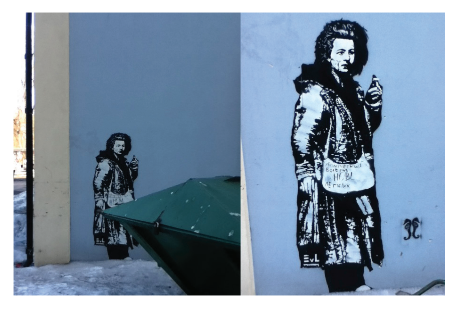
Figure 13. Kompanii Street, Tartu. Photograph by Hanna Linda Korp, April 2013.

has had a prominent position in Estonian national memory. Koidula is not only a historical figure but also a symbol of national identity, cemented by the use of her portrait on the 100-kroon Estonian banknote. Koidula continues to appear both in the cultural memory and public discourse, which is why her image being used in Estonian graffiti is by no means surprising.