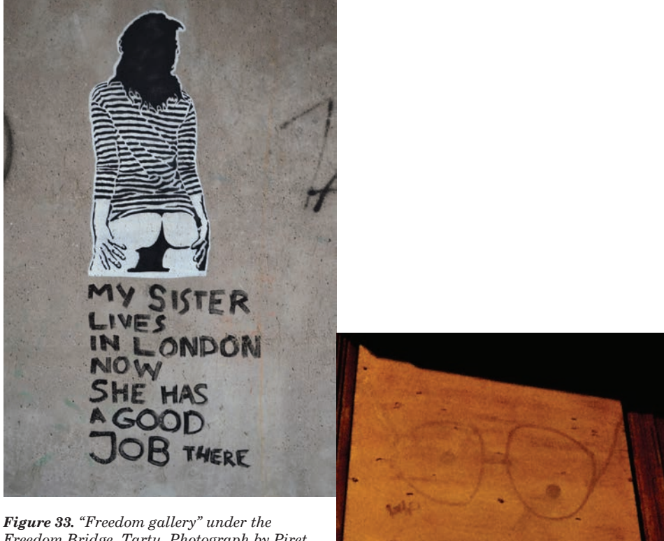
Figure 33. "Freedom gallery" under the Freedom Bridge, Tartu. Photograph by Piret Voolaid, March 2014.

accompanied by a text in English: "My sister lives in London now, she has a good job there". This is an anti-capitalist criticism of sorts and depicting nudity is ambivalent: it either represents a "sexualised gender cliché" and/or social criticism (an Eastern European woman working as a prostitute in London). In most cases, women are represented merely as sexual objects (Figs. 34–36).