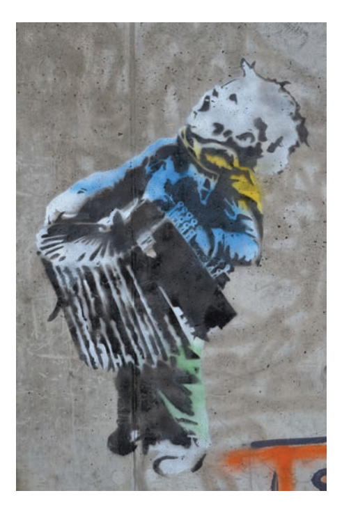
Figure 8. Under the Freedom Bridge, Tartu. Photograph by Piret Voolaid 2014.