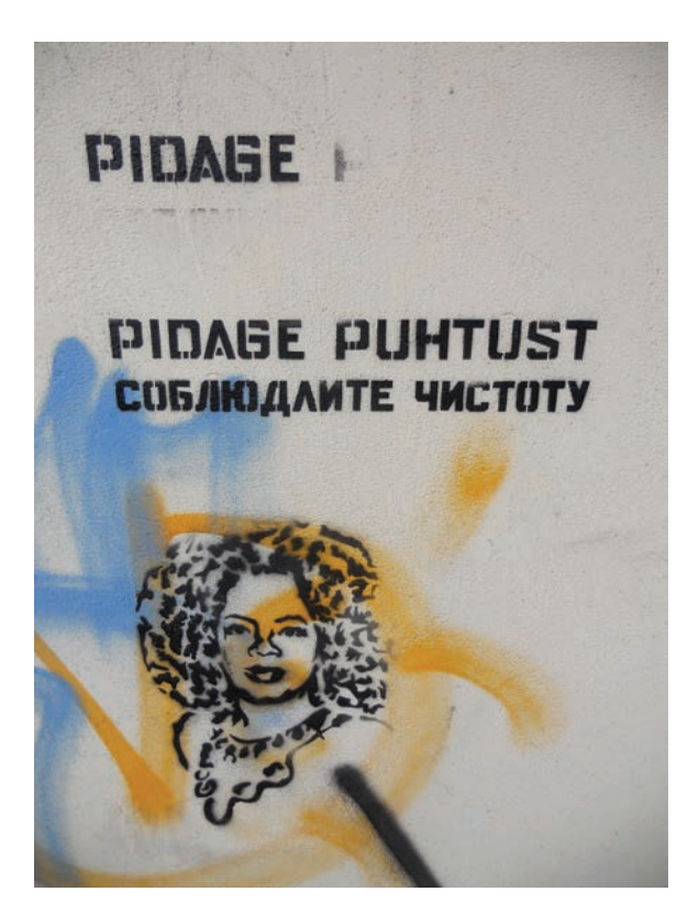
Figure 16. Vallikraavi Street, Tartu. Photograph by Piret Voolaid 2012.