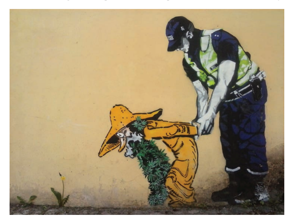
Figure 10. Near the building of the Faculty of Social Sciences, University of Tartu.