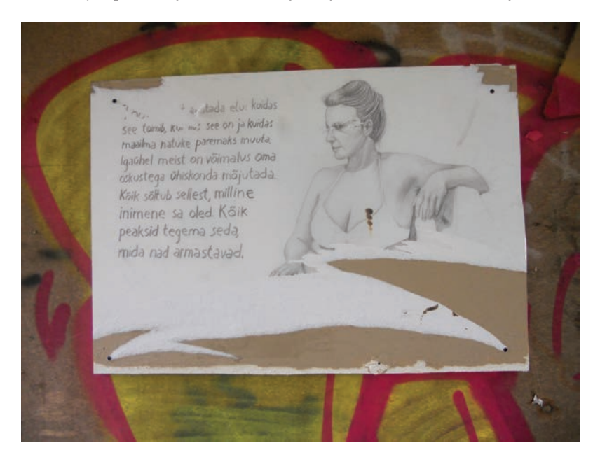
Figure 22. Vallikraavi Street, Tartu. Photograph by Piret Voolaid, May 2015.

[We work] for the purpose of discovering life – how it functions, how beautiful it is and how to make the world a little better. Each one of us has the opportunity to use our skills to influence the society. It all comes down to what kind of a person you are. Everybody should do what they love.