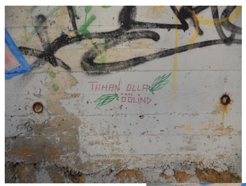
Figure 25. Friendship Bridge, Tartu. Photograph by Piret Voolaid, December 2013.

Such "imagery characterised as feminine" can be found in the graffiti works with the text "Tahan olla öölind" (I want to be a bird of night; Fig. 25) and "Sulame ära teise sisse. Linnuke" (Let's melt into another. Birdie; female figure; Fig. 26). Both graffiti works have a similar visual design/style, also the messages have a feminine feel to them, so that whoever views them could interpret the graffiti as a female author's perspective.