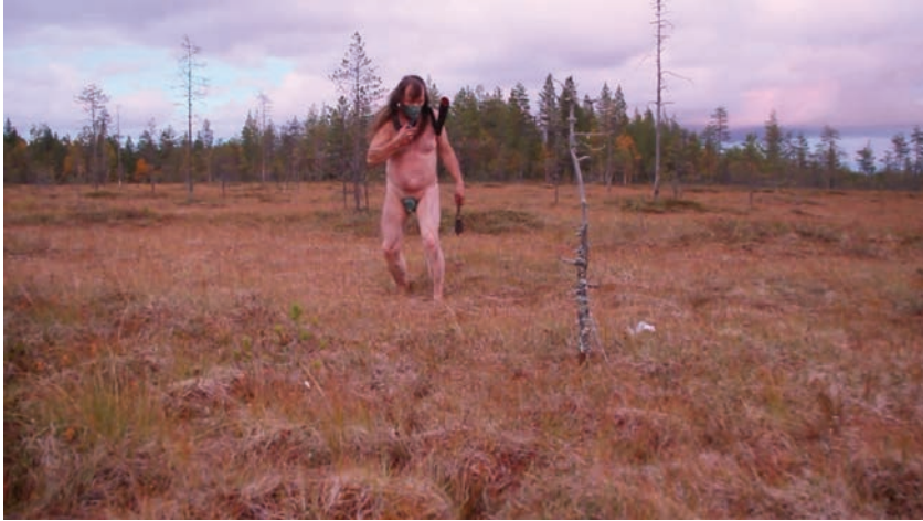
Figure 6. In the video Hillasuon Kummajainen (part 2), the freak is seen as an animal captured by a game camera. Screenshot from the YouTube video.