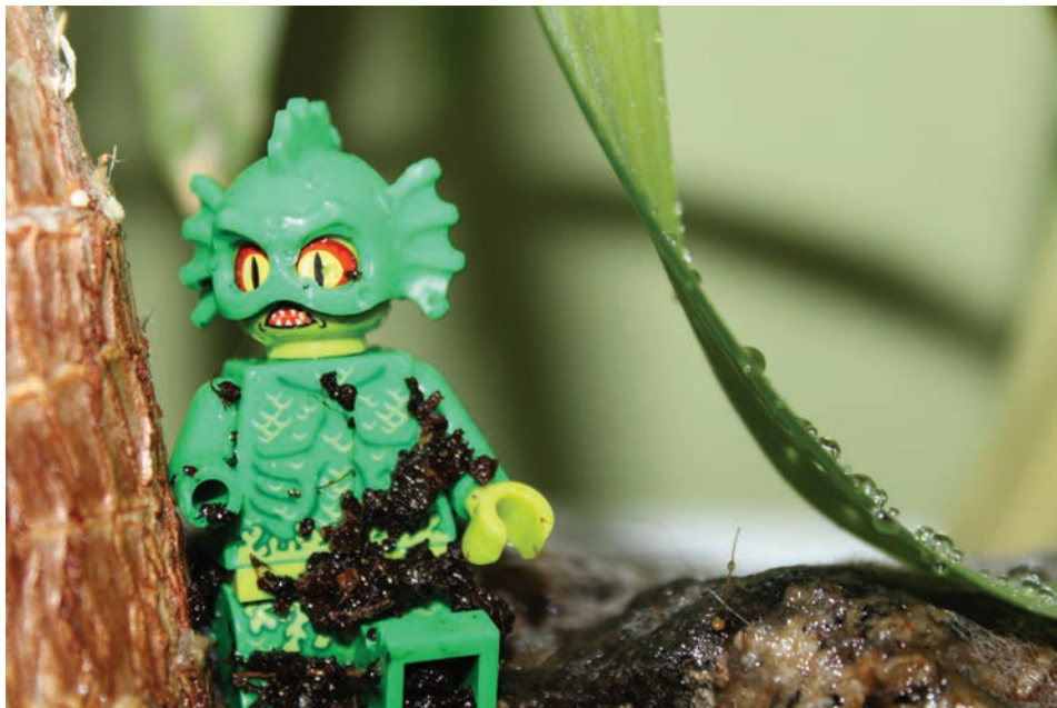
Figure 4. The stories of the swamp monster have always taken many forms. As part of play, monsters remain fascinating strangers, but become part of ordinary life.

temporary nature of play keeps the monster different, but at the same time it can bring the extraordinary into ordinary everyday life (Fig. 4). At best, the naturalization of swamp monsters can lead to a reduction in the generally negative value given to the culturally marginal mire environment.