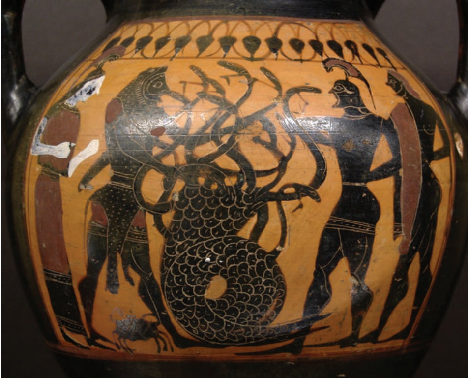
Figure 2. An Attic amphora from the 6th century BC depicts Heracles and Iolaus fighting the Lernaean Hydra.

People in modern Western culture have imagined monsters as disgusting, frightening or dangerous, although in earlier history, monsters also reflected ‘otherness’ and curiosities that were not always particularly scary, but otherwise rejected things (Lawrence 2018). But when monsters are interpreted as projections of human fears (Gilmore 2003: 6) and are seen to challenge prevailing cultural categories, norms and concepts, they provoke reactions of impurity (Douglas 1984 [1975]: 50–56; Carroll 1999: 31–32). This idea of impurity in a categorical sense draws parallels between the mire and the monster, as neither fits neatly into the categories given but remains in an impure intermediate state. Thus, as an object of mire-related fears, monstrosity cannot be uniquely delimited to include material creatures. For example, the monstrousness of a mire without a clear material monster figure has been explained by the mixing of archetypal elements – earth and water or water and fire (firelights) – and a disruption of the expected order of things (Giblett 1996: 3, 182–185).