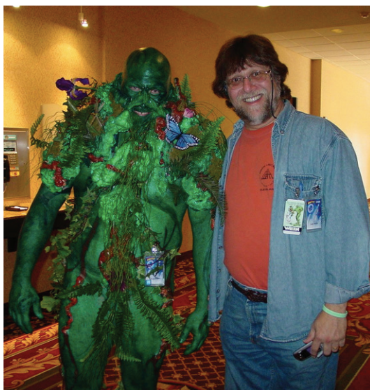
Figure 1. The Swamp Thing saga began in the 1950s and continues in various forms today. A cosplayer dressed as the Swamp Thing with creator Len Wein at CONvergence 2005. Photograph Lex Larson, Wikimedia Commons.

Further ethical implications of the transformation of swamp monsters are examined in the television series Swamp Thing (2019), based on the 1960s superhero comics created by DC Comics' legends Len Wein and Bernie Wrightson (Fig. 1). However, Swamp Thing had already debuted in a single comic strip in the 1950s, and Marvel Comics published a Man-Thing comic strip based on a similar character almost at the same time as Swamp Thing came out. 1 In the 1980s, Alan Moore began to rewrite the Swamp Thing story as a continuation of Wein and Wrightson's character. Collections of Moore's Swamp Thing comics were published in six books in the 2010s. The comic strip and the television series are examined in parallel in this article, and both deal with the relationship between humans and nature through the mire environment in an era of eco-crises, and conflicting monstrous superheroes.