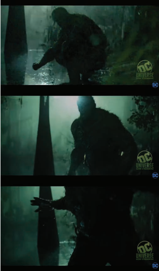
Figure 5. Swamp Thing did not like to be captured on the game camera and knocked it over. Screenshots from the trailer for the TV series Swamp Thing.

Gradually the Swamp Thing lets go of his human mind. The greatest strength of the Swamp Thing emerges as his connection to vegetation on a global scale, and his ability to regenerate which makes him immortal. Through a connection to the botanical world, for example, the Swamp Thing protests against corrupt authorities, and the inhabitants of a city transformed into a beautiful jungle cheer on the monster. But those in power see a danger in this, and the monster ceases to be merely a monstrous and repulsive stranger, and becomes something that is to be got rid of once and for all. As a further extension to the story, the