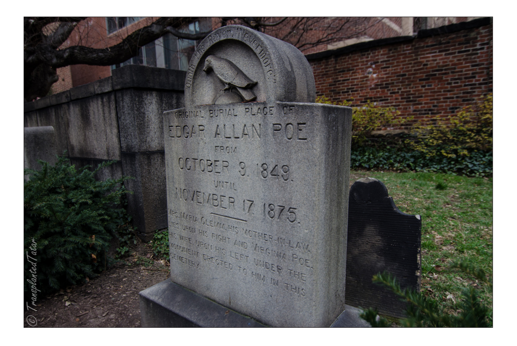
Figure 2. Poe's original grave. Westminster Hall and Burying Ground, Baltimore, MD (https://transplantedtatar.com/2013/04/01/poe-amontillado-wine-tasting-201/).

An Internet search produces multiple websites speculating on the possible causes of Poe's death in both scholarly databases and popular websites. The scholarly sources tend to include detective work in Poe's papers and letters, along with examination of his contemporaries' letters. However, even in the scholarly sources there happens to be a rather laissez-faire use of medical terminology, resulting in some bizarre diagnoses of what caused Poe's death. Hopkins, for example, refers to the possibility that Poe suffered from "sclerosis of the liver" (2007: 42), possibly confusing sclerosis with cirrhosis. Beyond aca-