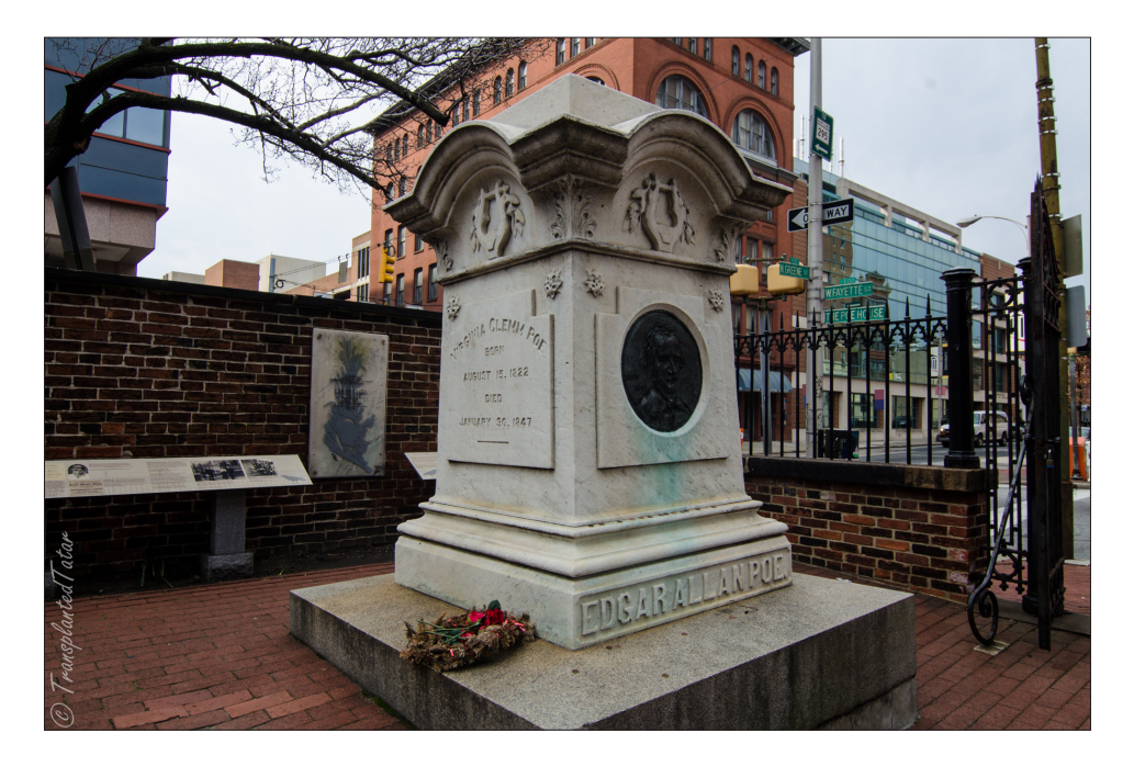
Figure 3. Poe monument. Westminster Hall and Burying Ground, Baltimore, MD (https://transplantedtatar.com/2013/04/01/poe-amontillado-wine-tasting-201/).

in 2009, the 150th anniversary of Poe's death. Although there are numerous Poe performers (Ocker 2015: 25), who dress up as Poe and read his works or who act in Poe-inspired performances, such enacted performances are different from the spectrum of folklore dynamism surrounding the media-named Poe Toaster (Toelken 1996: 40–43). The Poe Toaster's annual ritual draws on the traditional perception of Poe as a man of mystery, death, and horror, by adding another layer of mystery to his name and death. The ritual's site is clearly significant: Poe's grave contains not only the great poet's earthly remains, but also his aura. Weirdly uncanny to modern sensibilities, he rests there with his wife/cousin and mother-in-law/aunt. As a cultural marker, the Poe monument is a tourist attraction and a highly visual landmark in Baltimore. A wooden engraving depicting its unveiling in 1875 shows a woman placing a wreath adorned with a raven on top of the monument, a rite that establishes a clear symbolic connection between the black raven, a bird often associated with wisdom, death, and graveyards in popular culture, and Poe, whose most famous poem is, of course, The Raven (Society n.d.).