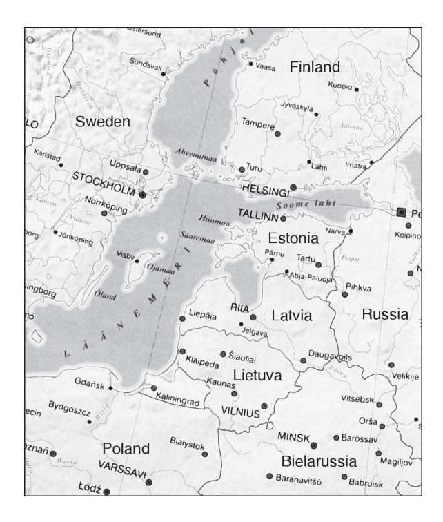
Figure 1. Map of Estonia and neighbouring countries.

Estonian National Museum 1919-1920. The hand-written memories of one of the key figures of the quondam events, August Pulst<sup>3</sup>, are located in the archive of the Art Museum of Estonia, as well as in that of the Estonian National Museum (ENM). Content-wise, this is actually a manuscript of the memories, the initial variant of which is a hand-written draft version, written during the period 1943–1948 and titled The Estonian Museum in Tallinn. Historical data, with abundant corrections and additions (Pulst 1948). The typescript text from 1973, My work in connection with folk art - ethnography, preserved in the ENM, is a more succinct summary written on the basis of the former version (Pulst 1973). Likewise, I have also used the unpublished article by Heini Paas from 2004, entitled About the history of the Estonian Art Museums 1919–1944. Earlier, the same author has published an article About the history of the Estonian State Art Museum, the establishment and history of the museum 1919-1940" (Paas 1980). However, the earliest and most immediate insight in the subject matter is the article by Bernhard Linde, The development of the idea of the Art Museum of Estonia, and the Estonian Museum Society in Tallinn (Linde 1931).