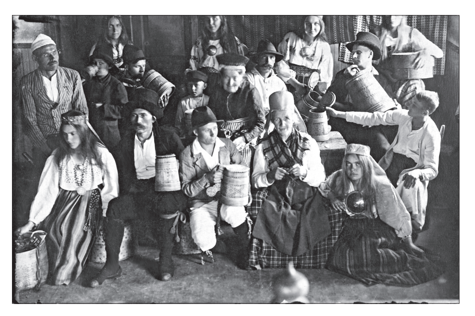
Figure 3. Participants in the Raiküla party, arranged by the Estonian Museum in Tallinn. 1920. ERM Fk 1706:18.

1925 was pivotal for the museum with regard to the change of course – earlier diffusion and the creation of new departments, i.e. fragmentation was replaced with consolidation and focusing, by putting two domains in the forefront: the department of fine arts and the collections of cultural history related heritage, as the ones deserving most attention, were arranged for display (Linde 1931: 13).