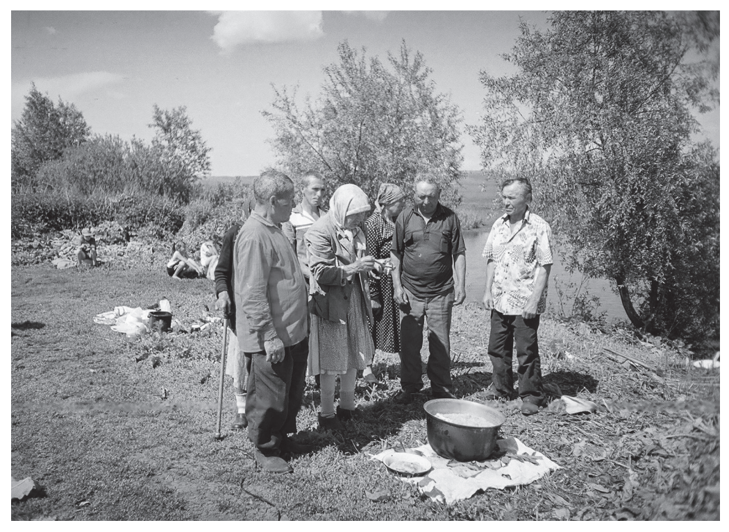
Photo 2. Şumār chűk prayer in Staroye Afon'kino village, Shentalinskiy district, Samara region. 2001.

Such periodicity of semik and Trinity rites is probably traditional with some elements of the rituals mentioned above kept for a long time among the officially Orthodox Chuvash. For example, in the Volga region near the cities of Saratov and Simbirsk people usually pour water on each other at Simāk . There the ritual was called uchukka , which means 'farewell to the spring' ( vesna āsatni ). Water pouring is also common among the Chuvash living near the town of Buzuluk where even a visit to the cemetery is considered a ritual of rainmaking (FM: 2000b).