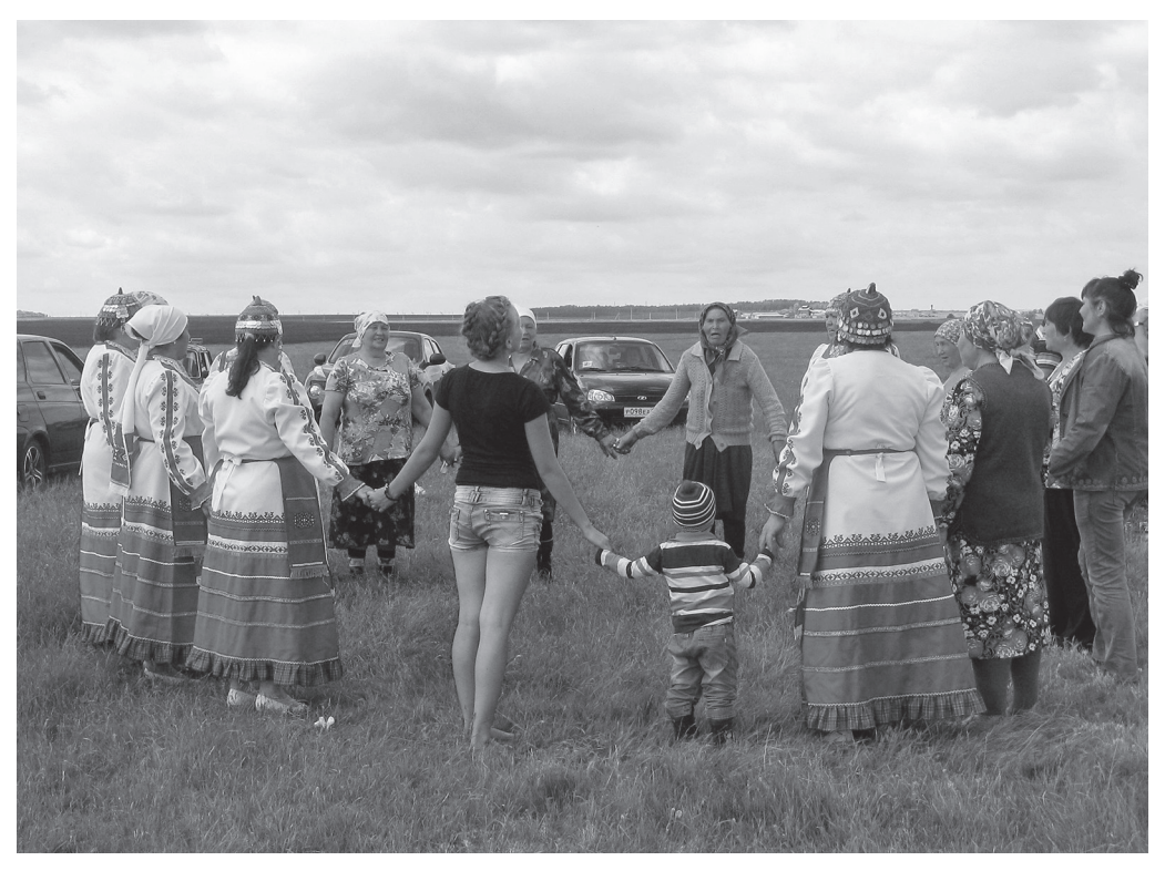
Photo 3. Uyav in Staroye Afon'kino village, Shentalinskiy district, Samara region. 2015.

In the Trans-Kama area Simēk is followed by Uyav (also Vāyā ), the period of merrymaking and round dances that have always been of great importance here (Novoye Aksubayevo village in Aksubayevskiy district, RT; Staroye Surkino village in Al'met'yevskiy district, RT; Staroye Afon'kino village in Shentalinskiy district, Samara region. See Photo 3.) In these villages at this time a special song, simēk yurry , performed only on the day of Simēk , appeared in the repertoire of Uyav / Vāyā songs (FM: 2003b).