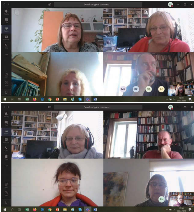
One of the main topics at the web meetings of the Department of Folkloristics of the ELM in the emergency situation was the collection of corona lore and its initial analysis. Above: Teams, March 2020; below: Teams, April 2020.