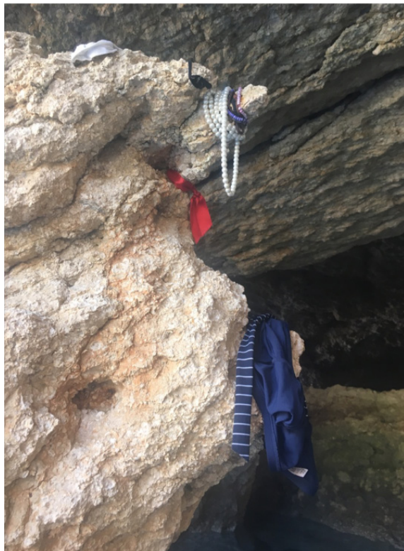
Figure 3. Miraculous stone with votives on the Ladies' Beach. Ulcinj, Montenegro. 2018.

location on the Adriatic Sea explains the availability and relative popularity of the Ladies' Beach for different groups of tourists, especially regionally. The official bilingualism in Ulcinj, Montenegrin and Albanian, creates a comfortable linguistic environment for different Albanian- and Slavonic-speaking groups of tourists from Kosovo, Albania, North Macedonia, Serbia and Bosnia. Touristic portals recommend having a rest on this beach to women seeking a nudist vacation far away from men. In practically all the advertising annotations, it is stated that the main advantage of the beach, among others, is that women traditionally go about without clothes here: 'women have been swimming here without clothes for centuries, and men are forbidden to visit it' . 2 Actually, the entrance is controlled by security, which is the only constant male presence