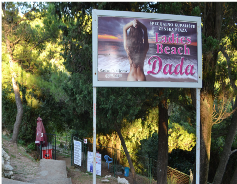
Figure 1. The main banner of the Ladies' Beach. Ulcinj, Montenegro. 2018.

The first time I visited the city of Ulcinj in Montenegro was in 2014, when with a group of colleagues I made a stop there on the way to an expedition in Albania. The head of our expedition suddenly remembered the women-only beach located in the city and offered my female colleague and myself a chance to see it. At the entrance to the beach we were greeted by an elderly woman dressed only in a topless bikini. Access to the beach was fee-based, and the woman sold us some tickets. The tickets showed the silhouette of a nude female body, which echoed the image on the main beach banner featuring the perfect figure of a naked woman, walking away from the viewer into the depths of the sea (Figure 1). In a similar way, the images echoed the real women who were practically all resting on the beach naked. Having received these tickets, there was a feeling that we had not just paid for our stay on the beach, but had won tickets to some ‘women’s club’ or ‘women’s paradise’, to quote enthusiastic impressions that can often be heard from visitors, as I later explored on the Internet. The considerable fame of the resort in Ulcinj, in the far south of Montenegro, which is not the most popular tourist destination, seemed unusual and amazing.