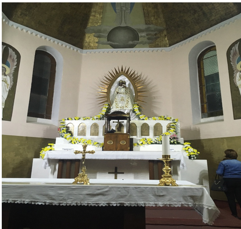
Figure 5. Statue of the Virgin Mary above the main altar. Roman Catholic Church of the Assumption of the Virgin Mary in Letnica. Kosovo, 2019.

gifts, in other words, children they could not give birth to' (Interlocutor A., male, Albanian, church priest in Letnica, recorded in 2018, translated from Albanian). In other words, in Letnica female ritual practices related to fertility and childbirth are an integral context for the different scenarios in which the shrine is visited, and they seem to play an important role in the process of sharing the shrine and of peaceful intergroup interaction.