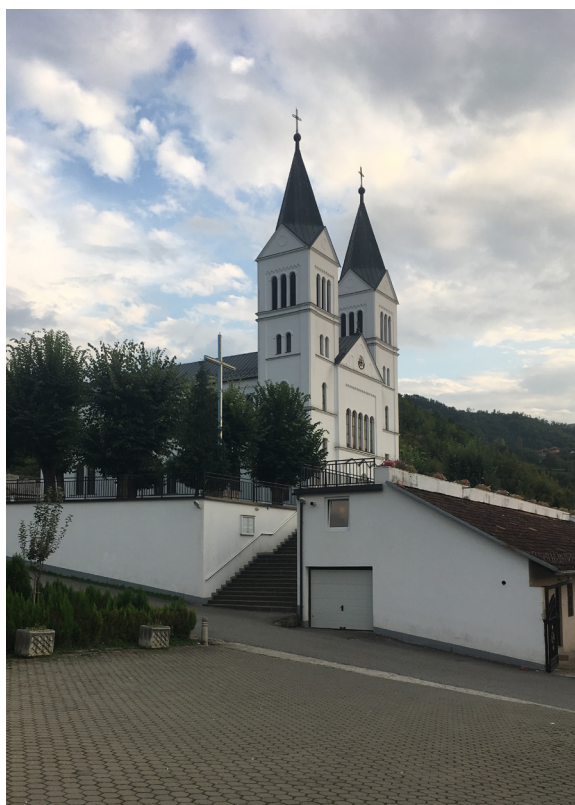
Figure 4. Roman Catholic Church of the Assumption of the Virgin Mary in Letnica. Kosovo, 2018.

ties of the region, but also a place of worship for Muslims (Albanians, Roma), Orthodox (Serbs, Roma, Macedonians) and other ethno-confessional groups from various regions of the former Yugoslavia (Macedonia, Serbia, Bosnia, Montenegro, etc.) (Zefi: 169–175; Urošević 1934). Despite the global changes that affected ethnic and state borders during the period of military conflicts, and even after the sudden interruption of pilgrimages in 1999, Letnica and the sanctuary of Our Lady (Serb.–Croat. Svetište Gospe Letničke / Alb. Shenjtërorja e Zojës në Letnicë ) is still attracting a large number of pilgrims from different local traditions annually on 15 August the day of the Assumption of the Virgin Mary (Sikimić 2017a, 2017b).