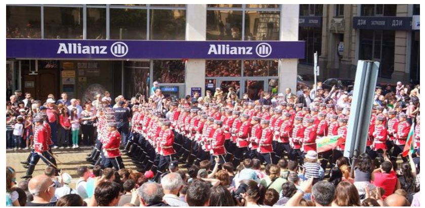
Figure 2. St. George's Day is the Day of the Bulgarian Army. Sofia, 6th May 2015.

In 2015, I had the opportunity to observe the celebration of St. George's Day in Sofia. A huge military parade and other events on public spaces attracted crowds. Fewer people could be seen in churches. The research data suggest that this holiday is celebrated by 75 percent of the respondents, twice as many celebrating it with friends rather than with family members. Although the majority of the respondents knew and spoke about the family traditions observed on St. George's Day (roast lamb, baking a special pie), only 30 percent of them spent the holiday with their families. Some respondents celebrated it as a names day. This is indicative of the rapid transformation of a family festival into a public holiday.