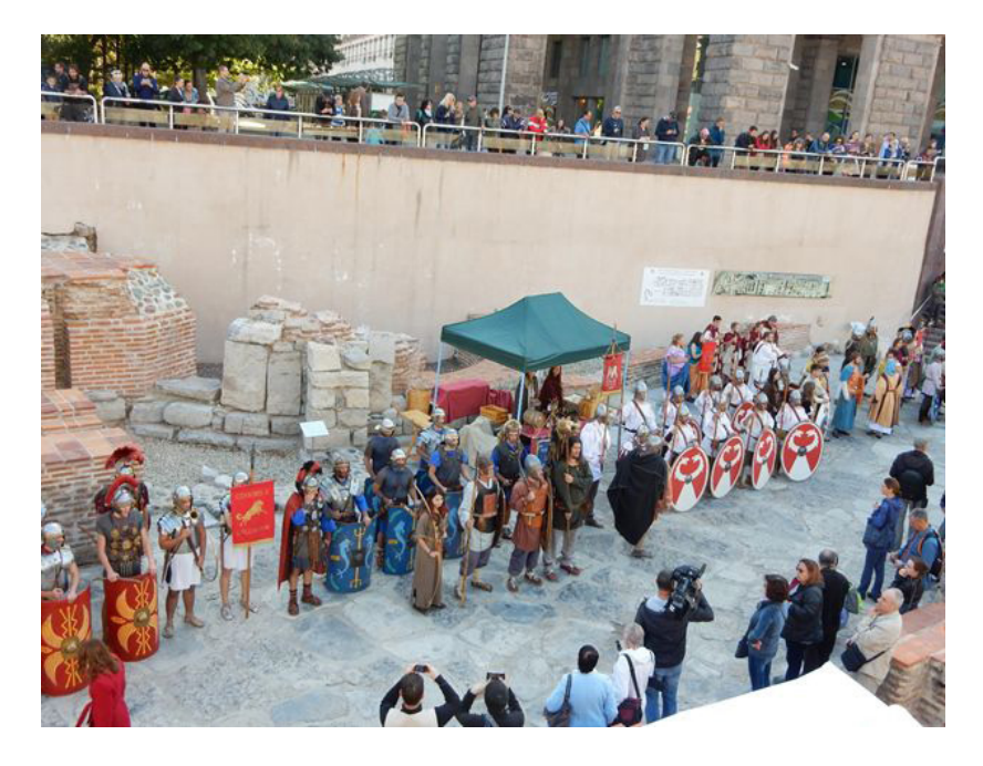
Figure 5. Sofia Heritage Days. Sofia, 21st September 2018.

two before the interview. After being reminded of the date, the respondents admitted not celebrating the festival. One respondent even said that there were too many of those independence days for him to remember to celebrate each of them. Younger respondents seemed to be more eager to celebrate the holiday. Sofia Heritage Days were held in the city on the eve and day of the celebration, a colourful and entertaining event designed to appeal to both young and older people. However, just as in Vilnius, only a meagre number of the residents of the city attends such events.