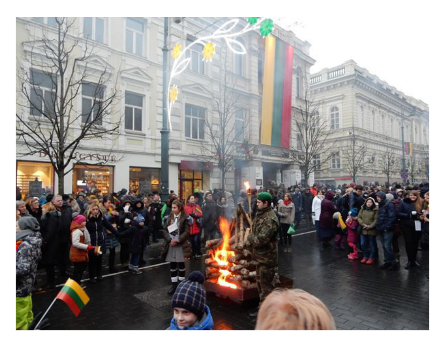
Figure 6. Restoration of the State Day. Vilnius, 16th February 2018.

All national holidays in Sofia are usually spent with friends rather than family. In Vilnius and Vilnius County, the most popular modern holidays are Mother's Day and Father's Day. Unlike the majority of other modern holidays, these two are mostly family celebrations. Mother's Day dates back to 1928, though in 1940, following the Soviet occupation, it was banned and revived shortly before the collapse of the USSR, mostly by the efforts of ethnologist Juozas Kudirka (Kudirka 1989); in 1990 the holiday was reinstated (Šidiškienė 2016a: 234-5). The celebration includes visiting mothers and giving them presents. Father's Day was declared a holiday in the last years of the Republic of Lithuania and was celebrated for no longer than a couple of years until the Soviet occupation. It was also promoted in the publication dedicated to Mother's Day. In 2008 Father's Day became a state holiday (Šidiškienė 2016b: 249), but neither before the war nor now has it been on the scale of the Mother's Day celebration.