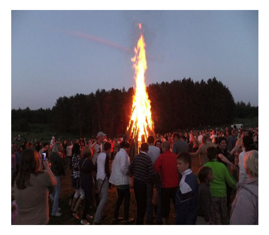
Figure 3. St. John's Day, Vilnius, 23th June 2011.

A popular festival in Lithuania is St. John's Day. Usually people gather around bonfires, which are set up in public spaces, or privately celebrate the names day of a member of their family or a friend. In Vilnius, St. John's Day is more often celebrated with friends, whereas in Vilnius County people tend to spend it with their families. This celebration is more secular in character, though is very important to those who profess the old Baltic faith. On the other hand, this festival is closely related to the Lithuanian national revival in Lithuania Minor at the end of the nineteenth century. Today, it is widely celebrated in Lithuania's Baltic neighbours, Latvia and Estonia.