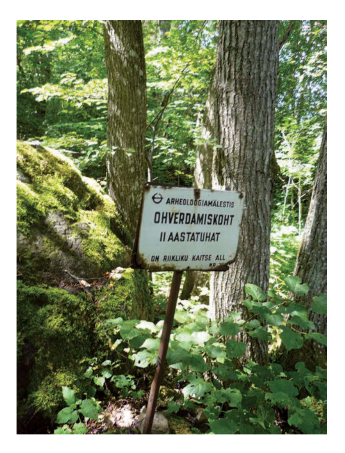
Figure 3. Sacral Stones.

of "the faith of Taara" and "indigenous Estonian religions", as "everything the Estonians have been believing in throughout the last 800 years of history and thousands of years before that". The calendar of Maavalla Koda dates back more than 10,000 years (the foundation year of the organisation is marked to be 10,208/1995), from the moment of the "Birth of the Estonian Land" (it is believed that it emerged in the result of the retreat of a glacier). Religion is animistic and local, i.e., every single locality has its own deity or spirit which cannot be removed or relocated. The main places of worship are sacred groves