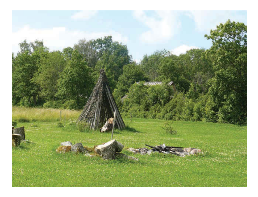
Figure 1. Piret's Sacral Place (koda).

several villages and farmhouses on the island. The island still reveals traces of ancient history, presenting castle ruins, stone graves (from the end of the first millennium BC to AD), the medieval St. Catherine's Church (12<sup>th</sup> century), windmills, the ethnographic museum, etc. Muhu also has some connections with the processes of European integration; namely in 2012, the Fishing Museum was set up, supported by European funding. All in all, Muhu is a "folklore village" in which local ethnography and folklore (dwellings, settlement, crafts, handicrafts, songs, tales, etc.) have turned into a way of life, which is displayed to visitors and tourists by the locals with great pleasure (and for a charge).<sup>19</sup>