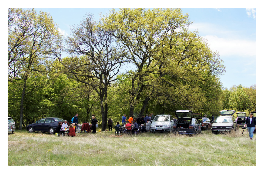
Figure 5. Meeting of resettlers from Zhrebchevo village and their descendants at Komluka. Photo: L. Gergova, 1 May 2019.

knowledge and memories, organising small photo exhibitions, etc., have prepared the community for material loss.