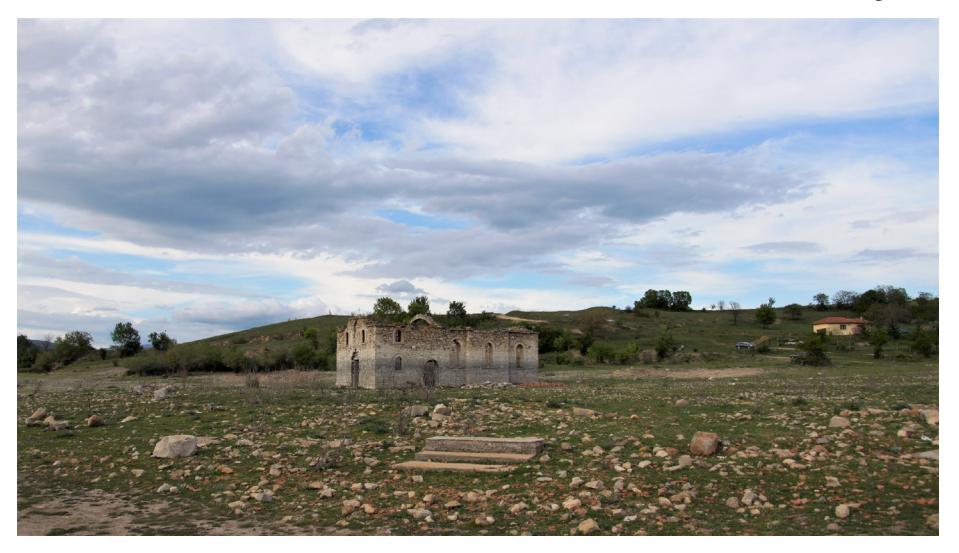
Figure 2. The submerged church, the monument (on the small hill behind the church) and Zapalnya museum (on the right) at low water. The remains of the houses are visible in the foreground. 1 May 2019, Zhrebchevo reservoir.

displacement, a monument was erected that looks like a gravestone, with the inscription "Village Zapalnya // Settled in 15th century // Evicted in 1962". In the 1970s Zapalnya museum was established in a small building not within the reservoir on the periphery of the former village. It accommodates only photos and short stories written on the walls and represents the revolutionary past of the village from liberation until 1944 and the partisan actions. The village's old cemetery is also in this area, which together with the museum, monument and church form a commemorative site that reminds resettlers of the former village,