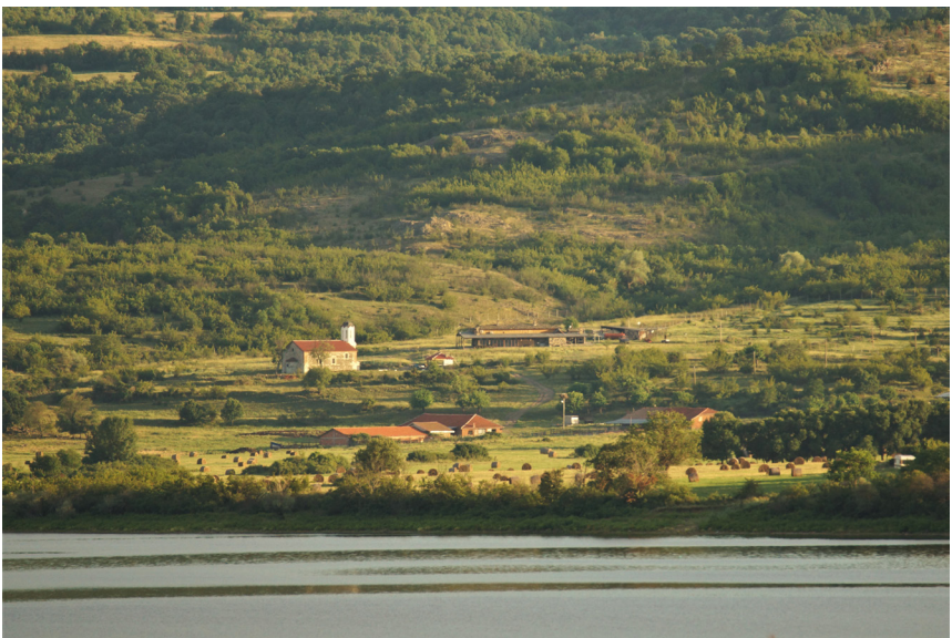
Figure 3. The remains of the village of Kochash on the shore of Ivaylovgrad reservoir: farms, church, the 'horemag', and the school. Photo: L. Gergova, 21 June 2021.

The case of Kochash is quite similar in terms of landscape features and the function of the village remains. It is one of the four villages that were partially destroyed in connection with the construction of the Ivaylovgrad reservoir in 1964. It was not submerged, but most of the houses were destroyed and, in this case, the materials taken from the owners to be reused. The farms, church of St John the Baptist and other public buildings were not demolished, while the farms were used until the end of the 20th century. In the 2010s farmer Krasimir Kostadinov bought the whole territory and ran a large farm, restoring the church and transforming what had been the 'horemag' – a large multifunctional building – into his own home. The old school was abandoned and today is utilised as hay storage. All these buildings are not so close to each other because they