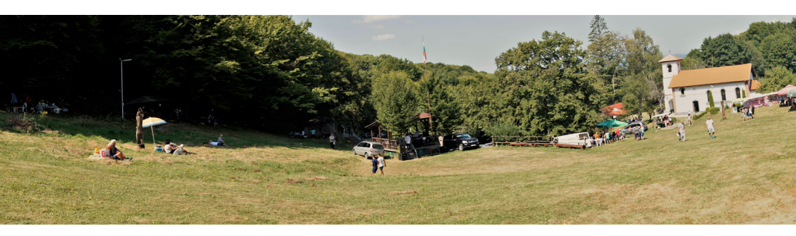
Figure 1. The field in front of Shishmanovo Monastery and Church. Under the shade of the trees on the left there are shelters for resettler families. On the right, a small marketplace offers food and cheap toys for children. In the middle is a stage for the music program. Photo: L. Gergova, 25 August 2019.

rapidly to change their lifestyle. Gradually, the fields were forested (about 16 million trees) to hold the soil on the shores of the reservoir, and thus human activity changed the landscape. Places that were previously significant to the