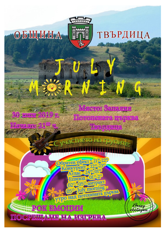
Figure 2. Poster for July Morning event at the church – 2019.

A history "created" not by human but by itself, refusing flatly to perish by the waters of the reservoir. The same way we have rejected "dying" as a nation…" <sup>10</sup> Hundreds of people joined the event. It aims to popularize the church as an attractive place and a scene for cultural activities. From there – the fundraising for the building restoration <sup>11</sup>.