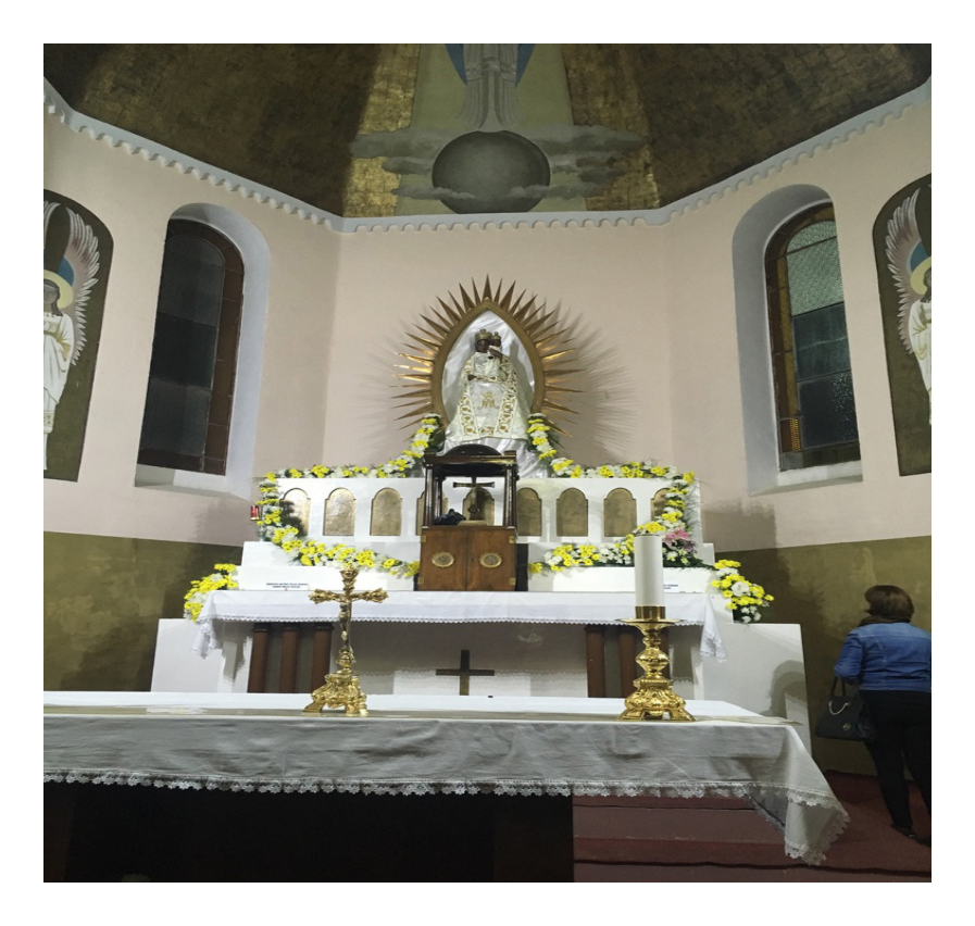
Figure 5. Statue of the Virgin Mary above the main altar. Roman Catholic Church of the Assumption of the Virgin Mary in Letnica. Kosovo, 2019.

gifts, in other words, children they could not give birth to' (Interlocutor A., male, Albanian, church priest in Letnica, recorded in 2018, translated from Albanian). In other words, in Letnica female ritual practices related to fertility and childbirth are an integral context for the different scenarios in which the shrine is visited, and they seem to play an important role in the process of sharing the shrine and of peaceful intergroup interaction.