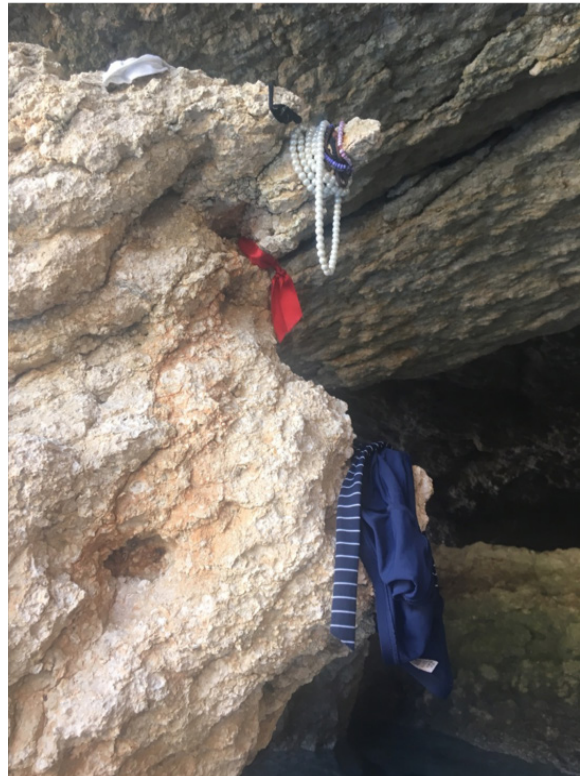
Figure 3. Miraculous stone with votives on the Ladies' Beach. Ulcinj, Montenegro. 2018.

location on the Adriatic Sea explains the availability and relative popularity of the Ladies' Beach for different groups of tourists, especially regionally. The official bilingualism in Ulcinj, Montenegrin and Albanian, creates a comfortable linguistic environment for different Albanian- and Slavonic-speaking groups of tourists from Kosovo, Albania, North Macedonia, Serbia and Bosnia. Touristic portals recommend having a rest on this beach to women seeking a nudist vacation far away from men. In practically all the advertising annotations, it is stated that the main advantage of the beach, among others, is that women traditionally go about without clothes here: 'women have been swimming here without clothes for centuries, and men are forbidden to visit it'.' Actually, the entrance is controlled by security, which is the only constant male presence