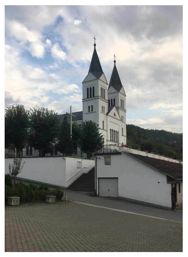
Figure 4. Roman Catholic Church of the Assumption of the Virgin Mary in Letnica. Kosovo, 2018.

ties of the region, but also a place of worship for Muslims (Albanians, Roma), Orthodox (Serbs, Roma, Macedonians) and other ethno-confessional groups from various regions of the former Yugoslavia (Macedonia, Serbia, Bosnia, Montenegro, etc.) (Zefi: 169–175; Urošević 1934). Despite the global changes that affected ethnic and state borders during the period of military conflicts, and even after the sudden interruption of pilgrimages in 1999, Letnica and the sanctuary of Our Lady (Serb.–Croat. Svetište Gospe Letničke / Alb. Shenjtërorja e Zojës në Letnicë) is still attracting a large number of pilgrims from different local traditions annually on 15 August the day of the Assumption of the Virgin Mary (Sikimić 2017a, 2017b).