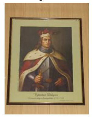
Portrait of Vytautas the Great in the Tatar club in the village of Raižiai (Lithuania - 03.2012)

For the local topography, the events of the past and the participation of Vytautas the Great in them acquire a paradigmatic and meaningful character. According to a legend about the founding of the village of Studzianka (Poland), Grand Duke Witold passed through this area and especially liked a place with clean and cold spring water, where they had sunk a small well (Pol. studnia, pl.). Because of this, the Tatars who settled here began to call the settlement Studzianka (Borawski and Dubiński 1986: 231-2). The legend of the origin of the village of Forty Tatars (Lithuania) is also associated with the activities of the great ruler and the settlement of Tatar warriors in the area (ibid.: 2323). A legend about the name of Tatar village of Lukishki (Lith., Lukiškės) in the suburbs of Vilnius, which is considered to be one of the oldest Tatar settlements ('neighbourhood'), is associated with a Tatar who served in the army of Grand Duke Witold and ruled these lands, which were probably granted for devotional service. It is known from documentary data that from 1559 to 1567 Lukishki belonged to two Tatar brothers, the name of the village coming from that of their grandfather Luka, who lived around 1500 (Jakubauskas 2009: 16).