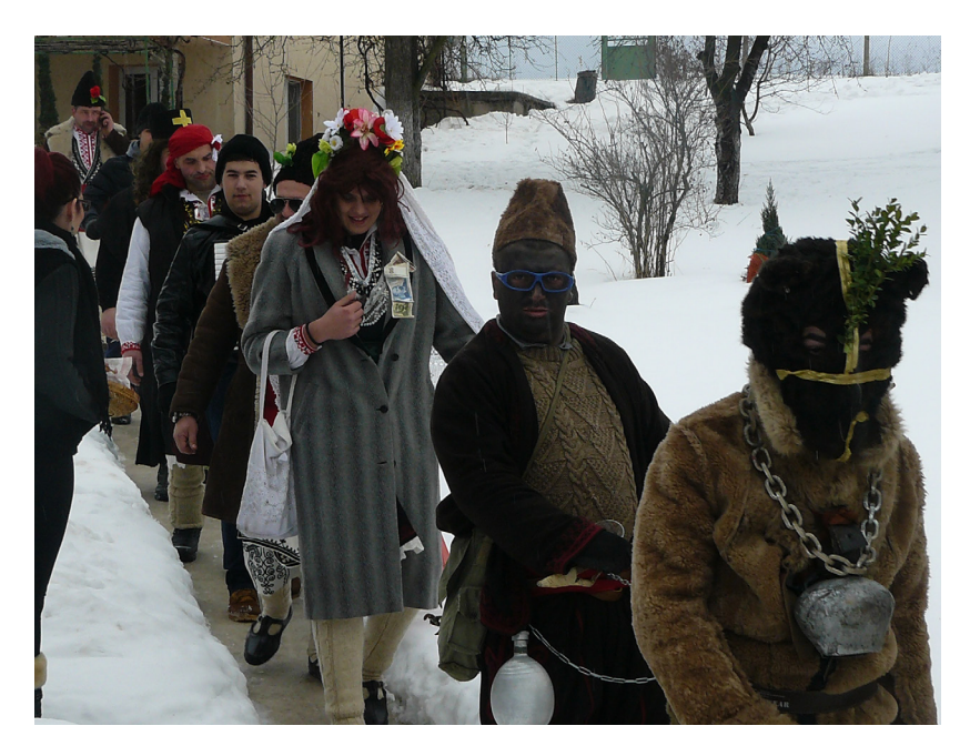
Figure 1. Wedding procession and 'bear with a bear keeper' from Lyulin village, Pernik Region.