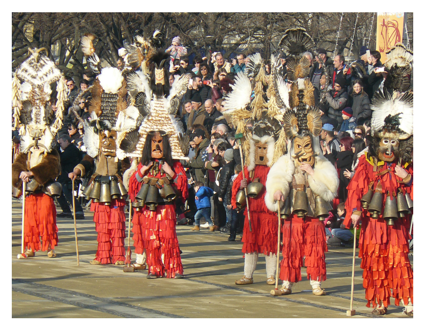
Figure 7. International Festival of Masquerade Games 'Surva' – Pernik 2016. Fhoto: Milena Lyubenova, 2016. (Archive IEFSEM – BAS: FtAIF № 1517, arch. unit 337).