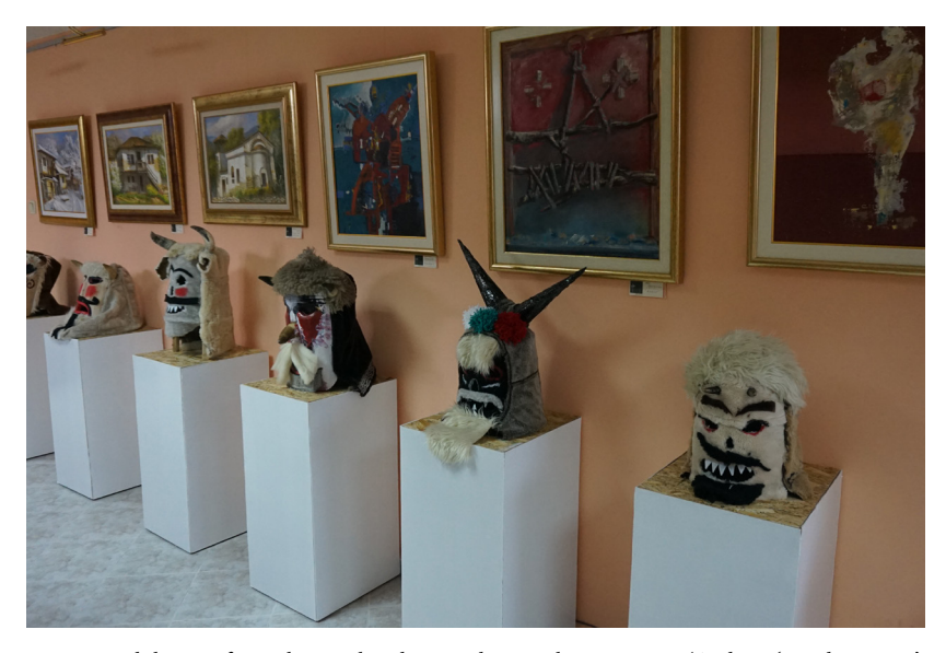
Figure 9. Exhibition of survakar masks. Fhoto: Milena Lyubenova, 2019. (Archive: 'Local Heritage' Association).

In 2018, the 'Local Heritage' Association started implementing a project supported by the 'Culture' National Fund entitled 'Popularizing the Custom of Surva by Means of an Interactive Web Page'. The objective of the project was to introduce one of the significant elements of the intangible cultural heritage in Pernik region, namely the feast Surva to the internet. This would improve access to information about the custom among a wide circle of users in the virtual space by creating a multimedia product representing all the survakar groups in the region on a common platform, which would provide textual information (in Bulgarian and in English), along with photo and video materials. The aim was to widen the possible visibility of the element nationally and internationally by introducing the information in a synthesised and popular form.