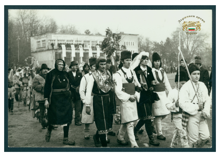
Figure 5. National Festival of Kukers and Survakars – Pernik 1977. Survakar group from Selishten dol village (State Archives – Pernik: Fond. 1134, inventory 1, arch. unit 81, page 2).