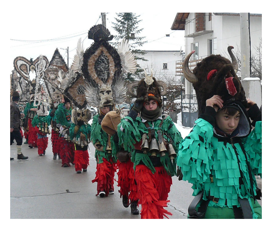
Figure 3. Survakar group from Divotino village. Fhoto: Milena Lyubenova, 2019. (Archive IEFSEM – BAS: FtAIF No.1751, arch. unit 320).