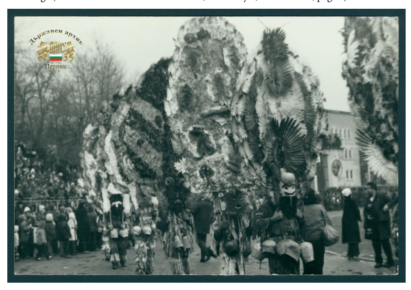
Figure 6. National Festival of Kukers and Survakars – Pernik 1977. Survakar group from Kosharevo village.