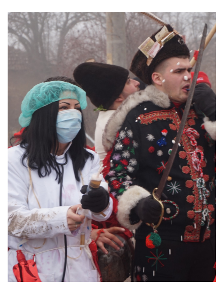
Figure 2. 'Nurse' and Leader of the group from Kosharevo village. Fhoto: Milena Lyubenova, 2020. (Archive IEFSEM − BAS: FtAIF №1837, arch. unit 290).