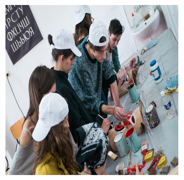
Figure 8. Workshop for survakar masks. Fhoto: Aleksandar Atanasov, 2019. (Archive: 'Local Heritage' Association).

At the beginning of 2019, the 'Local Heritage' Association adopted an initiative supported by the Regional Centre for the Safeguarding of the Intangible Cultural Heritage in South-Eastern Europe under the auspices of UNESCO. Workshops were organized to manufacture survakar masks on the eve of the feast of Surva, the aim being to demonstrate the method of mask manufacture both to the children and young people in a village with a living masquerade tradition and among those from an urban environment as well. A bearer of the masquerade tradition in the Pernik Region demonstrated the manufacturing technology. The workshops were carried out in the course of several days in 'St. Luke' National Secondary School of Applied Arts in Sofia and in the 'Ivan Vazov' Primary School in the village of Izvor, Radomir Region, Pernik District (Fig. 8). The manufactured masks were presented at the exhibition called 'An Encounter with Surova' in the town of Pernik (Fig. 9).