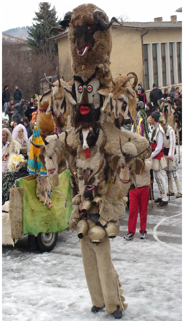
Figure 4. Survakar from Yardzhilovtsi village.

impacted on the survakar games in some of the villages, where the custom gradually started dying out.