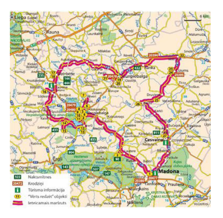
Figure 1.Map of Piebalga cultural region. From Janu seta 2015.

The Piebalga region consists of two small municipalities – Jaunpiebalga (New Piebalga) and Vecpiebalga (Old Piebalga), as well as many other, smaller ones such as Dzērbene, Taurene, Ineši and Rauna(Figure 1; Vecpiebalga.lv 2020; Jaunpiebalga.lv 2021). The municipalities were independent until administrative reforms during 2021, after which they were added to the Cesu region, and most of their management was taken over by the Cesis municipality. Piebalga had already been part of the Cesis municipality until the administrative reforms of 2009 split many of the larger municipalities into smaller ones. Now the Piebalga region is part of Cesis municipality again (Vecpiebalga.lv 2020; Jaunpiebalga.lv 2021).