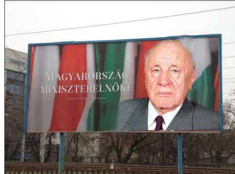
Figure 12.