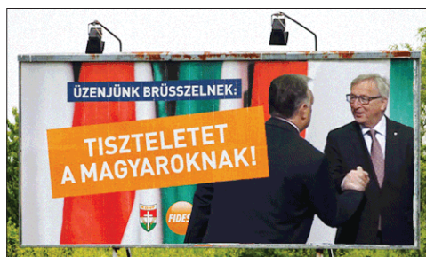
Figure 17. Source: http://sailorripley.tumblr.com/post/119630799351/most-mar-tenyleg-hadat-kellene-uzenni-az-unionak , last accessed on 25 September 2018.