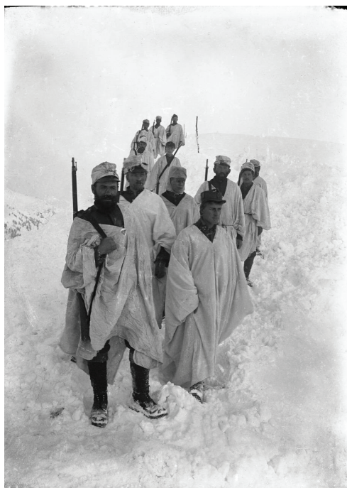
Figure 3. Soldiers wearing white covers to increase camouflage in snow in the high mountains of the Soča battlefield.

Along the Isonzo Front, battles took place in the mountains, but the locals nevertheless collected a great amount of military artifacts and eventually engaged in representations and reinterpretations of the war through local museums and military collections (see Kravanja 2018).