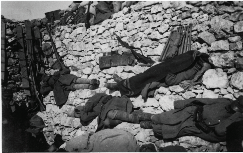
Figure 2. Krn Mountains, Batognica – resting in a trench on the first frontline; the soldiers’ firearms and cold weapons are well discerned in the photograph.

The immediate landscape in which they lived, fought, and often died, utterly characterized their perceptions of the landscape, experiences of war, and memories and commemoration practices after the war. During the war, military landscapes were represented to the public through photographs, films, drawings, and paintings, but they were also portrayed in newspaper reports, personal diaries, memoirs, novels, war poetry, and art. “The human cost of these new landscapes was described day by day ... in memoirs and regimental war diaries” (Saunders 2002, 2003). In the narratives and art, war landscapes were often portrayed as something otherworldly, barren, desolate, lifeless, and poignant.