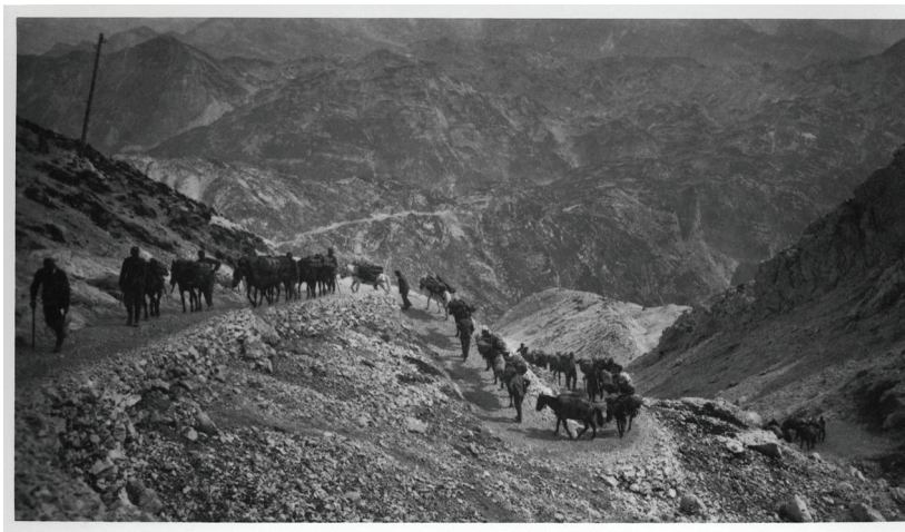
Figure 4. Austro-Hungarian soldiers on their way to the frontline in the Krn Mountains: a view from Peski towards Lemež and Vogel.