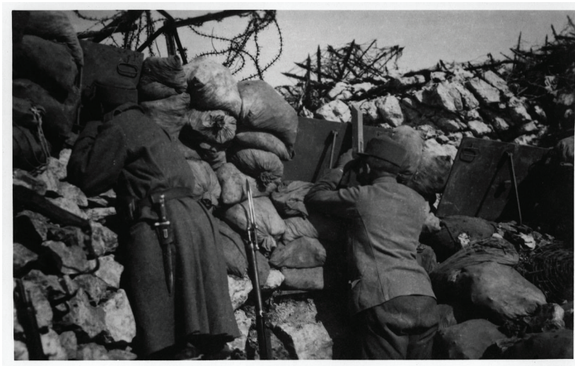
Figure 1. Austro-Hungarian positions on Mount Batognica – the first frontline.

The social and spatial devastation at the end of the war, in 1918, was beyond comparison with anything in history. The dead, missing, and wounded were counted in the millions, and many of the survivors were ill, crippled, or mentally affected. The landscapes of the front and its hinterland were also devastated or changed by industrialization and infrastructure. Trees were cut on a massive scale and used for construction timber and firewood at the camps and on the front. Roads, a railroad, a power plant, mountain paths, and cargo cableways were constructed as entire regions were militarized. At the front, land and life were destroyed, and the landscape acquired new meanings through military actions and human experiences of war. In the Alps, the soldiers on the front took up positions in caverns, trenches, and fortresses. They were not only targeted by enemy bombs, but also endangered by the harsh mountain environment, cold temperatures, and deadly avalanches in the winter.