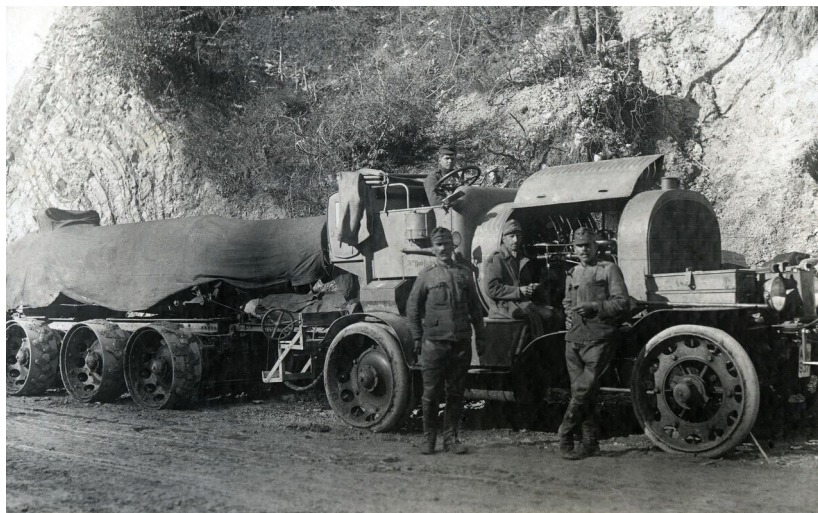
Figure 6. Many new soldiers, plenty of equipment and arms had to be transported to Posočje for the needs of the joint Austro-Hungarian and German offensive. Transportation of the Austro-Hungarian 38cm mortar on the road towards Podbrdo.

With time and the Second World War, these landscapes were largely forgotten. Several monuments were erected, but many memorial places, such as graveyards, mountain fortresses, or caverns, were only much later transformed into tourist destinations, sites for archaeological research, or collections of military remains. Politics and practices of remembering and forgetting are seen in the changing landscape: battlefield remains were removed, reconstructed, or moved into institutions such as local museums. Saunders writes (2001a: 45) that the rediscovery and remembrance of the First World War in France started with the fiftieth anniversary of the war.