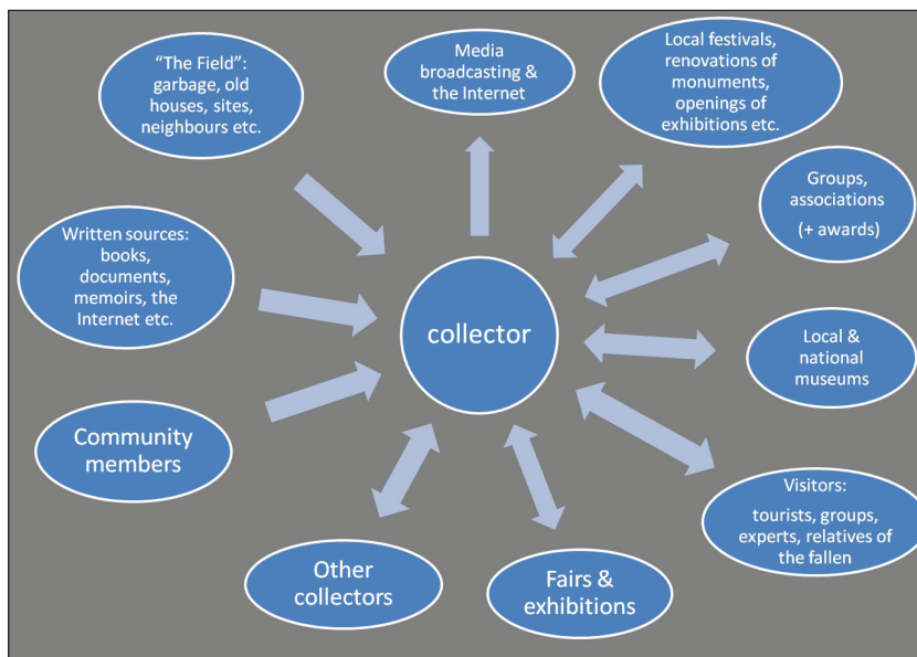
Figure 7. Channels and fields of interaction through which the collectors acquire artifacts, communicate information and knowledge about them, and engage with others in maintaining their collections.

However, apart from including amateur collectors in these unifying heritage and tourism frameworks, and giving them particular roles within them, the collectors themselves are in constant interaction with the local surroundings. They have therefore built their own additional networks and channels, through which they communicate with their items and with the knowledge that they acquire from them (Fig. 7).