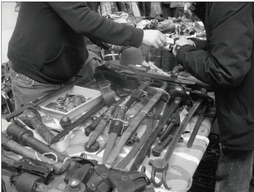
Figure 11. The First World War antiquities market in Šempeter pri Gorici, organized by the Isonzo Front association. Photograph by the author 2016.