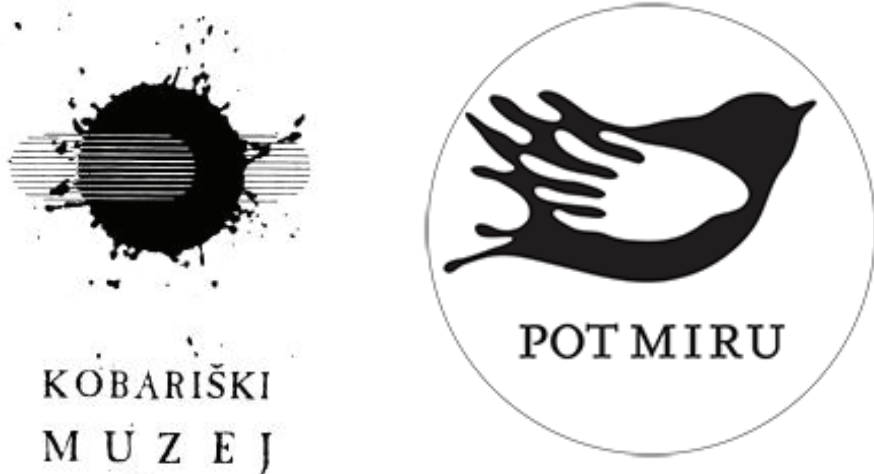
Figure 2 & 3. Two styles of narratives about the Isonzo Front as seen in the logos of the Kobarid Museum (left) and the Walk of Peace (right).

In the next decade, the Walk of Peace made an enormous effort in preparing the landscape for cultural tourism. Battlefields were presented in a scholarly manner, trenches were cleaned, equipped, and preserved, and outdoor museums were established on the frontlines and connected with a thematic trail from the Alps to the Adriatic (see Koren 2015). Specialized tourist guides were educated and trained for the area, a new documentation-information center was established, thematic exhibitions, conferences, and other First World War-related events were held, and, last but not least, EU funds were obtained through various cooperation and cross-border programs and projects. All of these activities and many more also attracted various heritage specialists, museum curators, professional historians, and other social scientists and scholars in the humanities. In two decades or so, the front was given a scholarly touch, promoted, adapted for tourism, and made ready for the global commemoration of the First World War centenary (2014–2018; Fig. 4).