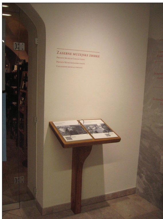
Figure 1. Private collections are represented in the main exhibition hall of the Walk of Peace.

The aim of the Walk of Peace was to add to the Kobarid Museum's achievements in terms of acquiring deeper knowledge about the Isonzo Front, presenting it in a more scholarly way, creating, managing, and promoting its battlefields in situ, and coordinating many front-related activities that started to mushroom locally and nationally after the Kobarid Museum's success. This time the pacifist message was put at the forefront of the Isonzo Front presentation and was institutionalized in the name of this new organization and with its logo. It is notable that the soft image of a dove almost diametrically opposes the dramatic image of the breakthrough, which is symbolized in the Kobarid Museum's logo (Fig. 2 & 3).