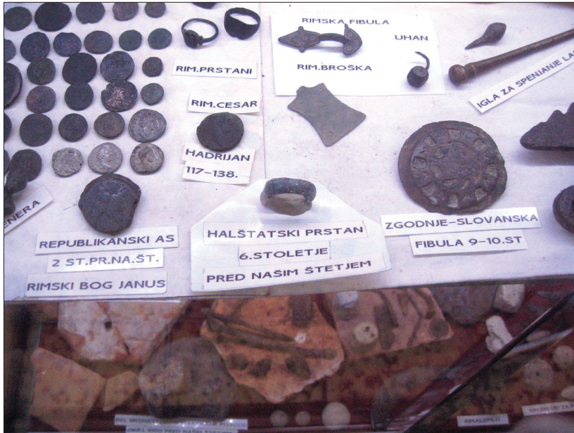
Figure 10. A 'big find': a Hallstatt ring from the 6th century BC confirmed by archaeological analysis as an important find of the local area. The ethno-war collection in Breginj. Photograph by the author 2017.