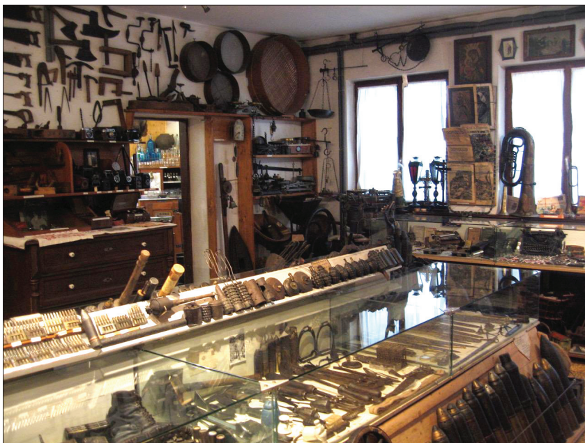
Figure 9. A military artifact section against an old agriculture-related section in a private collection. Ethno-war collection in Breginj.

with this flow, the early collectors started using metal detectors as soon as they became available, but many of them also turned their interest away from weapons to small personal items of soldiers, which bore more potential for imagining the experience of war. Last but not least, some also turned away from the war altogether and found more excitement in older, even prehistoric items that, in the best possible scenario, led them to consult with an archaeologist (Fig. 10).