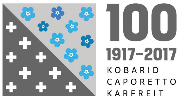
Figure 4. The Walk of Peace logo for marking the First World War centenary.

bodies, which does not directly suppress the creativity, passion, and subjective initiatives, but selects and tolerates them. As long as the new ideas and initiatives fit into the general ideological order of commemoration of the First World War and sustainable tourism development, they can fruitfully enrich the equipped, clean, and sanitized caverns, trenches, and fortifications or – for better or worse – add new ones. This order is therefore not stifling and dominating in the Adornian sense of “cultural industries”. It instead promotes inclusiveness, which is epitomized in the softer concept of “creative industries”.