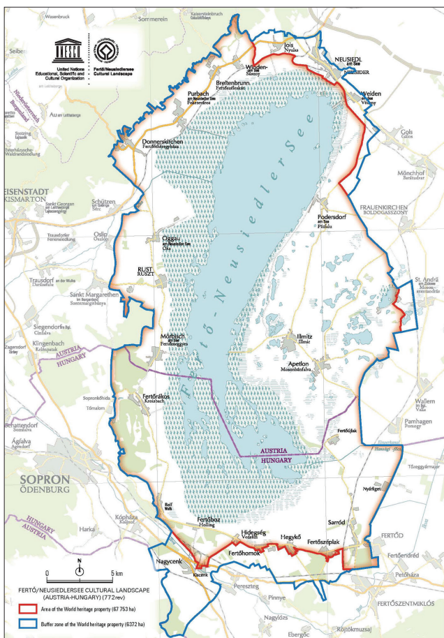
Figure 1. Map of the Fertő Cultural Landscape. Official site of the UNESCO World Heritage sites in Hungary ( http://www.vilagorokseg.hu/fertoneusiedlersee-cultural-landscape ).

even split in two a lake, called Fertő or Neusiedlersee, in the north-western corner of contemporary Hungary. The area around the lake has marvellous flora and fauna, with jewellery-box-like small towns. The closeness of the economically more prosperous Austria and of the entertaining and touristy Lake Fertő/Neusiedlersee made this part of the country tempting to settle or to establish a business after the political change in 1989. The researched landscape has earned regional, continental, and world recognition through the establishment of a transnational nature park in the early 1990s, and has received numerous awards for its environmental protection activities, gaining World Heritage status from UNESCO (2001) and the European Heritage Label by the European Council (2015). The following research discusses how this drastic change in the evaluation and characteristics of the area from a militarised, almost harsh territory to a peak region of the country happened, and what kind of memorialisation practices took place during the last approximately quarter century (Fig. 1).