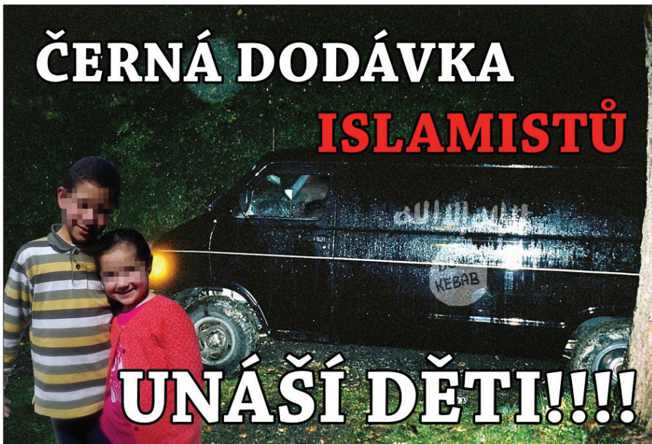
Figure 1. “Islamists’ black van is kidnapping children!!!” A hoax spread via Facebook in November 2015.