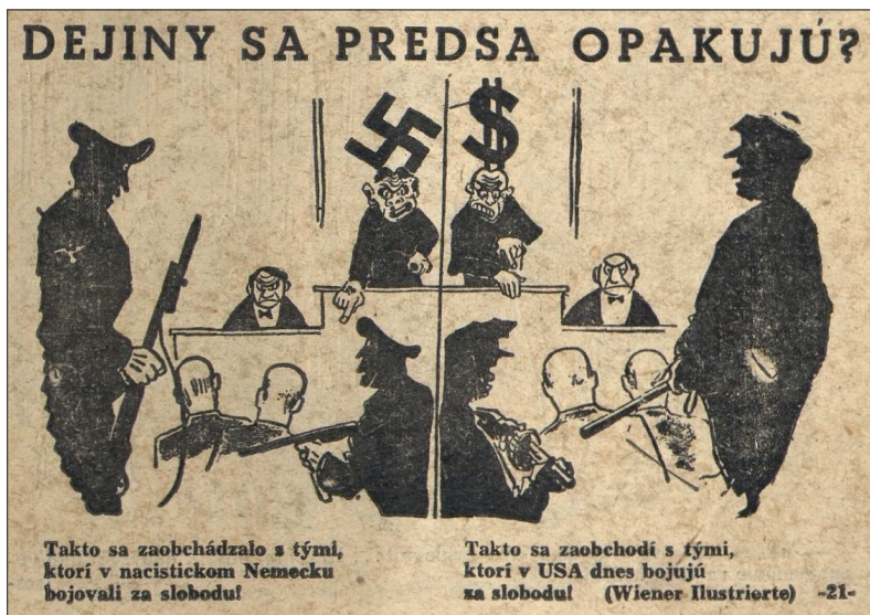
Figure 4. History still repeats itself. (Roháč, Vol. 3, No. 12, 1950, pp. 2–3)