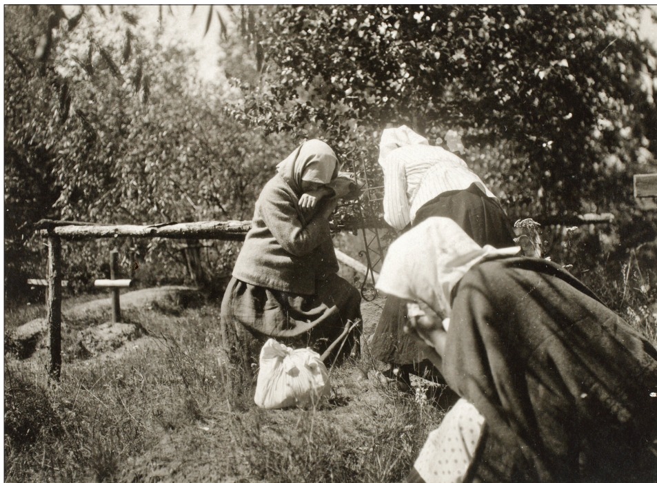
Figure 1. Visiting graves after burials was when burial-related songs were sung. Illustrative picture of women lamenting a dead person in Obinitsa graveyard. Photograph by Armas Otto Väisänen 1922 (ERM Fk 350:214).

Next I am going to introduce and analyse five biggest burial-related types of the runosong, bring out characteristic elements, and try to match these with actual burial traditions. I also give approximate time periods when a song-type may have emerged. The most numerous song-type is “Daughter on her mother’s grave” (1001 songs), followed by “Mother and loves” (200), “The burial of a boy and a girl” (181), “Open graves” (143), and “A coffin made of stones” (129). 2 All of these song-types have spread across Estonia. Also, there are 21 minor song-types about burials, which altogether consist of 110 songs. I am not going to introduce and analyse the minor song-types, but sometimes I use their elements in comparison with the major song-types.