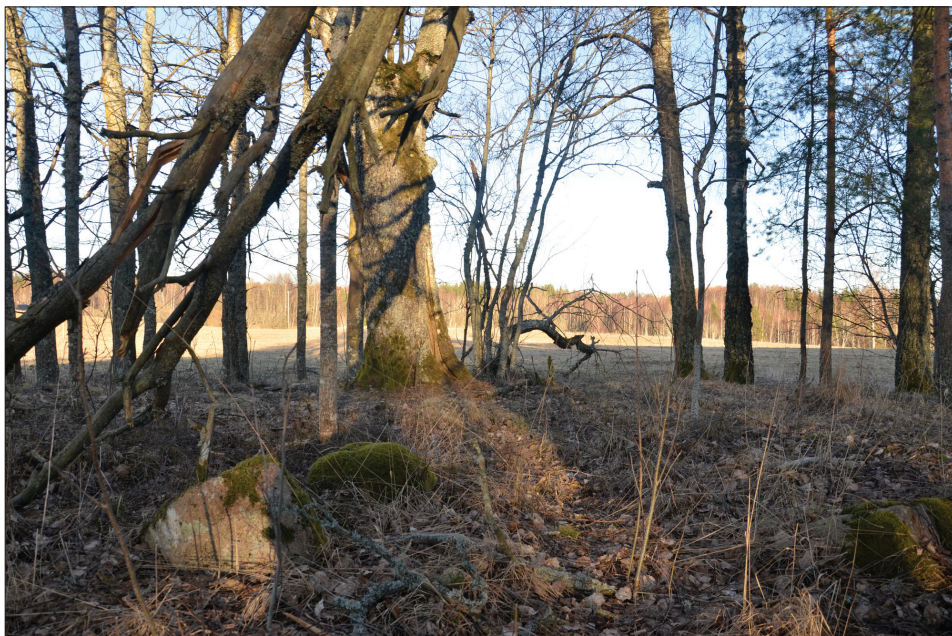
Figure 2. Contemporary appearance of a stone grave with stones and trees in Karula Parish.

In the song-type “Daughter on her mother’s grave” the dead are usually in their graves; they can communicate, but otherwise their activities are quite limited. Some songs depict the dead as more active, for example: