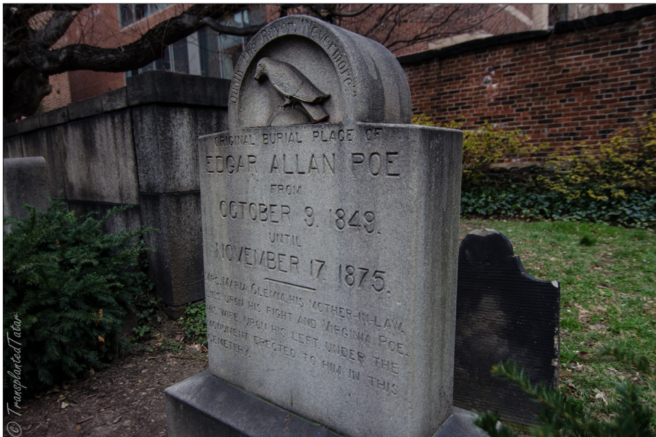
Figure 2. Poe’s original grave. Westminster Hall and Burying Ground, Baltimore, MD ( https://transplantedtatar.com/2013/04/01/poe-amontillado-wine-tasting-201/ ).

An Internet search produces multiple websites speculating on the possible causes of Poe’s death in both scholarly databases and popular websites. The scholarly sources tend to include detective work in Poe’s papers and letters, along with examination of his contemporaries’ letters. However, even in the scholarly sources there happens to be a rather laissez-faire use of medical terminology, resulting in some bizarre diagnoses of what caused Poe’s death. Hopkins, for example, refers to the possibility that Poe suffered from “sclerosis of the liver” (2007: 42), possibly confusing sclerosis with cirrhosis. Beyond aca-