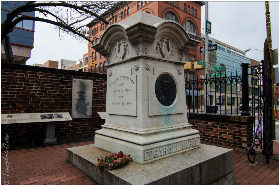
Figure 3. Poe monument. Westminster Hall and Burying Ground, Baltimore, MD ( https://transplantedtatar.com/2013/04/01/poe-amontillado-wine-tasting-201/ ).

in 2009, the 150th anniversary of Poe's death. Although there are numerous Poe performers (Ocker 2015: 25), who dress up as Poe and read his works or who act in Poe-inspired performances, such enacted performances are different from the spectrum of folklore dynamism surrounding the media-named Poe Toaster (Toelken 1996: 40–43). The Poe Toaster's annual ritual draws on the traditional perception of Poe as a man of mystery, death, and horror, by adding another layer of mystery to his name and death. The ritual's site is clearly significant: Poe's grave contains not only the great poet's earthly remains, but also his aura. Weirdly uncanny to modern sensibilities, he rests there with his wife/cousin and mother-in-law/aunt. As a cultural marker, the Poe monument is a tourist attraction and a highly visual landmark in Baltimore. A wooden engraving depicting its unveiling in 1875 shows a woman placing a wreath adorned with a raven on top of the monument, a rite that establishes a clear symbolic connection between the black raven, a bird often associated with wisdom, death, and graveyards in popular culture, and Poe, whose most famous poem is, of course, The Raven (Society n.d.).