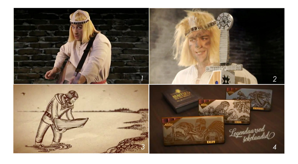
Figure 4. Images of Kalevipoeg. 1–2. Kalevipoeg is doing audition for the Metsatöll band. Advertisement for Consumer Protection Board. 3–4. Tastes to remember (Kalev chocolate advertisement).