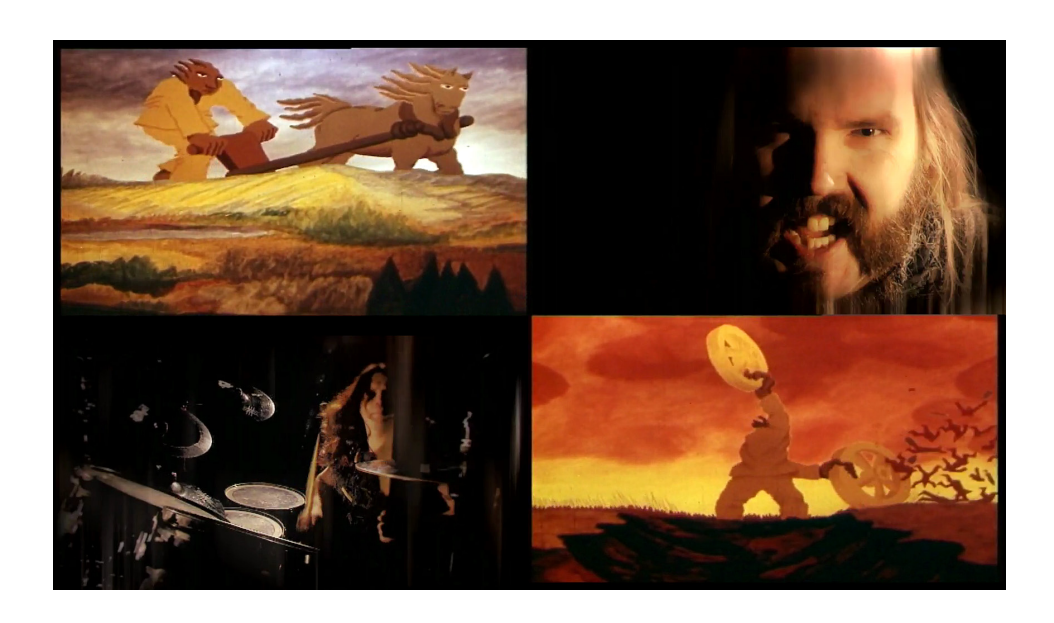
Figure 3. Metsatöll, Vaid Vaprust (Only Bravery) on Youtube, using images from Suur Tõll.