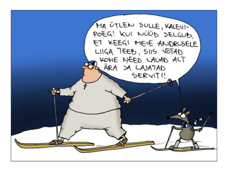
Figure 4. Urmas Nemvalts's daily caricature in Postimees from April 7, 2011, illustrates the column entitled "Hands off Andrus Veerpalu!" (The caption reads: "I am telling you, Kalevipoeg [hero of the national epic]! If now it turns out that anyone wants to hurt our Andrus, then you'll have to take these planks off your feet and lash out!") (http://arvamus.postimees.ee/415846/paeva-karikatuur-kaed-eemale-andrus-veerpalust).