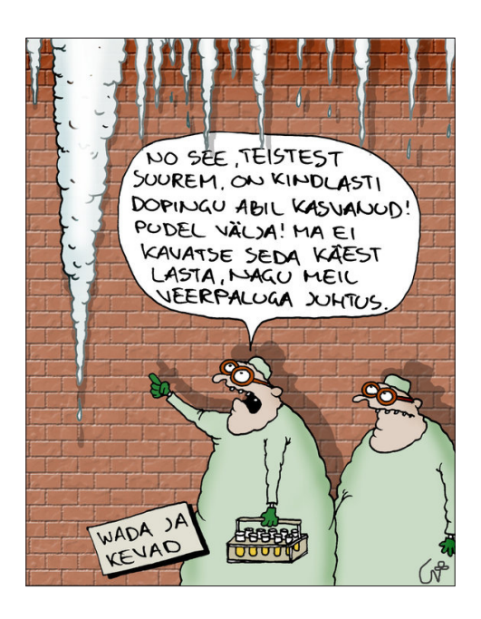
Figure 5. Urmas Nemvalts's caricature WADA and Spring, published in Postimees on March 27, 2013, a day after Veerpalu was acquitted in court (The caption reads: "Well, this one, bigger than the others, must have grown on doping! Bring out the bottle! I will not let it get away from us, as it happened with Veerpalu.") (http://arvamus.postimees.ee/1183244/paeva-karikatuur-wada-jatkab-voitlust).