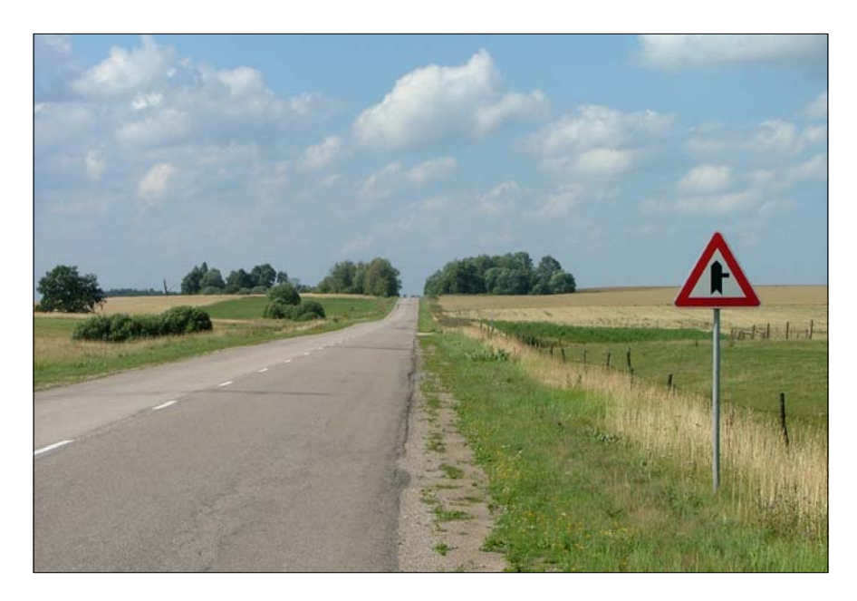
Figure 3. Koniņi Elka Grove nowadays.

knew one of the two variants of the name of the holy forest: Elku\ birzs or simply Elka.