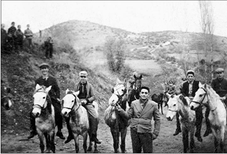
Figure 2. Horse race in Komara.

Aratos village (10 km from Sapes). All the horse races ended on the threshing squares of Sapes, the place where the trade fair was held.