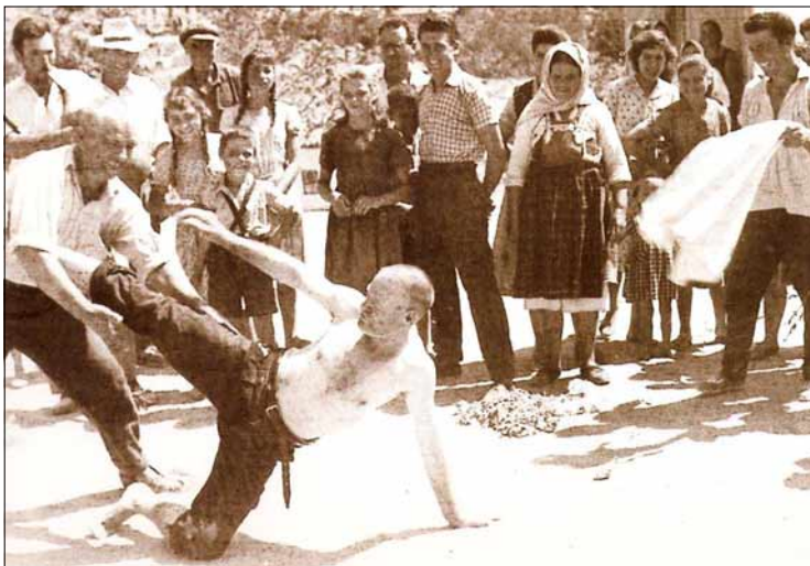
Figure 4. Wrestling event at a wedding in Karoti of Didymoteicho region to the accompaniment of bagpipes in 1960.

Folk matches of wrestling were held at different celebrations and festivals in Evros. In the village Rizia and the Ilia prefecture where they celebrated the ritual procession (aiming to satirize the Turkish oppression and lead by bey ), wrestling games usually accompanied the celebrations. Wrestling was also organized in the Ftelia village on the festival on St Thomas's Day, in Komara on the feast of St Kyriaki, in Sitochori on August 16, in Dikaia on the feast day of St Tryphon, in Ormenio and in Kastanies on St George's Day.