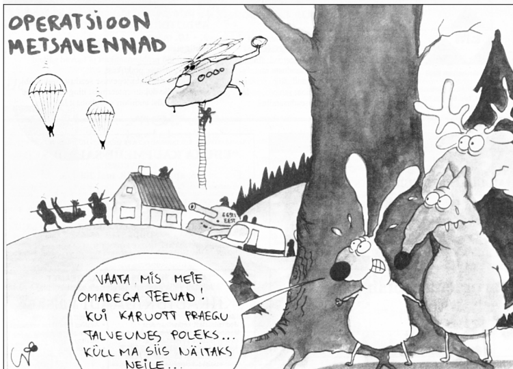
Figure 3: Operation Forest Brothers. Hare: "Look, what they are doing to our men! If the bear wouldn't be hibernating... I would go and kick their butts..."