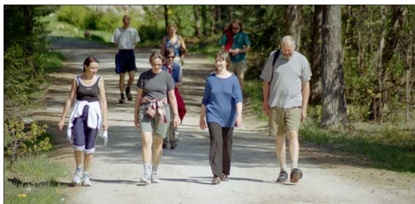
Participants of the seminar on their way to the Toolse castle ruins.