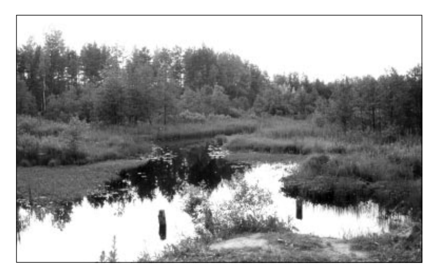
Photo 2. Site at River Tshämee [sh=s'] where water suddenly swirls upstream. According to the folk belief it was the place where resided water spirit ("jõggõõ emä" or "vesi-emä").

As the bodies of water were first and foremost dangerous for small children it is not surprising that the stories about water spirits were told to scare children away from water. The short reports contain but few detailed descriptions (for example, their long, dark hair) about the nature and appearance of water spirits, and are mostly limited to a mere recognition that the water spirit takes or draws people into the water. Such didactic methods have probably been applied at different periods of time. The pedagogic function of water spirits appears to have persisted in tradition for the longest period of time, even when the more elaborated memorates and legends about water spirit as drowner have lost their topicality and have receded from the tradition.