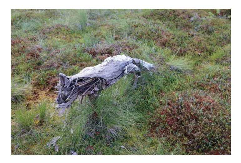
Figure 2. When I visited the mire, the changing seasons and the normal life of nature had already changed the pieces of artworks.