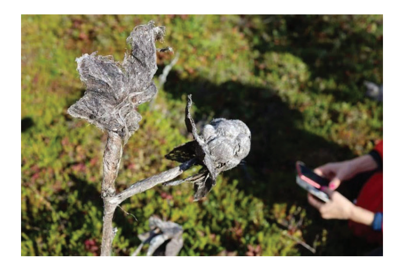
Figure 4. Art in the Sahanneva mire is reborn every day, and also according to natural light, as there is no separate art lighting in the mire.

Moral and ethical issues are central to art in nature. Partanen argues that art that is placed in a mire should not disturb nature (see Laurén 2022). Hence, the materials were selected from the perspective of ecological sustainability, and will decompose over time. During the interview, we did not discuss in detail her thoughts about the changes and forms the pieces might take in years or decades to come. The use of an old Japanese varnish, urushi, which is resistant to cold and water, ensures that the works do not decompose as quickly in nature as they would without the varnish, so in this sense she has influenced the natural decay. But the artwork may have a positive impact on the mire's own plant and animal life, and, for example, the design of the works also considers that the artworks can act as insect hotels in the mire. Furthermore, environmental education values can be seen behind the work, and the interviewee was fascinated by the idea that art could introduce people to different areas of the mire and support the idea of spending leisure time in nature. Underpinning this is a consideration that a work of art has its own intensity, so it is essential to ask what art can do and what effects it may have on its audience, and not only what art means or what it refers to (see Kontturi 2018).