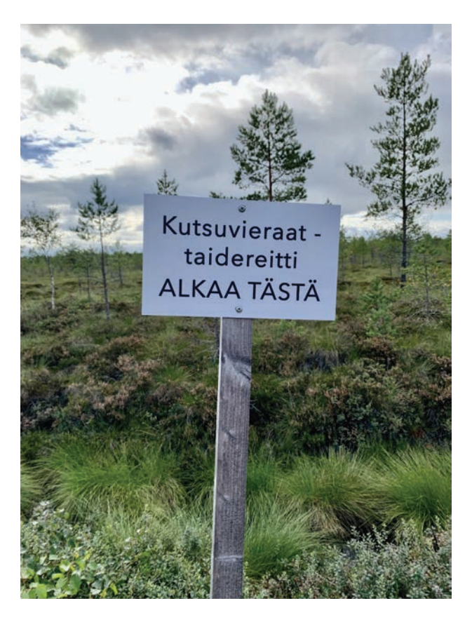
Figure 1. The Invited Guests Art Route in the Sahanneva mire invites you to walk in mire nature and wonder where you can find art.

forest ditches (Sahannevan luonnonsuojelualueen vesitalouden ennallistamissuunnitelma 2022), with the aim of improving biodiversity, mitigating climate change, and improving water protection, while considering the recreational use of the area. In 2016, the Regional Council of South Ostrobothnia conducted a map-based survey open to all to support the preparation of the regional plan, the purpose of which was to find out the respondents' thoughts on the mire nature of South Ostrobothnia, its different uses and exploitation methods, and the values associated with mires. The survey received hundreds of responses and showed that most respondents visited the mire a few times a year, but there were also dozens of monthly and weekly visitors. Drainage and peat production were seen as threats to mires, and concerns were expressed about the changes that had already taken place in mires, the future of pristine mires, as well as the lack of appreciation of mires (Etelä-Pohjanmaan suoluonto-kysely 2016).