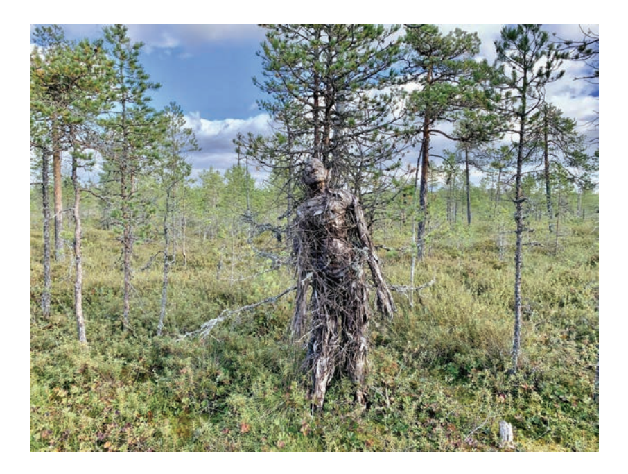
Figure 3. The only human figure in the series resembled a skeleton because of its transparent structure.

The full-size human (Fig. 3) built into a tree is a reference to Partanen's earlier sculptural installation, where figures were made of natural fiber masses. Notably, the pieces of artwork in the mire transcend interspecies boundaries, for example, by presenting blood vessels that become roots or showing trees that begin to grow from human feet.