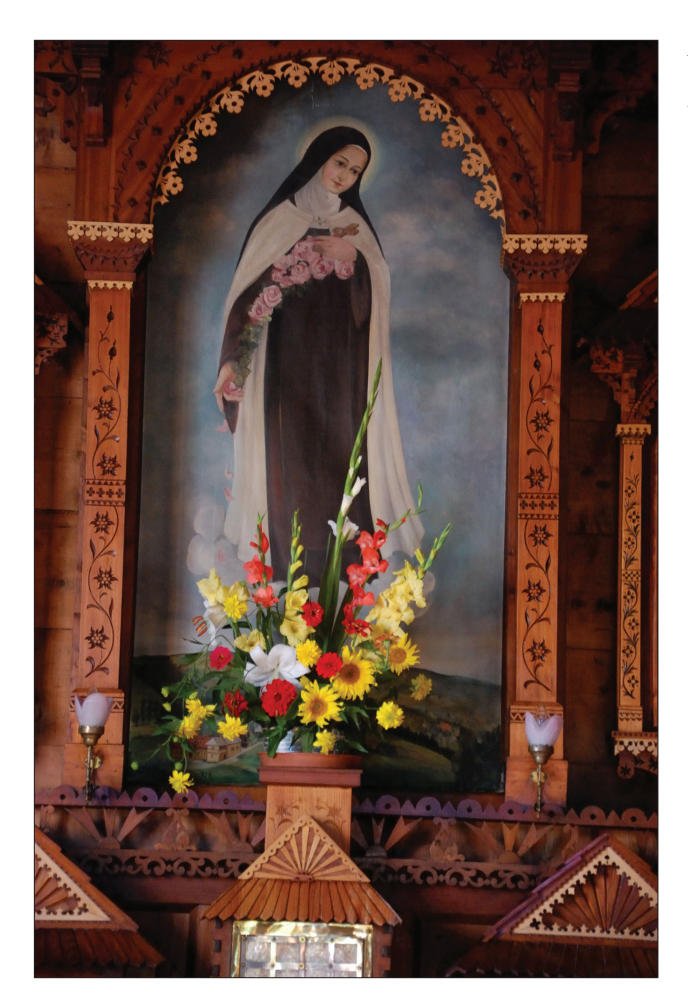
Figure 4. Chapel of St. Thérèse of the Child Jesus in convent. Photograph by the author 2014.

she is referred to also today) lived in unity with God, aware of His permanent presence. People who met her knew that she was different and they watched their female neighbour's long prayers, which was what distinguished her from others. The prayer created an invisible barrier separating her from the group, but at the same time it did not exclude her from the ongoing daily life.