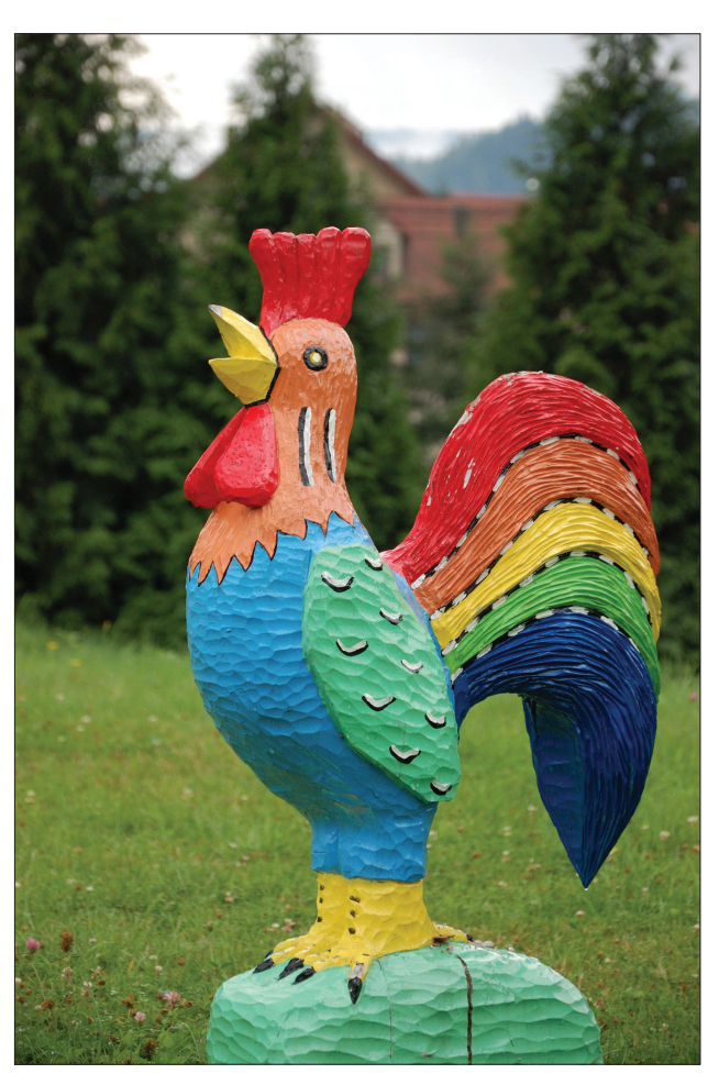
Figure 2. A contemporary wooden toy from Stryszawa.

tochthonic mystic woman, Cunegonde Siwiec.