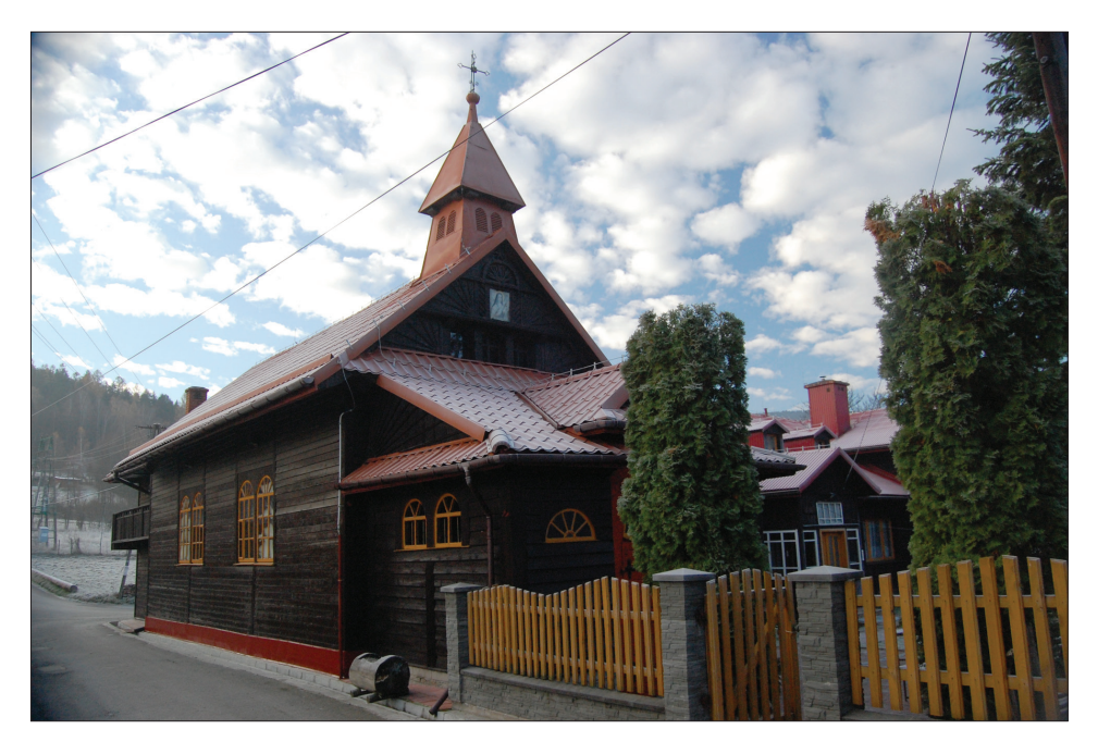
Figure 8. The local convent of the Sisters of the Resurrection in Stryszawa.

A man from the lower village of Roztoki states: 'Nobody knows anything about Kundusia there and will say no good word of her. Why? You had to work there, she was alone, had a lot of land and needed help, but where did the money come from?' (an 80-year-old man from Stryszawa). One of the women speaks out about it, considering the sphere of sacrum and the perspective of spiritual combat: