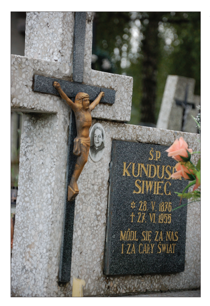
Figure 7. Cunegonde's tomb near the church of Saint Anna in Stryszawa.

In the Catholic religious observances, reverence of saints who are not accepted by the Church authority is rather rare, and any such occurrences are not long-lasting. The required standards in this respect distinguish Catholicism from the Orthodox Church and from some sects where there may be a grassroots veneration of saints. As a result, Cunegonde's case would not spread among believers unless it was approved by the clergy. Roy Rappaport claims that the confirmation of sainthood consists of a few elements: apart from the faith factor and using the Ultimate Sacred Postulates, the believers' involvement in liturgy is crucial (Rappaport 1999: 288, 396). The case discussed in the article first requires the church authorities' consent. As a result, both the dynamism of the faith and the extent of the folk mystic's cult are connected with the progress of the church committee's work. At this point in time, as since 2007 there has been a beatification process in progress in Rome, a certified miracle