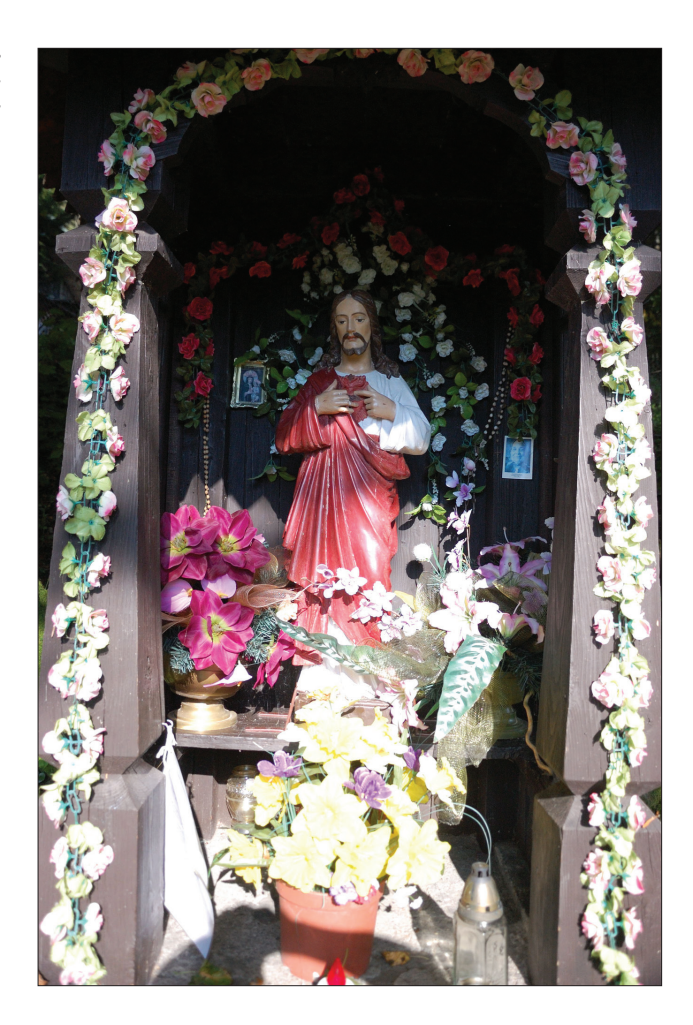
Figure 9. The Chapel of the Heart of Jesus on the outskirts of Siwcówka.