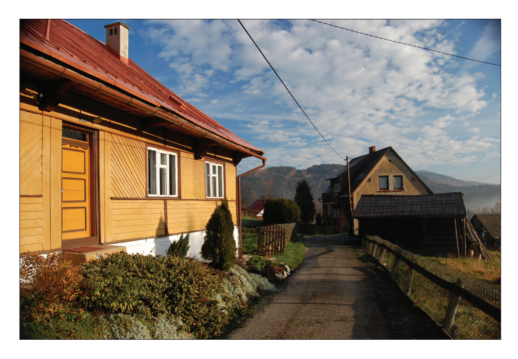
Figure 5. Cunegonde's wooden house.