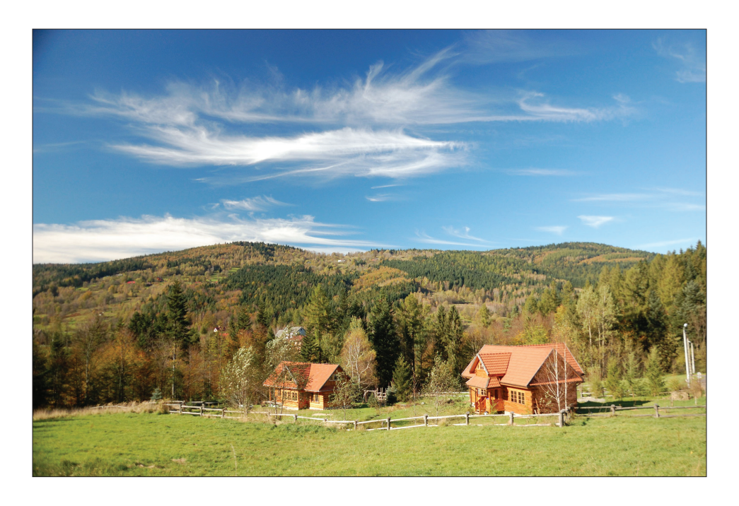
Figure 1. The present panorama of Siwcówka. Photograph by the author 2014.

Stryszawa gained a permanent reputation as an area of highland robbers. A powerful example of this is a contemporary crest of Stryszawa, which includes two curved knives. Etymology and history also point to poverty as a motivational factor to lawlessly commit robberies. The old Polish word strysz means either