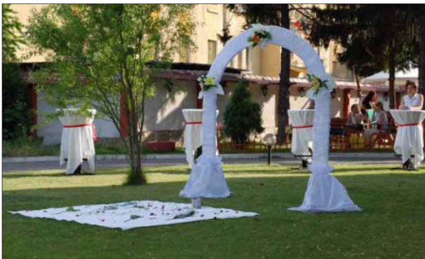
Figure 4. The white cloth laid out in the garden of a restaurant in Sofia.