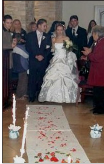
Figure 5. Newlyweds on the cloth. Sofia.

village to the city very literally, the process can sometimes be difficult and even amusing: