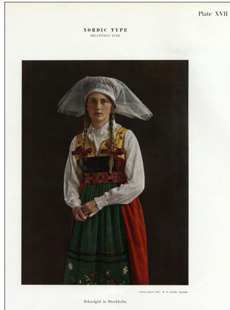
Figure 2. Girl categorised as a Nordic type in Herman Lundborg and F. J. Linder’s The Racial Characters of the Swedish Nation (1926).

tion of ‘others’, for example, when the roles of class and status are considered. Ekström in particular points out that certain groups within western societies have been singled out as the ‘others’ for not fitting into the notion of a western ideal: “single-parent mothers, social-welfare cases and various ethnic minorities may often personify the notion of the threat from within” (Ekström 2006: 21, author’s translation).