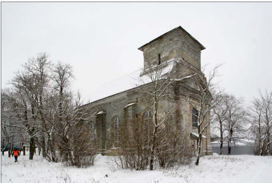
Photo 8. The Church of St. George the Great Martyr in Paldiski (consecrated in 1787).

Following the incorporation of the island of Saaremaa into the Russian Empire in 1710, an Orthodox community of Russians also formed on Saaremaa,