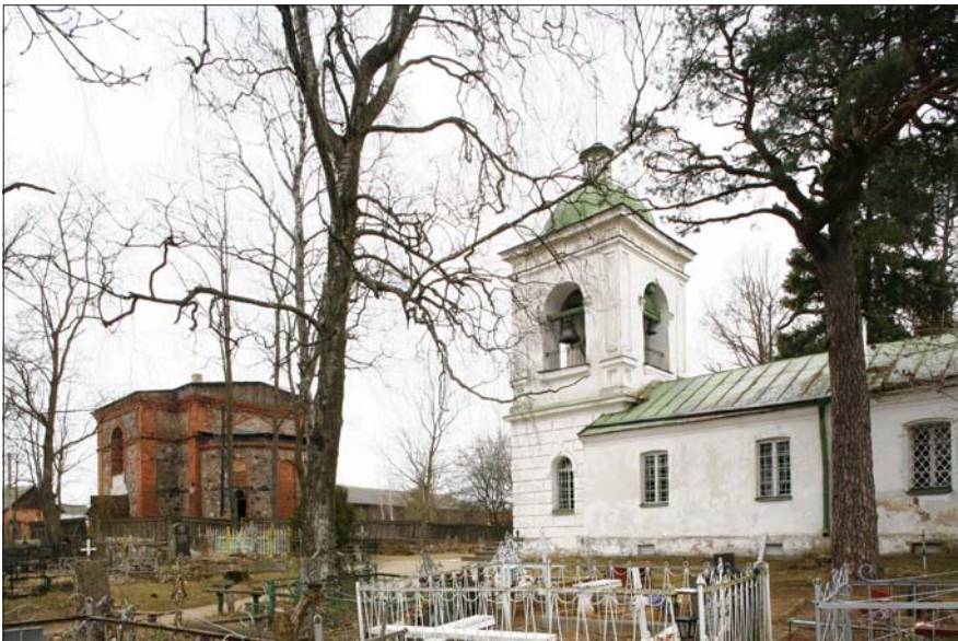
Photo 11. The Church of St. Paraskeva the Great Martyr in Saatse (consecrated in 1801).