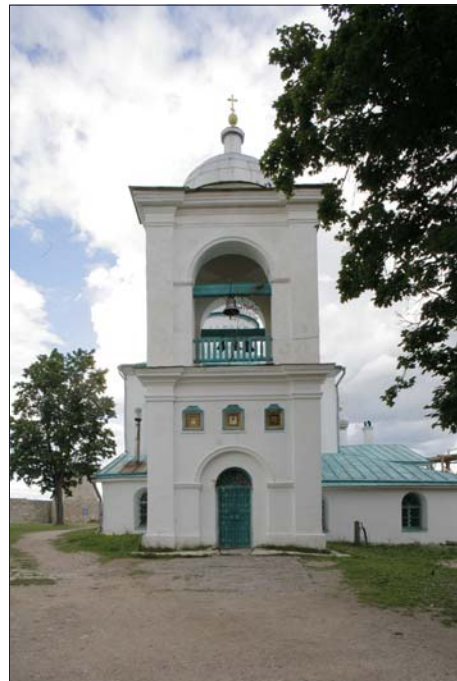
Photo 1. The Church of Nikolai (St. Nicholas) in the Irboska fortress (in the Pechory District of the Pskov Oblast of the modern Russian Federation).

The Orthodox Church mission may have reached Setomaa as early as in the 11th or 12th century. If we are only able to make assumptions about the influence of the earlier Orthodox churches and monasteries with regard to spreading the religion among the non-Russian-speaking people of