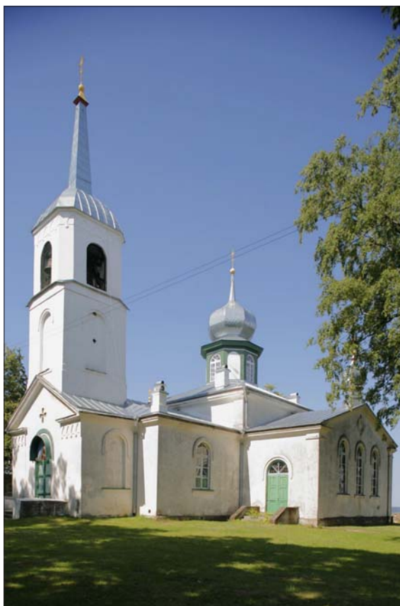
Photo 9. The Church of the Protection of the Holiest Mother of God in Nina (consecrated in 1828).

The Church of the Protection of the Holiest Mother of God was built in the village of Nina , the main population centre of the Old Believers, situated on the shore of Lake Peipsi. The village of Nina is the also oldest surviving village of Orthodox Russians on the western shore of Lake Peipsi, and was probably founded in the 17th century (Moora 1964: 60). By the time the church was built, Nina was the only almost exclusively Orthodox village in the region predominantly inhabited by Old Believers. Previously, the sparse Orthodox population had been without a church of their own. The congregation of Nina was established in 1824 and the church was designed by G. F. W. Geist, a master builder from Tartu (Tohvri 2004: 56). Construction work took place from 1824 to 1828, and the church was erected on a plot bestowed by Baron Stackelberg. The construction was funded by the state with the help of private donations, including those from local Lutheran landlords. 50