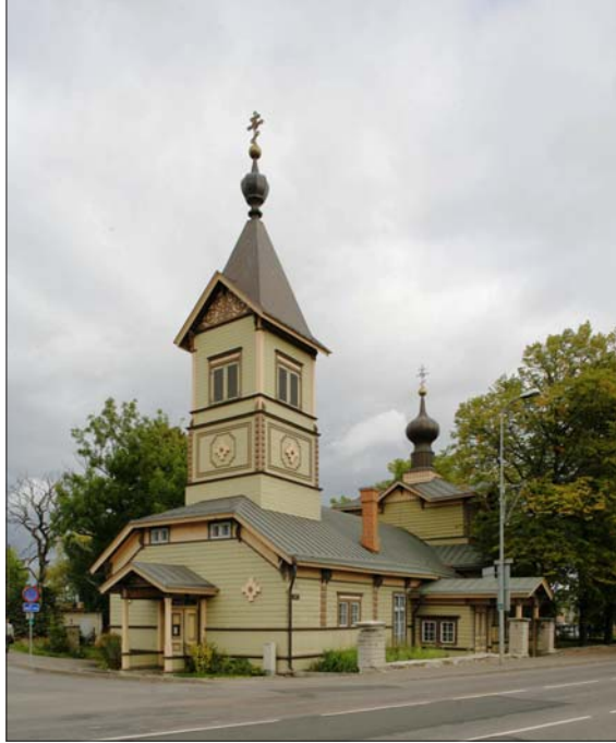
Photo 6. The Church of St. Simeon and the Prophetess Hanna in Tallinn (completed in 1755).

to replace the Nikolai (St. Nicholas') Orthodox Church, which dates back to the Medieval period and was falling apart by the beginning of the 19th century. There was a desire to build a new church as early as 1804, but it was not built until 1822–1827; the construction was drawn out due to lack of funds. The domed church, with some Neo-classicist features, was built according to the design of L. Rusca from St. Petersburg, who was Swiss by origin (Berens 1974: 364–365; Pantelejev et al. 2002: 26–36; Tallinna 2009: 43).