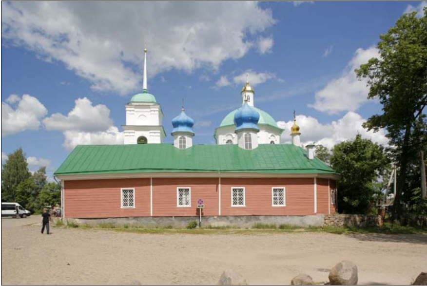
Photo 10. The Church of the Holy Great Martyr Varvara (Barbara) in Petseri/Pechory (completed in 1779).