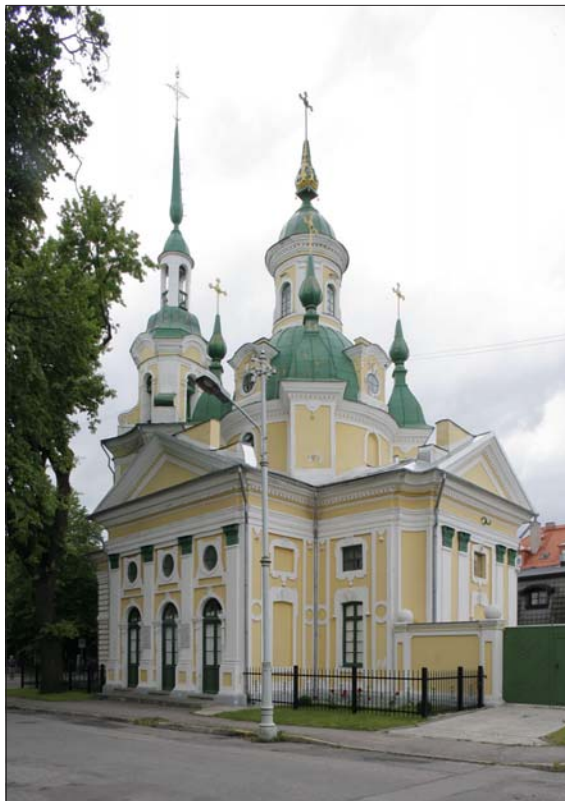
Photo 7. The Church of St. Catherine the Great Martyr in Pärnu (consecrated in 1769).

In Pärnu , the Jaani (St. John's) Church, which belonged to the Estonian Lutheran congregation, was taken over in 1710 to hold Orthodox services and sanctified as the Uspensky Church. This congregation was later reformed as the Katariina (St. Catherine's) congregation. Probably shortly after that, in 1710, a new Alexander Nevsky garrison church was built. In the 1740s, this wooden church was replaced with a new wooden one, which stood from 1749 to 1791.