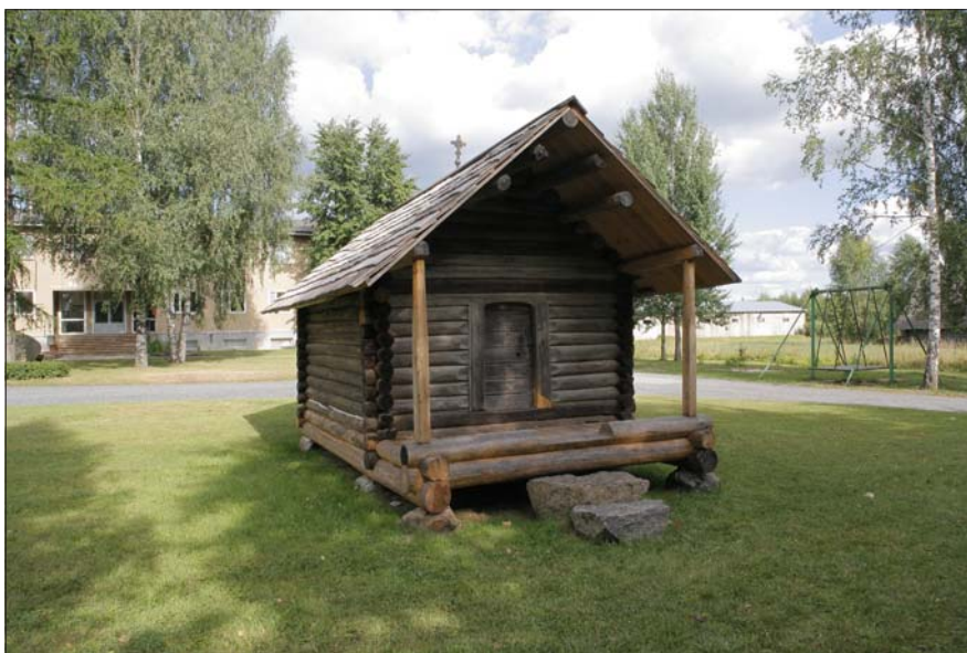
Photo 4. Mikitamäe Tuumapühapäevä (Toomapühapäeva) tsässon after restoration in 2009.