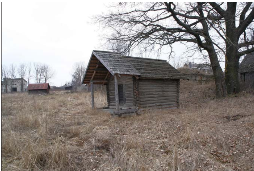
Photo 3. Mikitamäe Tuumapühapäevä (in Estonian Toomapühapäeva, for Setos also ollõtuspühä or kõllapühapäevä or väiko lihavõõdõ) tsässon. According to dendro-dating, the oldest tsässon, preserved within the Estonian territory of Setomaa, built probably in 1694. Photo by Arne Maasik 2008.