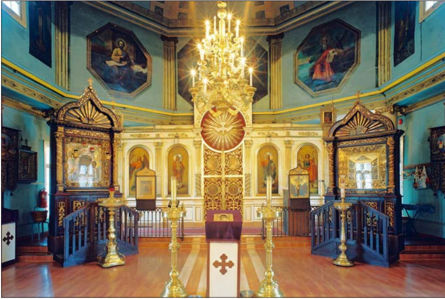
Photo 5. The Church of the Nativity of the Mother of God (Kazan Icon) in Tallinn (consecrated in 1721). Photo by Arne Maasik 2009.

The church was reconstructed in the first half of the 19th century: the building was covered with wood boards and both the interior and the exterior were given a period-specific Neo-classicist appearance. 40 By 1734, the Church of Teodoros (St. Theodore) the Commander was built in Tallinn and existed until 1842 (EÕK 2007: 26, 40; Berens 1974: 351, 369).