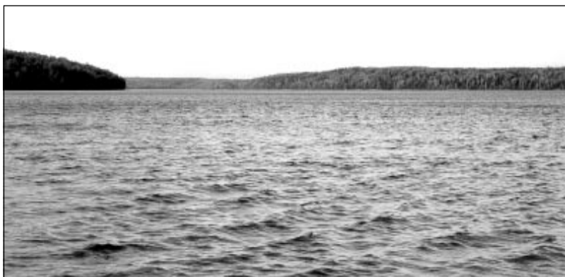
Photo 1. Lake Suväjarvi.