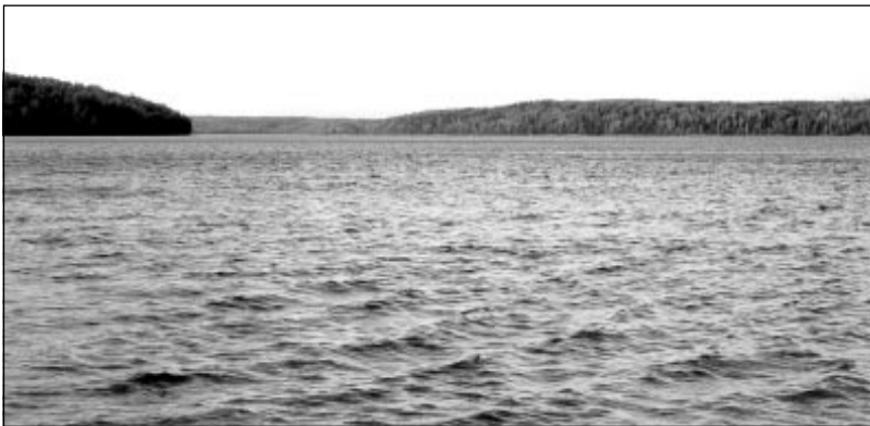
Photo 1. Lake Suväjarvi.