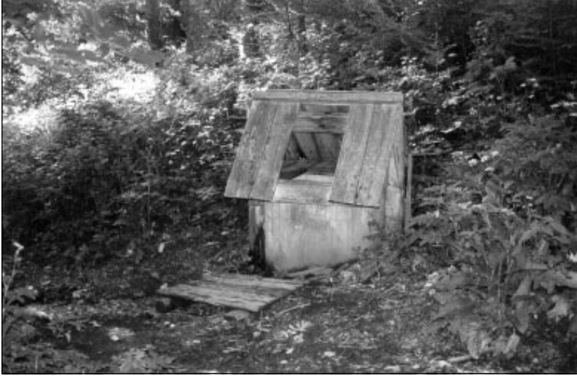
Photo 3. Spaasaa lähe in Kabrio.