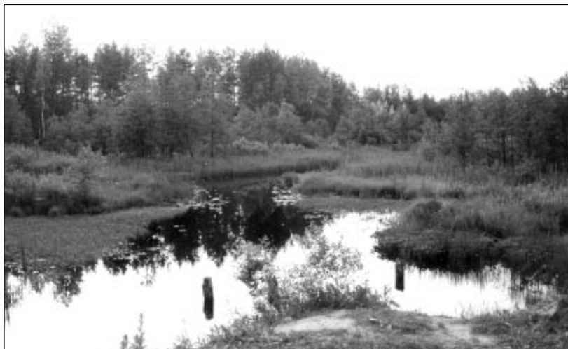
Photo 2. Site at River Tshämee [sh=s'] where water suddenly swirls upstream. According to the folk belief it was the place where resided water spirit ("jöggöo emä" or "vesi-emä").

As the bodies of water were first and foremost dangerous for small children it is not surprising that the stories about water spirits were told to scare children away from water. The short reports contain but few detailed descriptions (for example, their long, dark hair) about the nature and appearance of water spirits, and are mostly limited to a mere recognition that the water spirit takes or draws people into the water. Such didactic methods have probably been applied at different periods of time. The pedagogic function of water spirits appears to have persisted in tradition for the longest period of time, even when the more elaborated memorates and legends about water spirit as drowner have lost their topicality and have receded from the tradition.