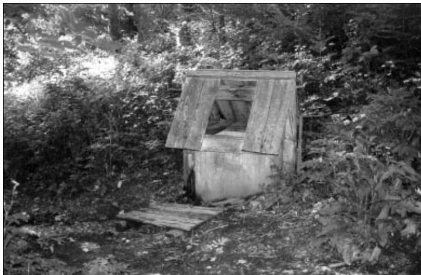
Photo 3. Spaasaa lähe in Kabrio.