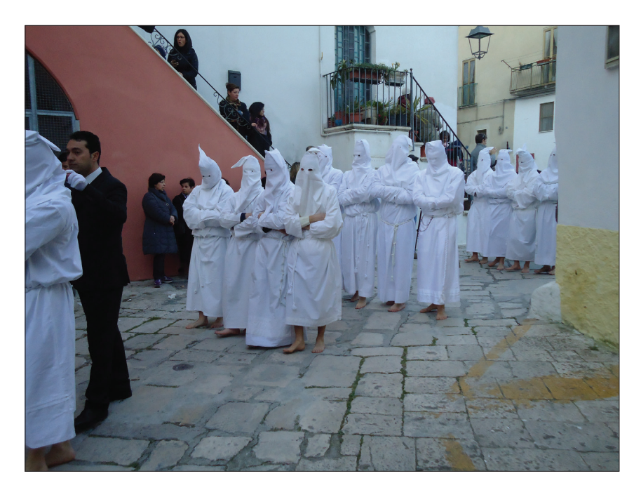
Figure 6. A group of incappucciati (hooded men) in the Good Friday procession in Castellaneta.