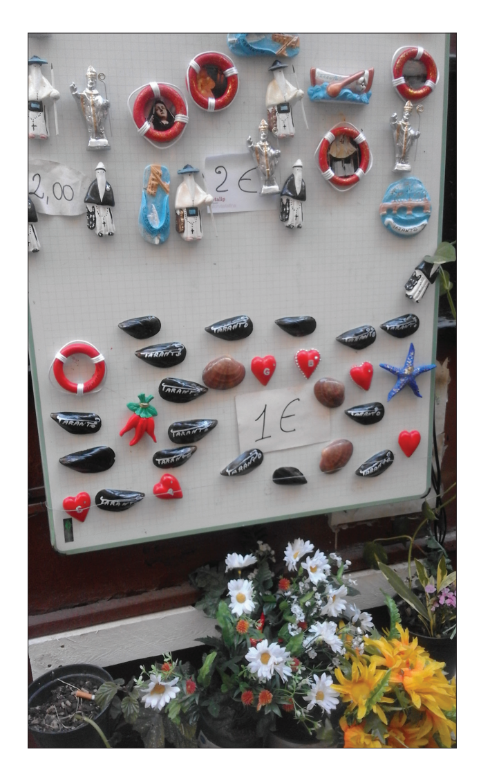
Figure 9. Gadgets representing figures of the Holy Week (those costing 2 euros) displayed in a little shop in Taranto.

"Everybody is called to do their part, to be an actor of the rite," but it is quite clear that the most important and significant part is usually played by a particular kind of formal associations, widespread and deeply rooted everywhere in the south of Italy – the laical confraternities. <sup>15</sup> These men and women, united by a common religious sentiment establishing a mutual solidarity (regardless of their different cultural, social or economic standing), <sup>16</sup> are gathered around