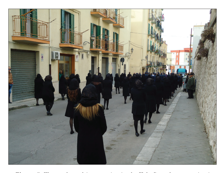
Figure 7. Women dressed in mourning in the Holy Saturday procession in Castellaneta.