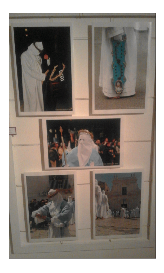
Figure 8. Pictures devoted to the Holy Week, displayed in a public exhibition in Castellaneta.

Procession has fundamentally the effect of gathering a whole community by suspending, though for a limited space-time, the real or ideal split of the town and its inhabitants. The procession is a moment of cohesiveness and solidarity where ... everybody is called to do their part, to be an actor of the rite.