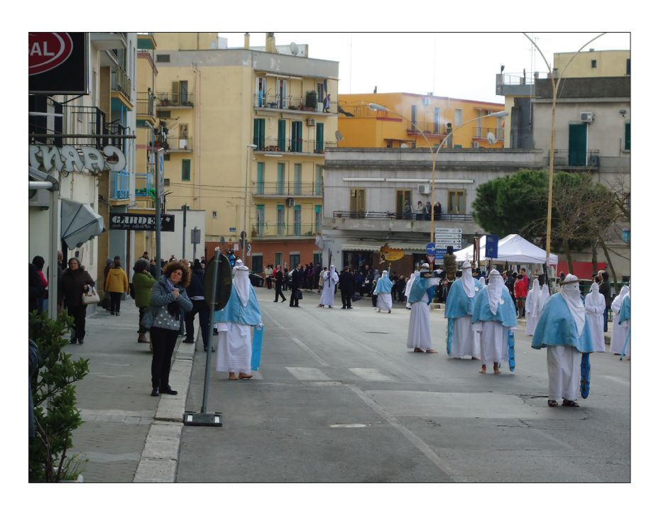
Figure 5. A group of Brothers of the Santissimo Sacramento (Holy Sacrament) in procession in Castellaneta on Holy Saturday. Photograph by Vito Carrassi 2015.