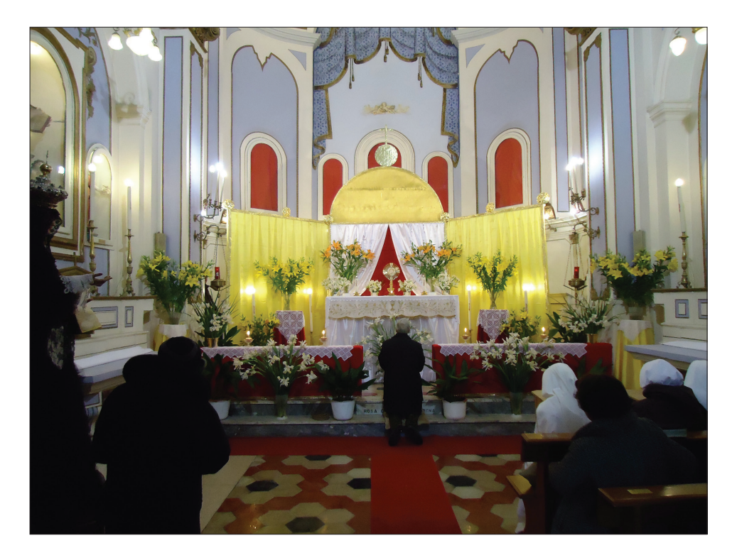
Figure 1. Sepolcro set up for Maundy Thursday in the church of Misericordia (Mercy), Vico del Gargano.

(or from above, through windows or on balconies), and finally, after some hours (from a minimum of about 3 hours, like in Vico del Gargano, to a maximum of 16-17 hours, like in Taranto), comes back to its starting point, drawing a sort of circular itinerary. This procession generally consists of papier-mâché and/ or wooden simulacra representing the figures and the moments of the Passion and Death of Jesus Christ, known as the Misteri, whose number varies from two in Vico del Gargano to over 40 in Valenzano (near Bari), with an average of 5-10 simulacra (see Fig. 2 & 3);10 their carriers and escorts, first of all the confraternities (see Fig. 4 & 5), often joined by other people (sometimes in the form of incappucciati , that is, individuals covering their face by a hood) expressly recruited for the procession (see Fig. 6); men and women usually dressed in black to express their mourning – to this end, the women escorting Our Lady of Sorrows sing mournful songs (see Fig. 7); ecclesiastical, civil and military authorities; musical bands playing funeral marches; and, at the end of the parade, a gradually growing crowd of the common faithful who leave their place on the borders of the street as audience and join the procession.<sup>11</sup>