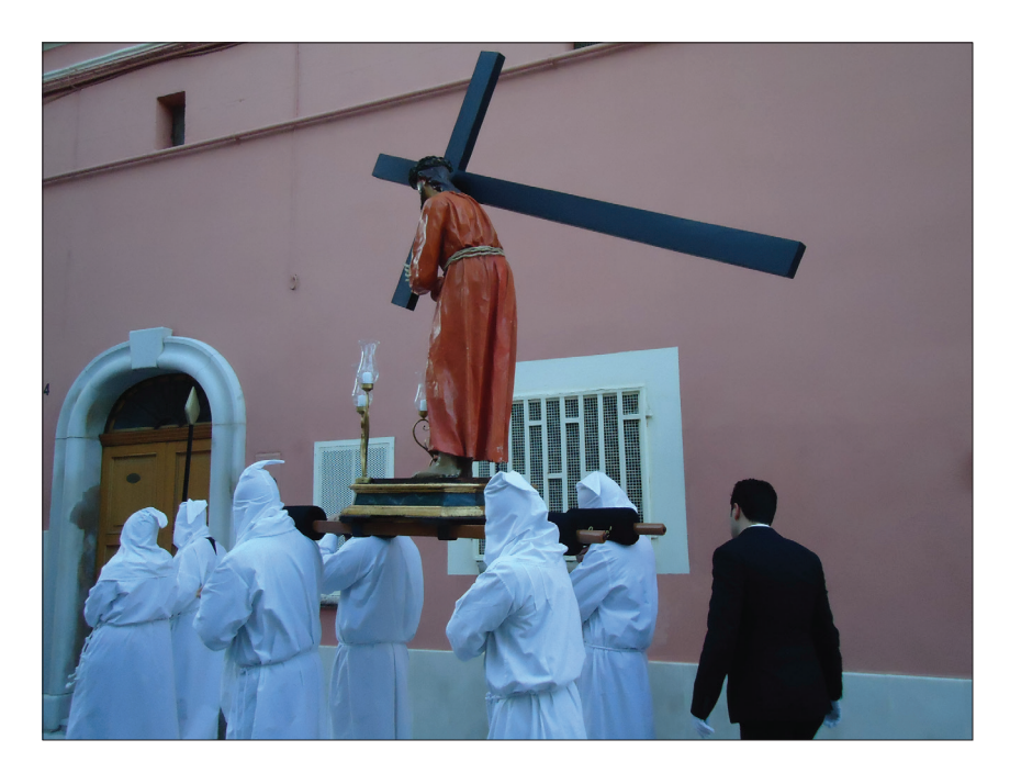
Figure 2. Christ carrying the cross, one of the simulacra carried in procession in Castellaneta on Good Friday.