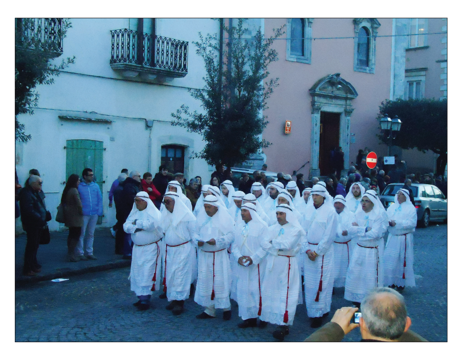
Figure 4. Confraternity of San Pietro (Saint Peter) in procession in Vico del Gargano on Good Friday.