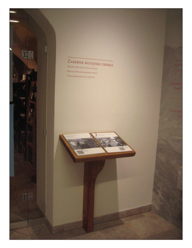
Figure 1. Private collections are represented in the main exhibition hall of the Walk of Peace.

is notable that the soft image of a dove almost diametrically opposes the dramatic image of the breakthrough, which is symbolized in the Kobarid Museum's logo (Fig. 2 & 3).