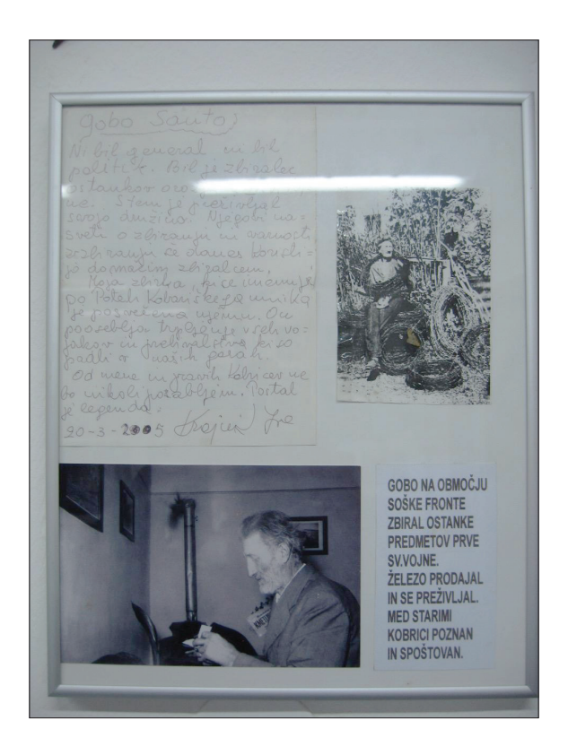
Figure 6. A dedication to a forerunner of the collectors of the Isonzo Front materials, an Italian soldier Gobo Santo. The museum collection The Paths of Retreat at Kobarid 1917 in Kobarid.