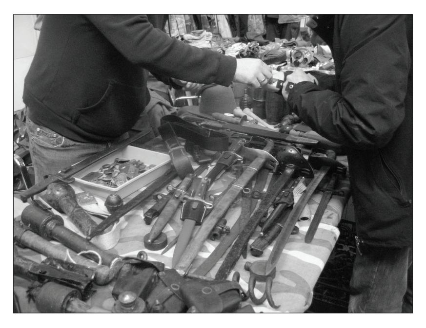
Figure 11. The First Word War antiquities market in Šempeter pri Gorici, organized by the Isonzo Front association. Photograph by the author 2016.