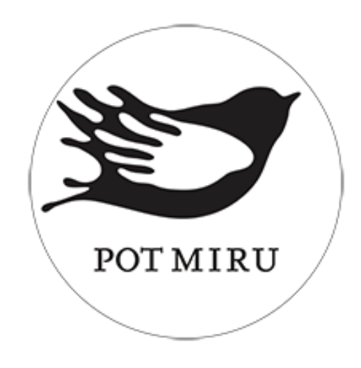
Figure 2 & 3. Two styles of narratives about the Isonzo Front as seen in the logos of the Kobarid Museum (left) and the Walk of Peace (right).

In the next decade, the Walk of Peace made an enormous effort in preparing the landscape for cultural tourism. Battlefields were presented in a scholarly manner, trenches were cleaned, equipped, and preserved, and outdoor museums were established on the frontlines and connected with a thematic trail from the Alps to the Adriatic (see Koren 2015). Specialized tourist guides were educated and trained for the area, a new documentation-information center was established, thematic exhibitions, conferences, and other First World War-related events were held, and, last but not least, EU funds were obtained through various cooperation and cross-border programs and projects. All of these activities and many more also attracted various heritage specialists, museum curators, professional historians, and other social scientists and scholars in the humanities. In two decades or so, the front was given a scholarly touch, promoted, adapted for tourism, and made ready for the global commemoration of the First World War centenary (2014–2018; Fig. 4).