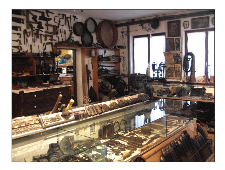
Figure 9. A military artifact section against an old agriculture-related section in a private collection. Ethno-war collection in Breginj. Photograph by the author 2017.

with this flow, the early collectors started using metal detectors as soon as they became available, but many of them also turned their interest away from weapons to small personal items of soldiers, which bore more potential for imagining the experience of war. Last but not least, some also turned away from the war altogether and found more excitement in older, even prehistoric items that, in the best possible scenario, led them to consult with an archaeologist (Fig. 10).