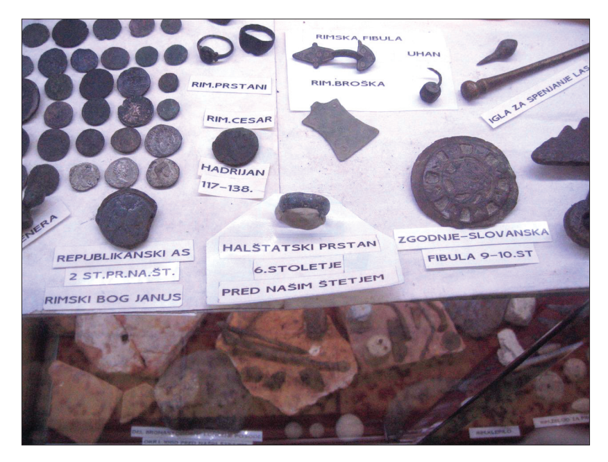
Figure 10. A 'big find': a Hallstatt ring from the 6th century BC confirmed by archaeological analysis as an important find of the local area. The ethnowar collection in Breginj.