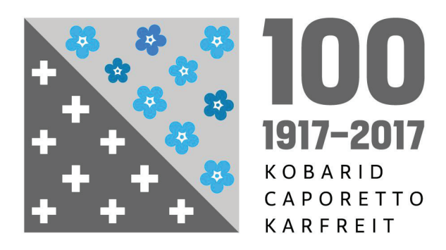
Figure 4. The Walk of Peace logo for marking the First World War centenary.

bodies, which does not directly suppress the creativity, passion, and subjective initiatives, but selects and tolerates them. As long as the new ideas and initiatives fit into the general ideological order of commemoration of the First World War and sustainable tourism development, they can fruitfully enrich the equipped, clean, and sanitized caverns, trenches, and fortifications or – for better or worse – add new ones. This order is therefore not stifling and dominating in the Adornian sense of "cultural industries". It instead promotes inclusiveness, which is epitomized in the softer concept of "creative industries".