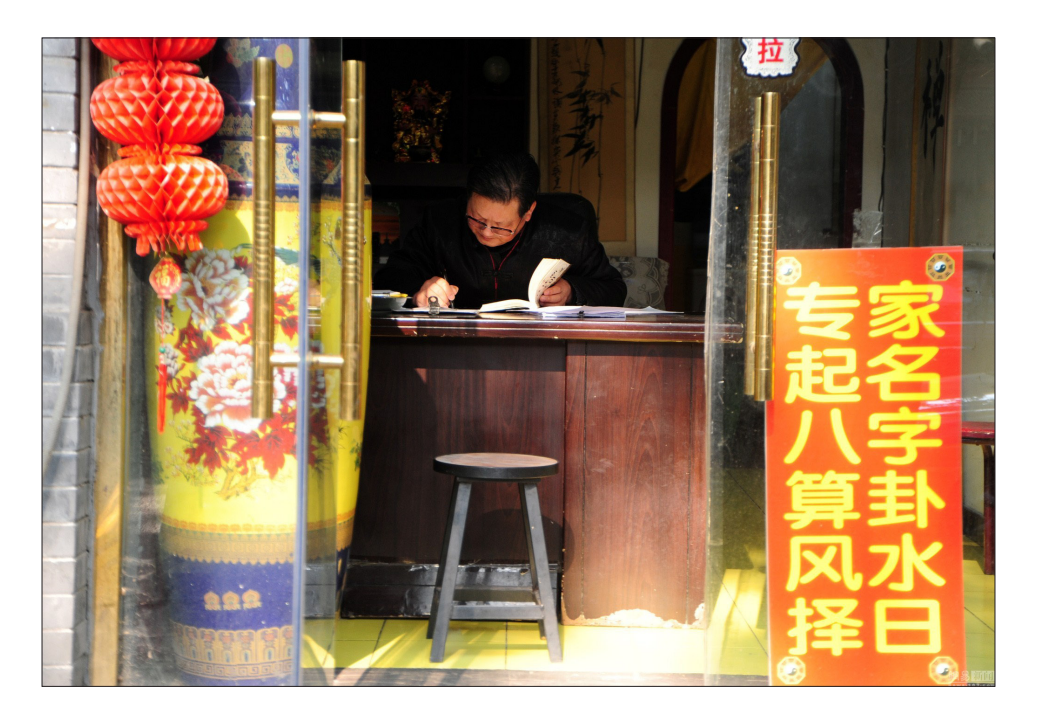
Figure 6. Fortune-telling street in Beijing.

not be able to go abroad to study. After several unsuccessful attempts between 2011 and 2015, he finally secured sufficient funding for overseas education in October 2015, and was very likely to study at a college in Canada in 2016. He added, "The pen spirit is not always bullshit. That's why we love pen spirit movies." He also believed that most of his peers believed in pre-determined destiny more than in free will.