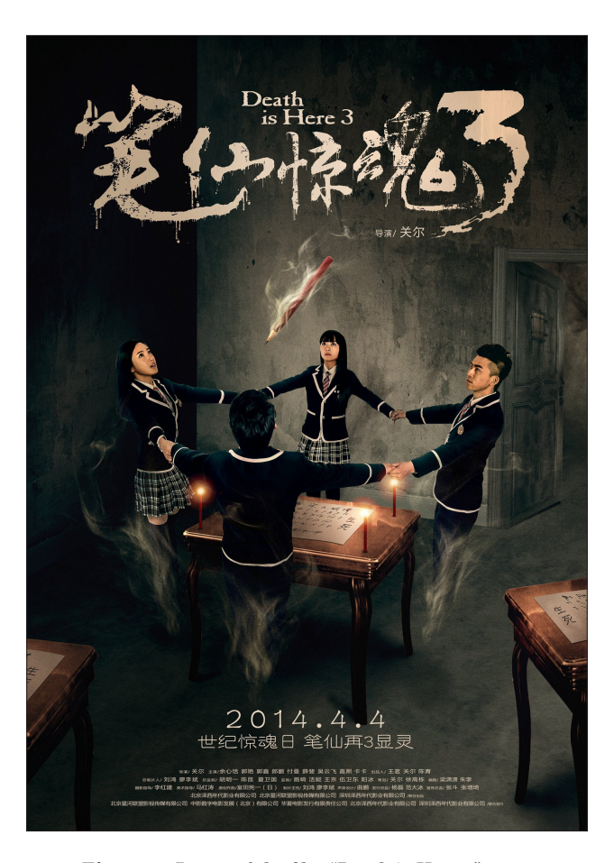
Figure 1. Poster of the film "Death is Here 3", 2014.

Notably, the latter did become successful, as it ranked number ten on the top ten Chinese box office records in 2012. The success of such films – at least in terms of frequent media coverage – has triggered my interest in examining how popular culture reflects the contemporary Chinese society through the lens of its past and present belief traditions and trends.