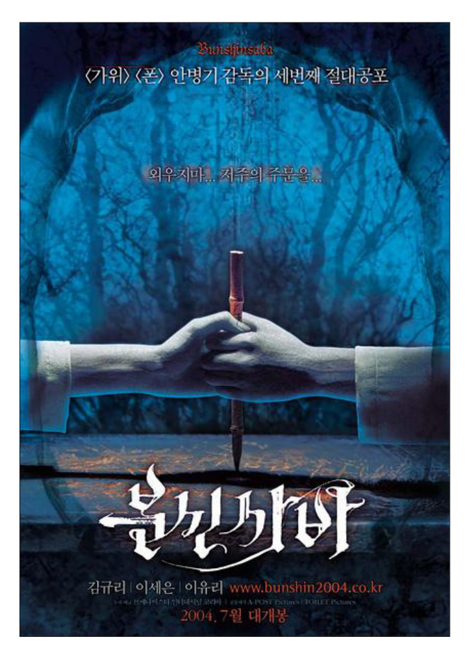
Figure 2. Poster of the film "Bushinsaba", 2004 (PRC public domain http://www.publicdomainpictures.net).