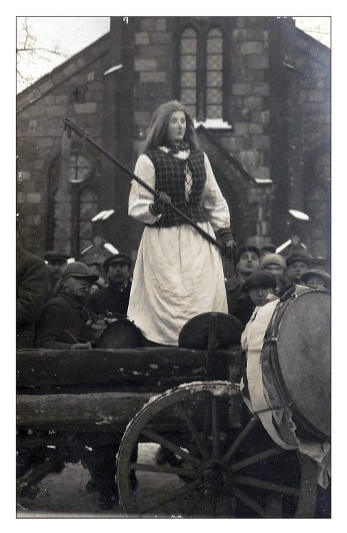
Figure 1b. Morė. Tubausiai, 1932. MFL 949.