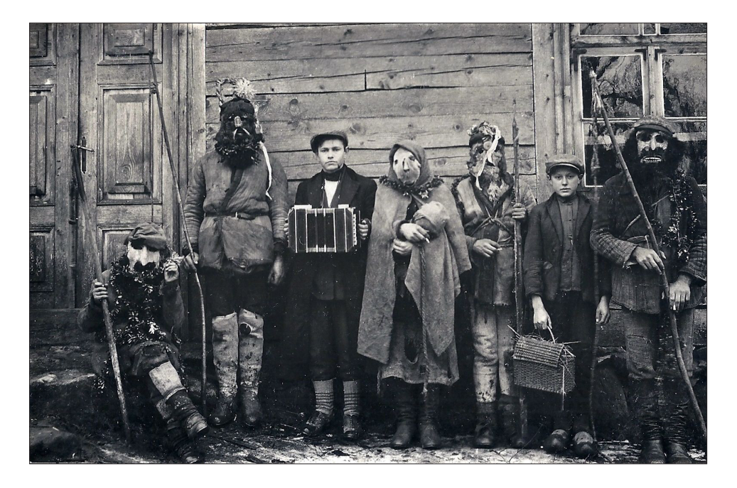
Figure 1a. Masked youth. Salantai, 1923. MFL 949.