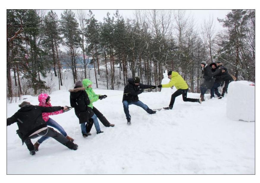
Figure 6c. Competition between Kanapinis and Lašininis teams.