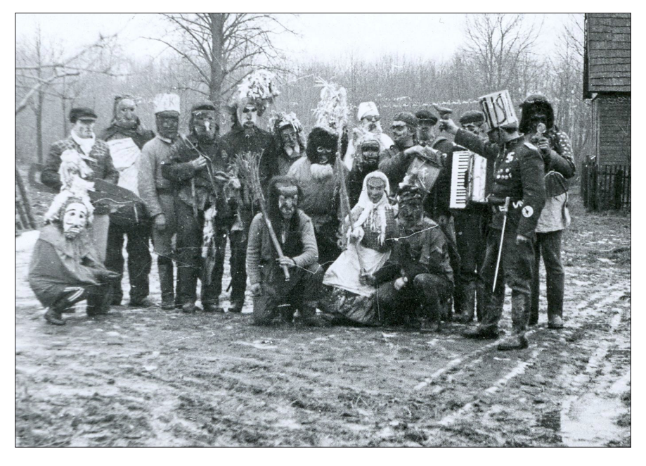
Figure 3. Užgavėnės. Plateliai, Plungė district. Photograph by Juozas Mickevičius 1973. MFL, photographic negative No. 80111.

In 1959, the Spring Festival, which was to replace Easter, with the main role played by Old Man Cold, who symbolised the winter period and handed the keys over to Young Man Spring, began to be celebrated (Vyšniauskaitė 1964: 554–556). But this festival did not embody the symbols of the changing of the seasons and did not become established; nor did the Harvest Festival carnival organised in September–October (ibid.: 556–558). These newly created festivals disappeared whereas Užgavėnės survived. A festival that evokes no connection with any tradition, as has been mentioned by Catherine Bell, is apt to be found anomalous, inauthentic or unsatisfying by most people (Bell 1997: 45).