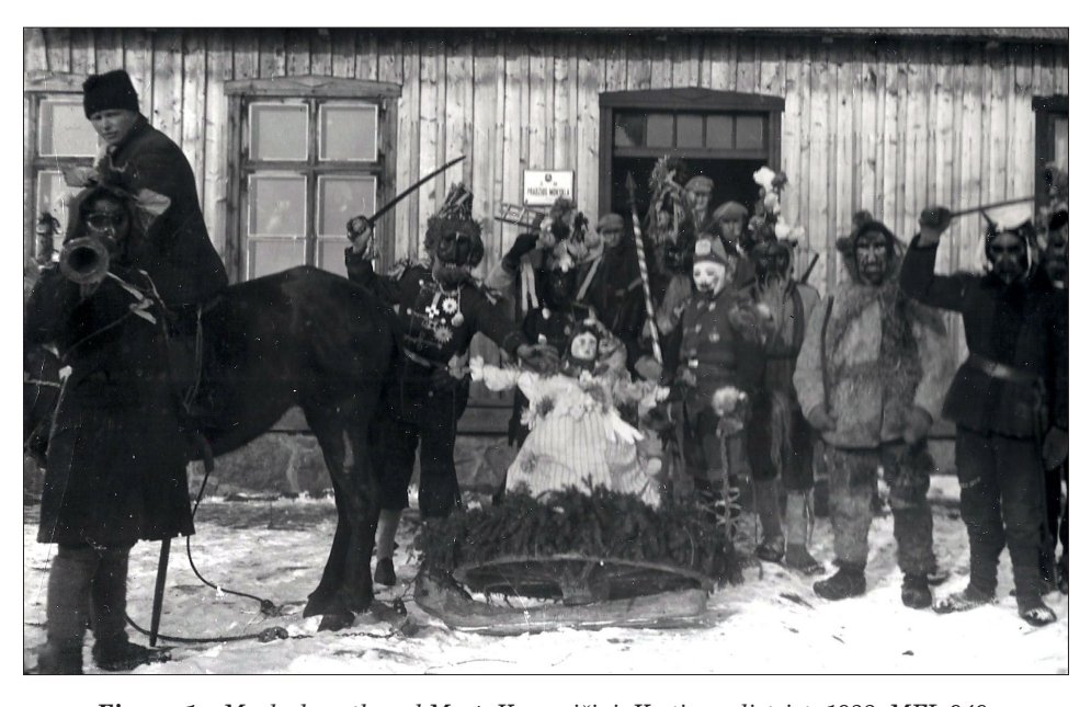
Figure 1c. Masked youth and Morė. Kurmaičiai, Kretinga district, 1933. MFL 949.