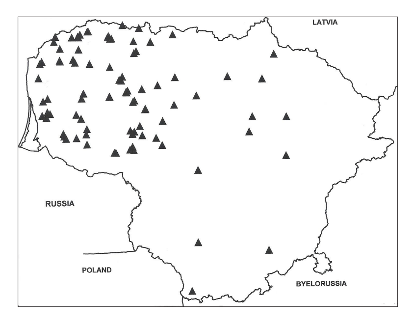
Figure 2. Youth outdoor fete at Užgavėnės (1920–1940) (Šaknys 2001a: 51).

reconstruct the ritual behaviour of the Užgavėnės costumed processioners as paying special attention to girls. Like in other Western European countries, the Samogitian costumed processioners went to 'buy spinsters and barren women' (Lith. bergždininkė, literally a barren animal), tested how fat they were, forced them to kiss the ground through their apron, jokingly sprinkled them with 'holy water', 'incensed' them with smoke from a pot with embers, jabbed their hands with a nail or used a needle affixed in a mask, etc. (Balys 1993: 50–56). It is also difficult to explain how older people during the interwar period tolerated the abuse that these girls experienced. Genovaitė Jacènaitė described it as follows: