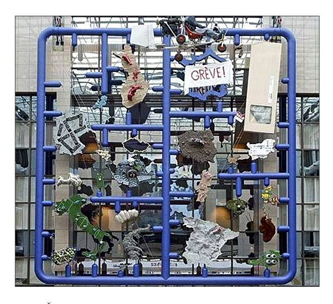
Figure 1. David Černý, "Entropa".

The installation, by the Czech artist David Černý, "Entropa" hanging over the entrance into the European Union (EU) building in Brussels, became one of the biggest misunderstandings of 2009. The installation, dedicated to the begin-