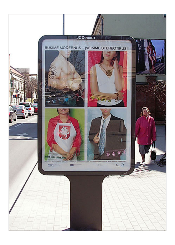
Figure 4. Poster "Let's Be Modern and Defeat Stereotypes".

were displayed and their goal was to attract society's attention to gender stereotypes and to encourage change. There were photos of a man with a vacuum cleaner tattoo on his hands, a woman with automobile keys hanging on her neck, or another one wearing an apron with the coat of arms of the Lithuanian Republic, a man in a suit surrounded by babies. Every photo had captions like: "Women can take part in politics", "Women can do hard work", "Men can do house-cleaning" and "Men can be baby-sitters". But the chosen way of impact was rather traditional, conservative and very stereotyped.