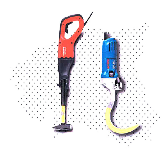
Figure 3. Entropa Estonia.

The installation gained serious assessments among politicians and the press. EU representatives even considered an option to deconstruct the installation but gave up avoiding accusations about art censorship. In the Lithuanian press a popular reviewer, taking everything for granted, compared Lithuanian and Estonian (supposedly of Sirje Sukmit) visions: