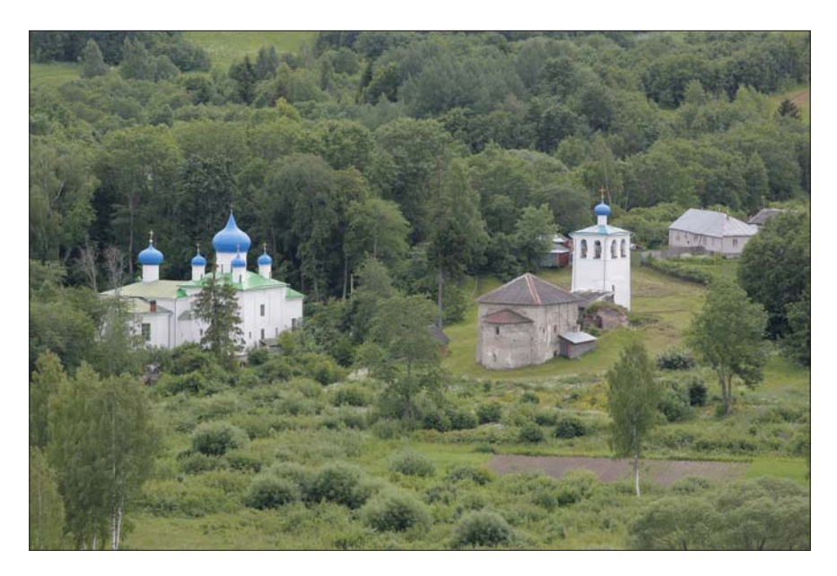
Photo 2. The Church of the Nativity in Mõla (Maly), built in the mid-16th century. The bell tower and ruins of the Monastery of the Nativity in Setomaa. Photo by Arne Maasik 2008.

In addition to the Pechersky Monastery, the Mõla ( Maly ) Monastery may also have contributed to spreading Orthodox religion among Setos in the 16th century. Some researchers claim that the Mõla Monastery played a vital role in Christianising the natives of Eastern Setomaa (see Setomaa 2009: 240). A Monastery of the Nativity was founded in Mõla in the middle of the 16th century (according to folk tales, the monastery was already established in the 1480s by St. Onufri of Mõla). The stone buildings, partially preserved, were constructed in the mid-16th century, and the Church of the Nativity, still standing to this day, was probably built as early as before the Livonian War. Most of the monastery buildings were destroyed in 1581 by the army of the Polish king Stephen I Báthory.<sup>18</sup>