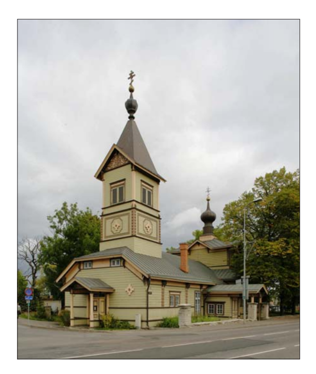
Photo 6. The Church of St. Simeon and the Prophetess Hanna in Tallinn (completed in 1755).

to replace the Nikolai (St. Nicholas') Orthodox Church, which dates back to the Medieaval period and was falling apart by the beginning of the 19th century. There was a desire to build a new church as early as 1804, but it was not built until 1822–1827; the construction was drawn out due to lack of funds. The domed church, with some Neo-classicist features, was built according to the design of L. Rusca from St. Petersburg, who was Swiss by origin (Berens 1974: 364–365; Pantelejev et al. 2002: 26–36; Tallinna 2009: 43).