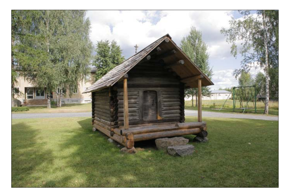
Photo 4. Mikitamäe Tuumapühäpäävä (Toomapühapäeva) tsässon after restoration in 2009.