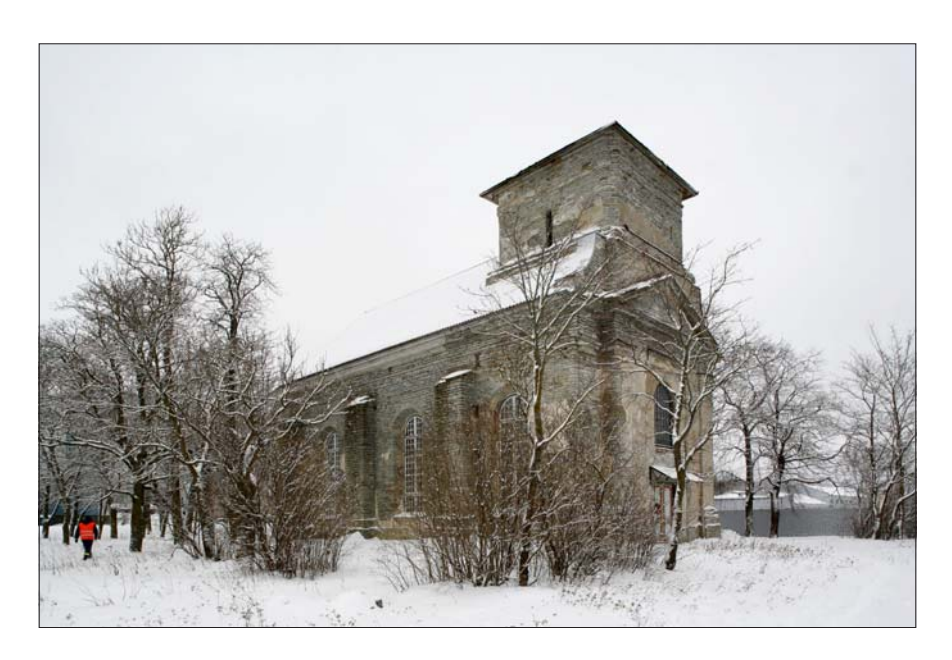
Photo 8. The Church of St. George the Great Martyr in Paldiski (consecrated in 1787).

Following the incorporation of the island of Saaremaa into the Russian Empire in 1710, an Orthodox community of Russians also formed on Saaremaa,