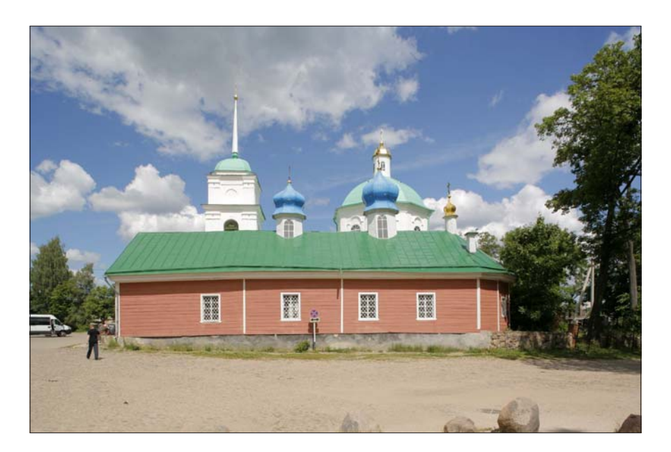
Photo 10. The Church of the Holy Great Martyr Varvara (Barbara) in Petseri/Pechory (completed in 1779). Photo by Arne Maasik 2008.