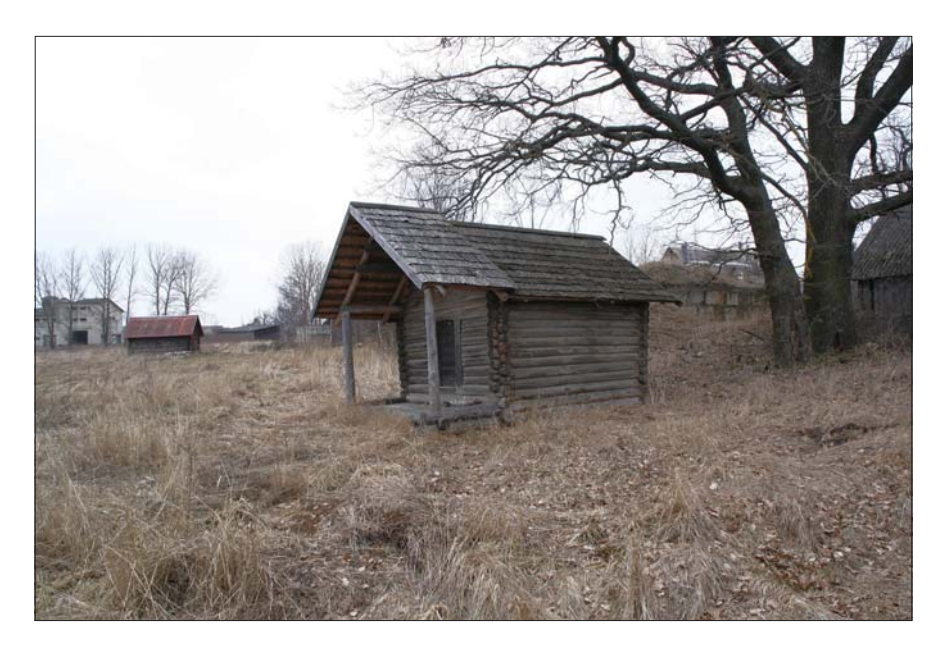
Photo 3. Mikitamäe Tuumapühäpäävä (in Estonian Toomapühapäeva, for Setos also ollõtuspühä or kõllapühäpäävä or väiko lihavõõdõ) tsässon. According to dendro-dating, the oldest tsässon, preserved within the Estonian territory of Setomaa, built probably in 1694. Photo by Arne Maasik 2008.