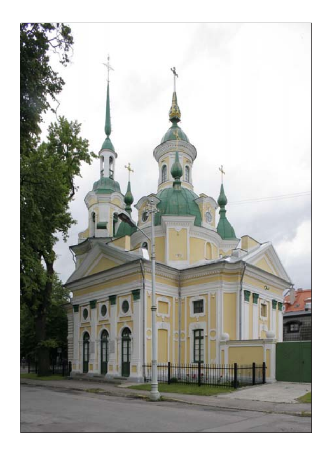
Photo 7. The Church of St. Catherine the Great Martyr in Pärnu (consecrated in 1769).

In Pärnu , the Jaani (St. John's) Church, which belonged to the Estonian Lutheran congregation, was taken over in 1710 to hold Orthodox services and sanctified as the Uspensky Church. This congregation was later reformed as the Katariina (St. Catherine's) congregation. Probably shortly after that, in 1710, a new Alexander Nevsky garrison church was built. In the 1740s, this wooden church was replaced with a new wooden one, which stood from 1749 to 1791.