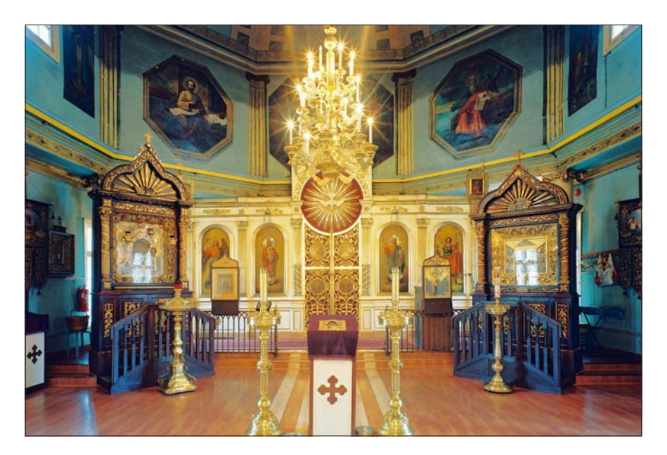
Photo 5. The Church of the Nativity of the Mother of God (Kazan Icon) in Tallinn (consecrated in 1721). Photo by Arne Maasik 2009.

The church was reconstructed in the first half of the 19th century: the building was covered with wood boards and both the interior and the exterior were given a period-specific Neo-classicist appearance.<sup>40</sup> By 1734, the Church of Teodoros (St. Theodore) the Commander was built in Tallinn and existed until 1842 (EÕK 2007: 26, 40; Berens 1974: 351, 369).