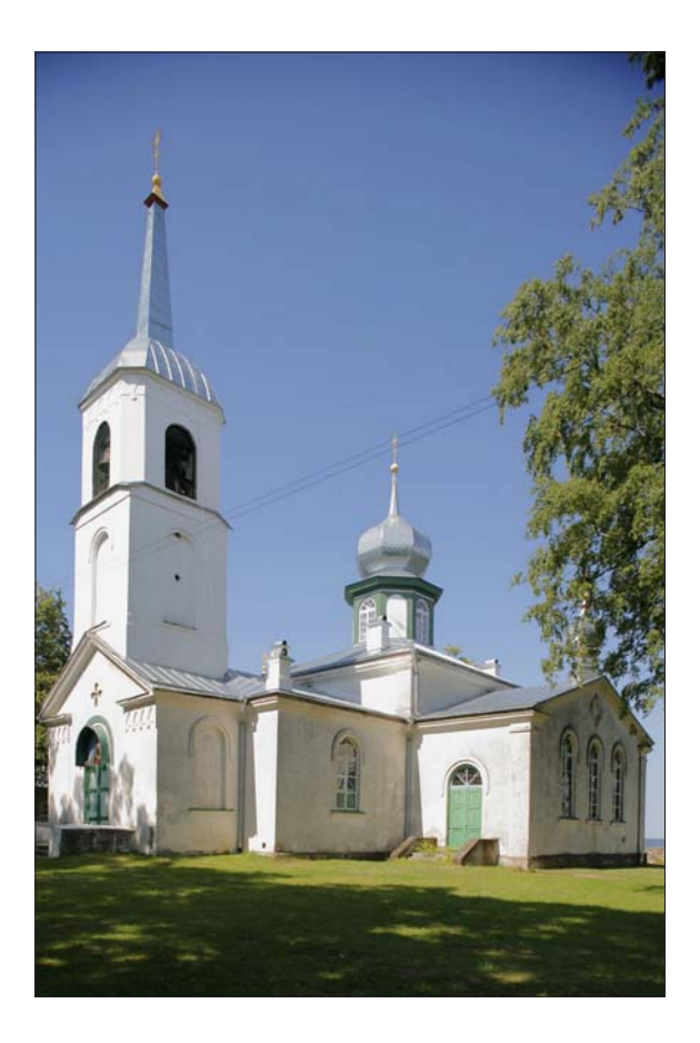
Photo 9. The Church of the Protection of the Holiest Mother of God in Nina (consecrated in 1828).

The Church of the Protection of the Holiest Mother of God was built in the village of Nina , the main population centre of the Old Believers, situated on the shore of Lake Peipsi. The village of Nina is the also oldest surviving village of Orthodox Russians on the western shore of Lake Peipsi, and was probably founded in the 17th century (Moora 1964: 60). By the time the church was built, Nina was the only almost exclusively Orthodox village in the region predominantly inhabited by Old Believers. Previously, the sparse Orthodox population had been without a church of their own. The congregation of Nina was established in 1824 and the church was designed by G. F. W. Geist, a master builder from Tartu (Tohvri 2004: 56). Construction work took place from 1824 to 1828, and the church was erected on a plot bestowed by Baron Stackelberg. The construction was funded by the state with the help of private donations, including those from local Lutheran landlords.<sup>50</sup>