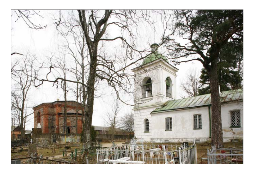
Photo 11. The Church of St. Paraskeva the Great Martyr in Saatse (consecrated in 1801).