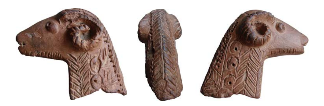
Figure 1-3. Left (1), back (2) and right (3) side of the ram. Photos from History Museum of Pernik, 2007.

protome – an object of cultic usage (Fig. 1–3). The place where it was found was most probably a site of an ancient sanctuary, on which a Christian church had been later built. Archaeologists dated the artefact to a period from the 2nd to the 4th century. Several other objects had been discovered in the vicinity: a bas-relief of Mithra, a figurine of a bird, and Roman and Thracian coins (Mitova-Dzhonova 1983: 22).