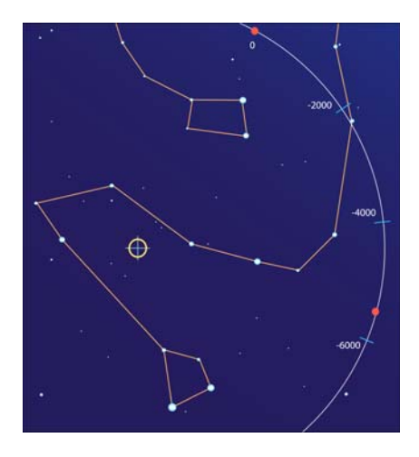
Figure 7. Ursa Minor, Draco constellation and the World Pole during the last few milleniums.

The configuration and the number of signs in this group are identical to the configuration and the number of major stars in the Draco constellation (Fig. 6). The sole difference is in the last two "stars" in the front part of the image. It is possible that they belong to another constellation - Ursa Minor (stars Beta and Gamma). The eye of the gryphon corresponds to the location of the point of the North Pole of the ecliptic in the Draco constellation.8 At the beginning of the 1st millennium, the World Pole was also situated close to the Beta star of the Ursa Minor (Fig. 7). It might be that this is exactly what is marked, in the form of a concavity, above the last (next to last) sign in this group (Fig. 8).