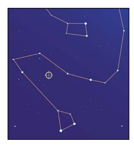
Figure 6. Ursa Minor and Draco constellations.