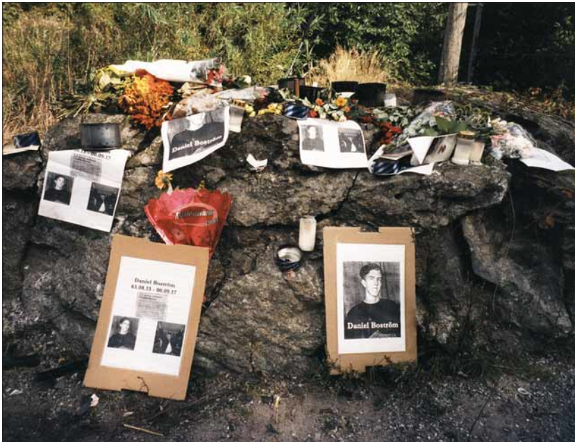
Figure 4. A 17-year-old boy from Västra Frölunda in Gothenburg lost his life after crashing his car in this mountainside in September 2000. The next evening his young friends gathered at the site and placed there several photographs of the victim, flowers and numerous lighted candles and torches.

I had the opportunity to conduct a documentation of a memorial event in Morlanda on the island of Orust in September 2000. A seventeen-year-old boy from Västra Frölunda, a suburb of Gothenburg, crashed his car one night on a