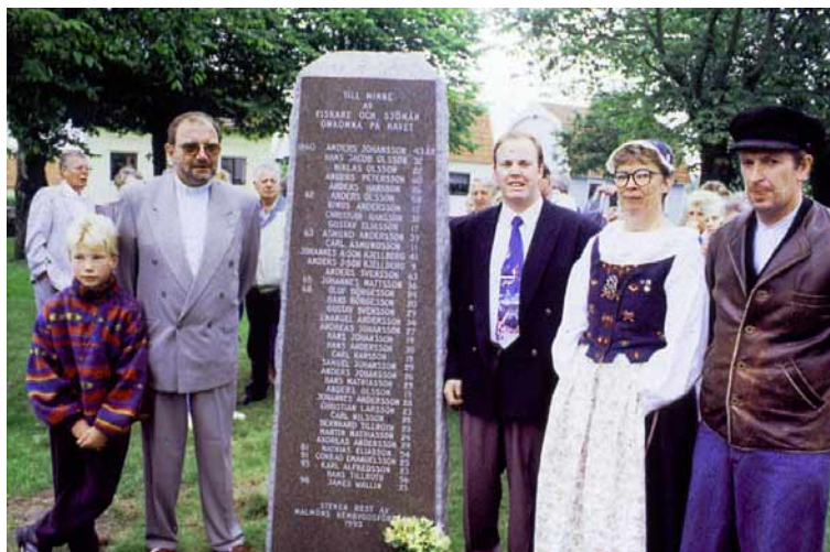
Figure 2. The consecration ceremony in Bohus-Malmön in 1993 carried out by a clergyman with the participation of many local inhabitants.

The dedication ceremonies have been conducted by clergymen with the participation of local historians, former fishermen and seamen (Fig. 2). The names of all the dead victims are read out and a wreath placed in front of the memorial. The clergymen's participation has given a spiritual dimension to the ceremony similar to that taking place at an ordinary funeral service, something that those who died at sea had never benefitted from. A great many local inhabitants, both old and young, men and women, have been present at these ceremonies as has been reported in regional newspapers. About two hundred people attended the ceremony at Lyse near Lysekil in 2002 ( Bohuslänningen 2002). The memorial consequently becomes a communal concern of interest to the entire local populace. Many local people have relatives among these long-dead victims.