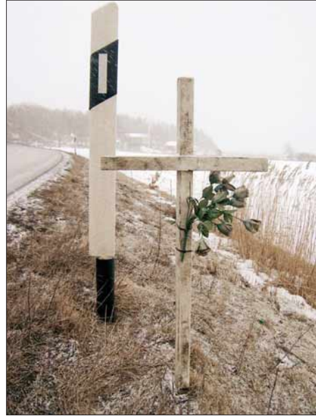
Figure 3. A wooden cross in Stala that was put up after an accident at a sharp bend in the road in 1997. Photo by Anders Gustavsson (2004).

cross that I photographed after an accident in Hälleviksstrand in Orust Municipality, Bohuslän in January 1998, disappeared after a period of about three months. Another cross in Stala, in Orust, that was set up after an accident at a sharp bend in the road in October 1997 still stands and is regularly decorated with plastic flowers (Fig. 3). This cross is very conspicuous and easily observable. The memory of a fatal accident and a warning of the dangers in traffic are indeed combined in this example. The cross therefore will retain its significance for wayfarers in years to come, not just in the months immediately following the accident.