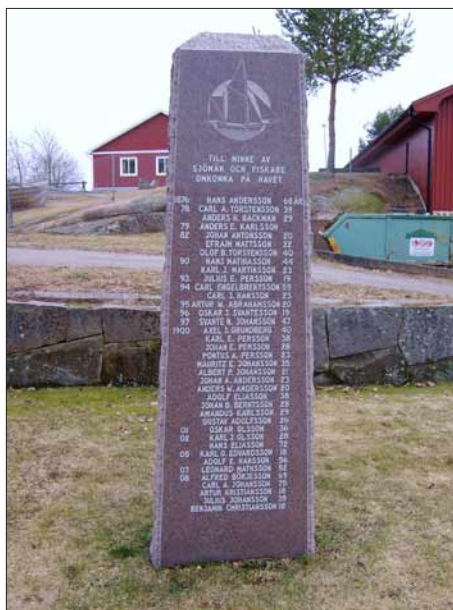
Figure 1. The memorial stone erected in 2002 in Lyse cemetery in commemoration of fishermen and mariners who were lost at sea during 1876–1908 and 1909–1950.

memorials and their dedications. Such articles have given other local communities an incentive to erect new memorials. Many of these latest memorials have been put up through the efforts of local historical societies. This is due to a wish to emphasize the importance that the dead men had in local history despite their not having been buried in their home ground. They would no longer remain anonymous, but were at last to be visibly remembered and honoured for their work at sea on behalf of home communities. On Kåringön, a total of 157 men were honoured. After the ceremony in 1993, one of the older wives of island fishermen, who had been instrumental in raising the memorial, said