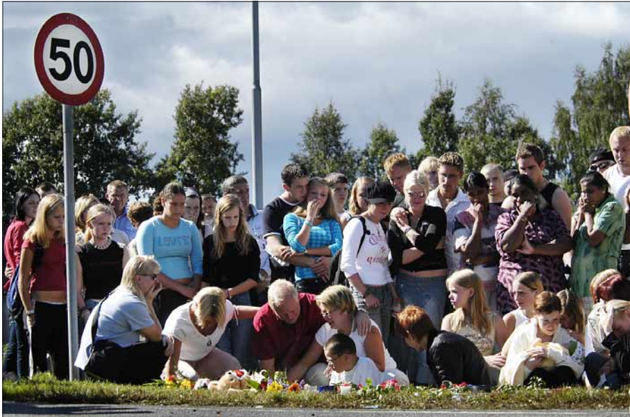
Figure 5. About 150 young people assembled at the scene of a traffic accident in 2003 near Oslo on the day after three local youngsters died after colliding with a bus.

enced as being communal. Over 500 young people took part in a memorial service in Randaberg Church in 2000 after three local young people had been killed due to crashing into a tunnel wall. Photographs of the victims and lighted candles were placed at the entrance of the church ( Aftenposten 2000a). It helped us all when we saw that almost the entire community was present , said the local sheriff when nearly 300 people gathered in Eggedal's community centre in Buskerud county after two young men were killed in 2002 when their car crashed into a building ( Dagbladet 2002b). In addition, a huge crowd of people cannot gather together on a highway of heavy traffic after a fatal accident, but must find some other and larger venue for holding the memorial ceremony.