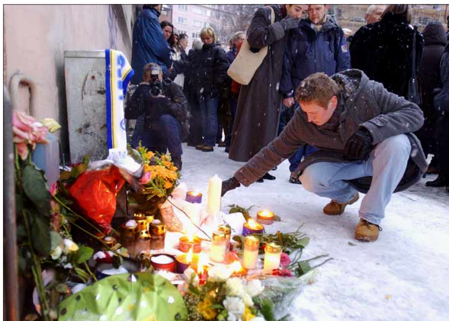
Figure 6. Many young friends assembled at the site of murder when a young man, 23 years old, was killed outside his home in Oslo in 2002.

Ritual expression is felt to be necessary not only at the scene of a murder but also in the public sphere where many people can gather together, as has been shown in connection with deaths due to traffic accidents (see above). In the public space, people can experience solidarity and give collective expression to their grief and protest against the traumatic situation that has arisen. On the evening after Sabina's murder in Arvika, more than 2,000 people came together in the town square to take part in a memorial ceremony for both Sweden's foreign minister and for little Sabina. Here no distinction was made as to social class or age. Death obliterates all social stratification. The mes-