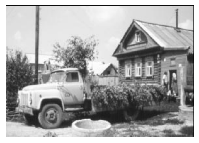
Photo 6. Truck box decorated with branches. July 1989, in Povodimovo.

The coffin is either carried to the graveyard, or taken on a truck. The truck box is decorated with green boughs. The closest relatives sit in the truck box around the coffin and wail. When walk-