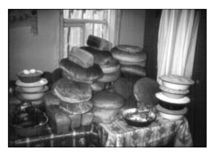
Photo 5. Gifts were received by an older woman who placed them on a table. Povodimovo, July 1989.

The deceased is taken outside at high noon, whereas the coffin remains open. At a funeral witnessed in 1989 in Povodimovo, the coffin was abruptly lifted up and hit against the doorjamb on its way out. The pallbearers were usually male relatives of the de-