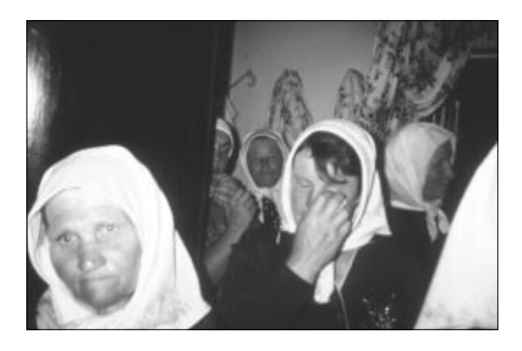
Photo 4. In both villages it was argued that female relatives of the deceased wear a black scarf as a sign of mourning; however, on the funeral I attended in Povodimovo, all scarfs were white. July, 1989, in Povodimovo.

neighbouring Mordvin village Kabajevo only a candle is brought to the funeral.