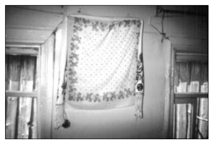
Photo 1. For during the spirit's leaving time, mirrors as well as other reflecting surfaces are covered up with a towel. Some believe this to ease the situation for the dier, while others consider reflection dangerous for the living. July, 1989, Povodimovo.

For the time of departure all mirrors and reflecting surfaces in the room are covered with a towel. Some people believe it to ease the