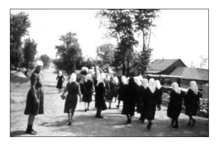
Photo 7. Only those closest to the deceased go to the funeral to bury the body (kulõn kalmama); the rest start with the funeral feast. In Povodimovo, July 1989, the truck carrying the coffin and relatives led the procession, followed by women and gravediggers on foot.

Several rules had to be followed when a funeral procession happened to pass. In Sabajevo it was forbidden to cross the road near a