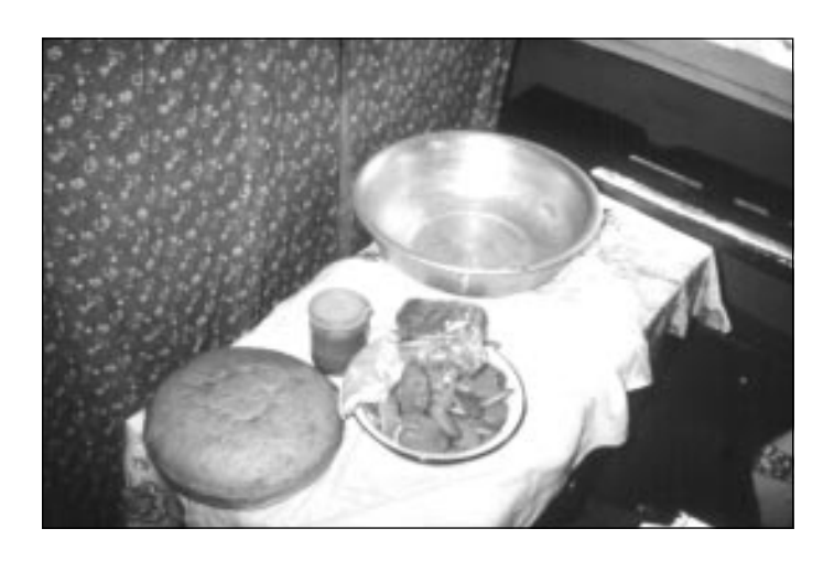
Photo 2. In Povodimovo it was said that for during the time of the spirit leaving, a glass of water was put into the holy corner so that the spirit could go into water after leaving its body; after death the table was covered with food and beverages. However, the basin of water seen in July, 1989 in the dead's chamber would be more suitable for washing; bread, biscuits and honey were food for the deceased.

1965: 51, 52), whereas a Slovenian mountain tribe poured water in the dying one's face (Kotliarevski 1891: 210).