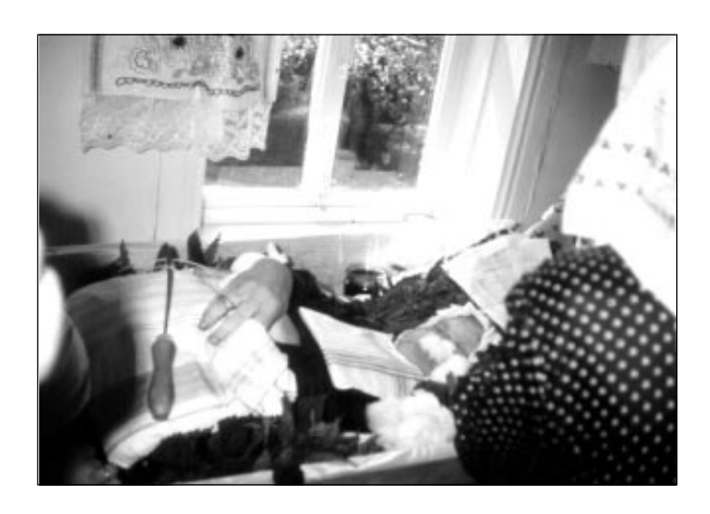
Photo 3. The deceased in coffin. The wire twisted around the finger is also twisted around the sickle lying on the stomach; the other end of the wire is in a vessel full of soil so there would be "ground connection". The deceased is surrounded by nettles, on the right beside the head is a glass jar with potassium permanganate solution. On the wall beside the window is a iconic scarf hanging, under which the deceased's spirit stayed for six weeks. July, 1989, in Povodimovo.

for "ground connection". The same is done in Povodimovo, except the other end of the wire is stuck into a pot filled with soil under the bed of the deceased. An ancient custom of placing a sickle on the chest of the corpse (Zelenin 1938: 90) is still followed in Povodimovo. Under the bed they keep a bowl of cold water. One of the earliest and most common customs has been the placing of iron cutlery on the body or at its side (Eisen 1897: 50; Raadla 1939: 31), with the intention of keeping away evil spirits (Waronen 1898: 60; Chursin 1905: 66; Sartori 1910: 137). Soil and water have been used as means of preserving for the same purpose also elsewhere.