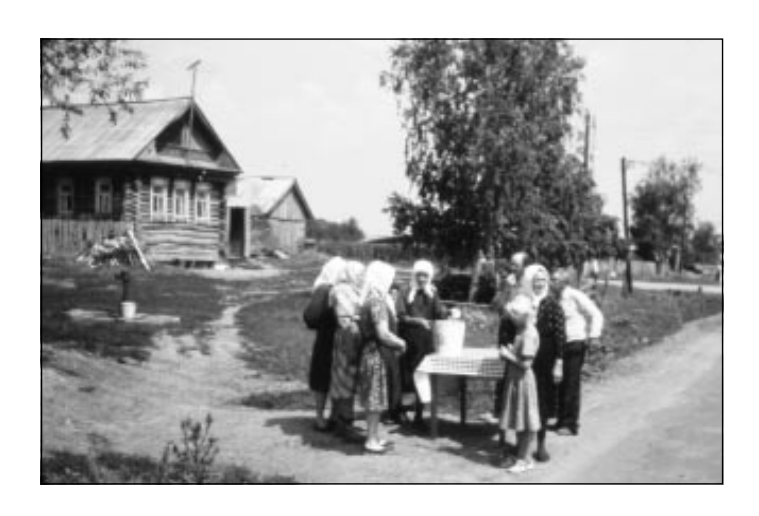
Photo 8. In Povodimovo, the funeral procession made a stop when passing houses of the deceased's relatives. In every stop, a small table with candies, apples, biscuits and other snacks as well as wine and vodka was set up beside the road for those participating the funeral. July 1989.

was going to die that year. The same day on her way home from the graveyard she fell from a bridge to ice and was found dead the next morning. When the grave was finished, one of the diggers went home to tell the others about it, while all the other diggers waited at the graveyard. But if the grave diggers had to bear the coffin as well then at least one man stayed behind at the cemetery to protect the grave against evil spirits. Such beliefs concerning the grave were common for other Orthodox peoples as well (Paulaharju 1924: 103; Kremleva 1980: 25; Karely 1983: 148; Konkka 1985: 57; Mikkor 1995: 1912).