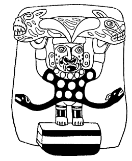
Figure 6. The deity holding a heavenly dragon.